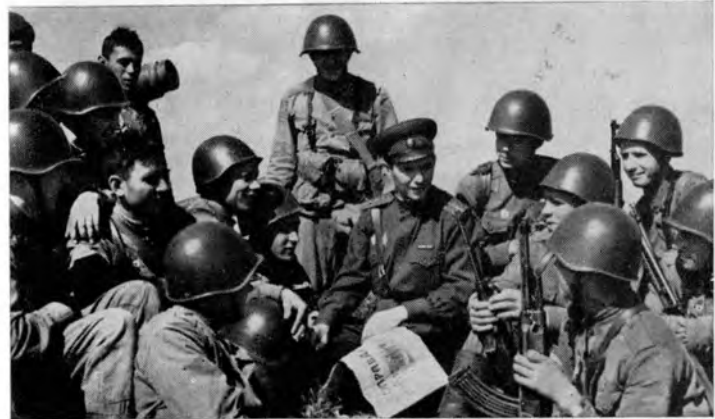
Political education classes. Servicemen study Marxist-Leninist theory.