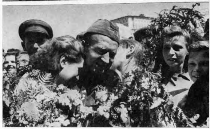
People cheer Soviet soldiers, their liberators from Nazi bondage.