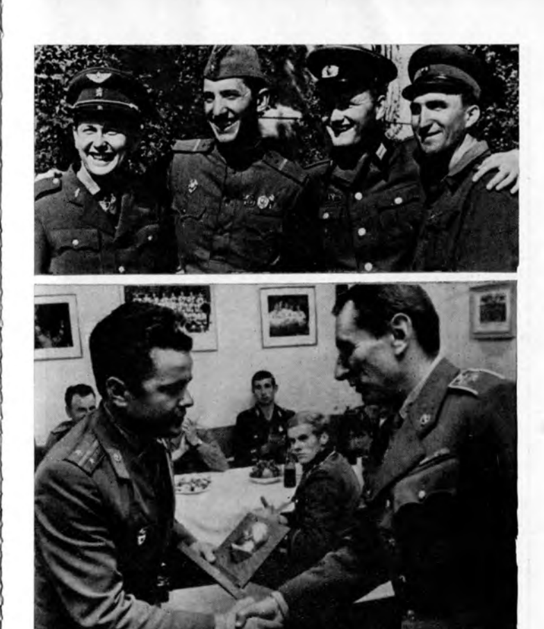
A friendly meeting of servicemen of the Warsaw Treaty member-states.