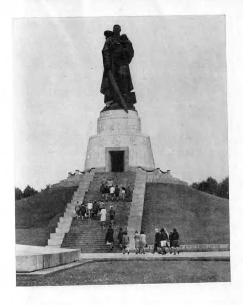
The monument to the Soviet soldier-liberator in Treptow park in Berlin, the capital of the GDR.