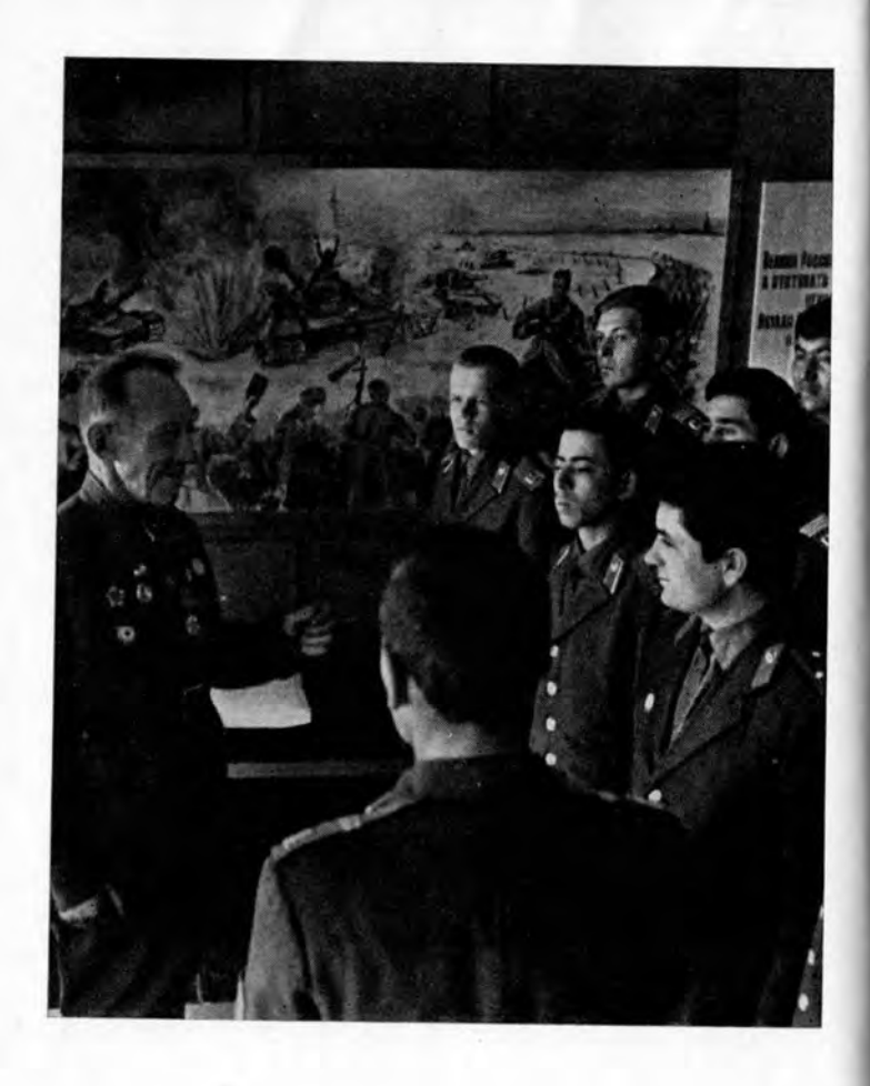
Listening to a war veteran,