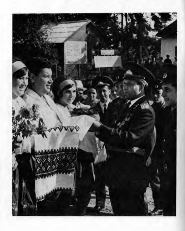
The people and the Army are one.

grad, which lasted from July to November, 1942, the Nazis lost a total of 700,000 men, more than 1,000 tanks, over 2,000 guns and mortars, and 1,400 planes.