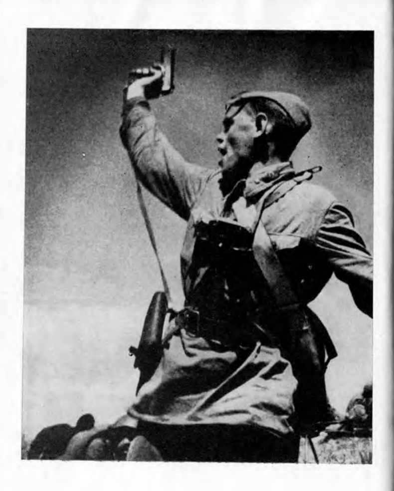
The Soviet troops courageously defended their Homeland against Nazi invaders.