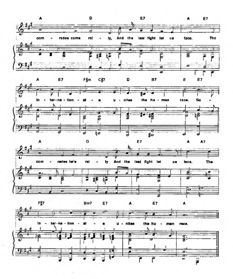
Words by Eugene Pottier (1871) Music by Pierre Degeyter (1888)