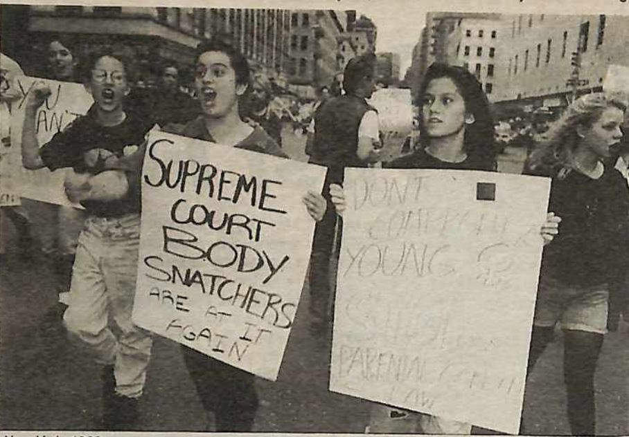
New York, 1989

women. And it made it impossible for many young women to get abortions—especially those who can't afford lawyers or use the legal system to defy their parents. States immediately started passing laws requiring parental consent for teenage abortions and restricting abortions for young women in other ways. Today 35 states have such laws.