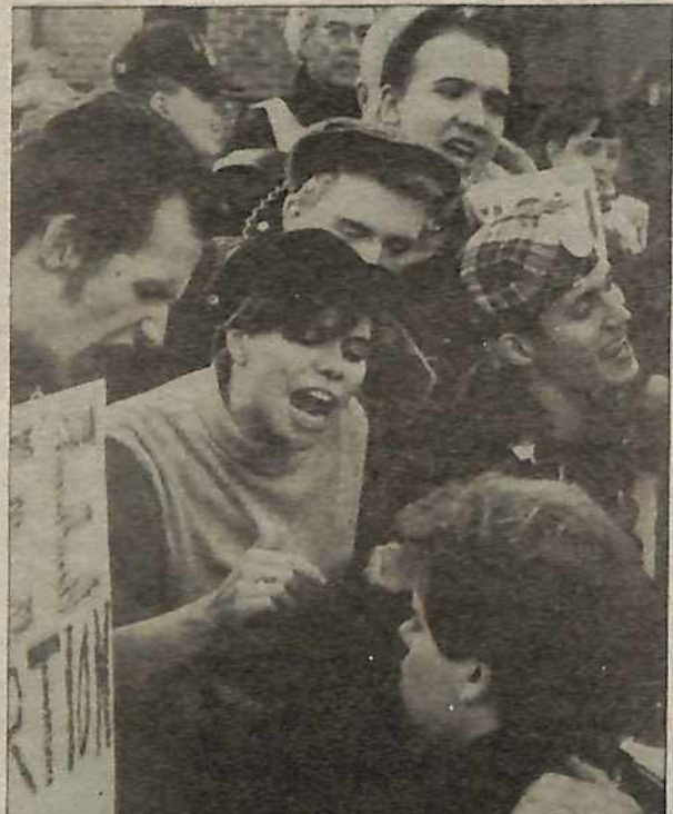
Left: Pro-choice demonstrators confront Operation Rescue outside Cincinnati clinic. Right: Chicago, September 1991.

The Supreme Court gave states permission to make special regulations on abortion for young women as long as the regulations also gave these women the option of a legal hearing to seek an abortion. This legalized parental consent laws, and made it harder for youth to get quick, secret abortions. It gave parents—and especially fathers—new powers to control the sexuality and reproduction of young