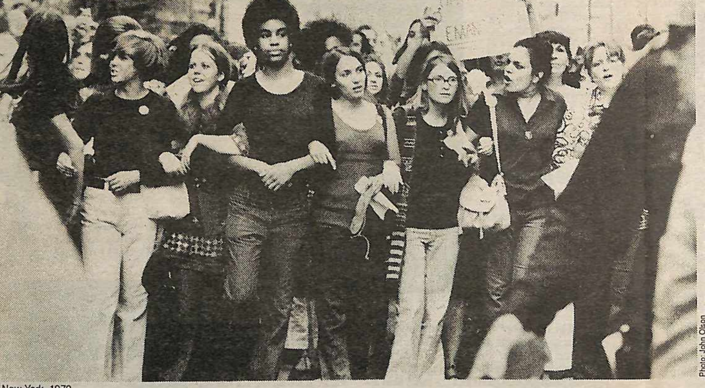
New York, 1970