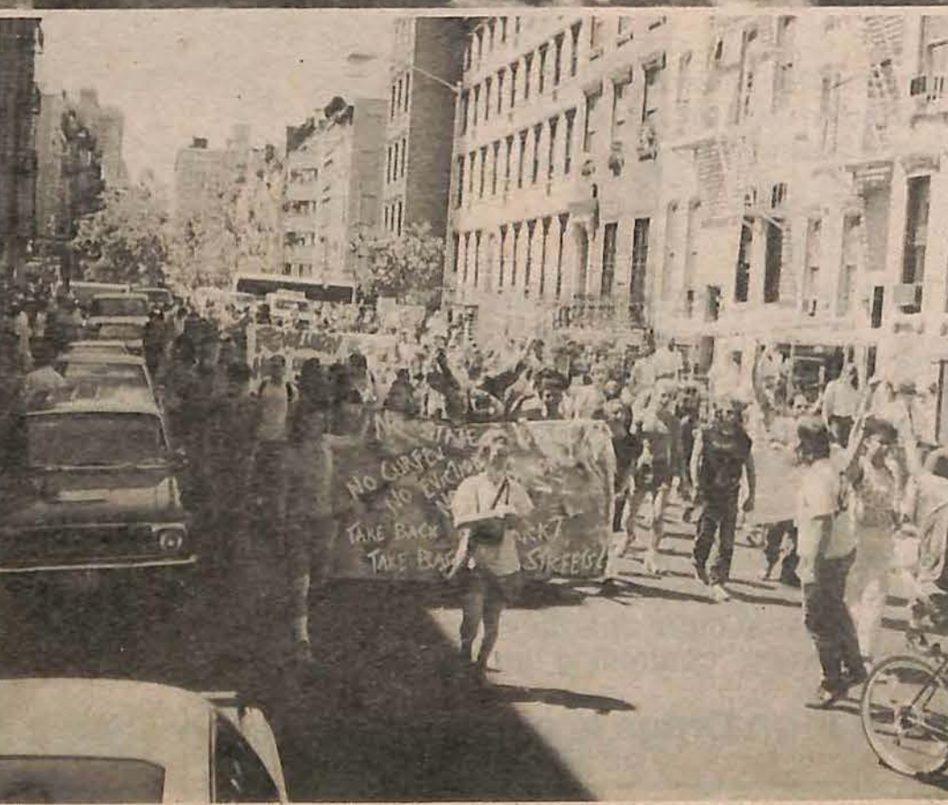
July 8, 1989 (Above) Homeless people and supporters rebuild and defend shanties in the park. (Left) Marching on the police station.