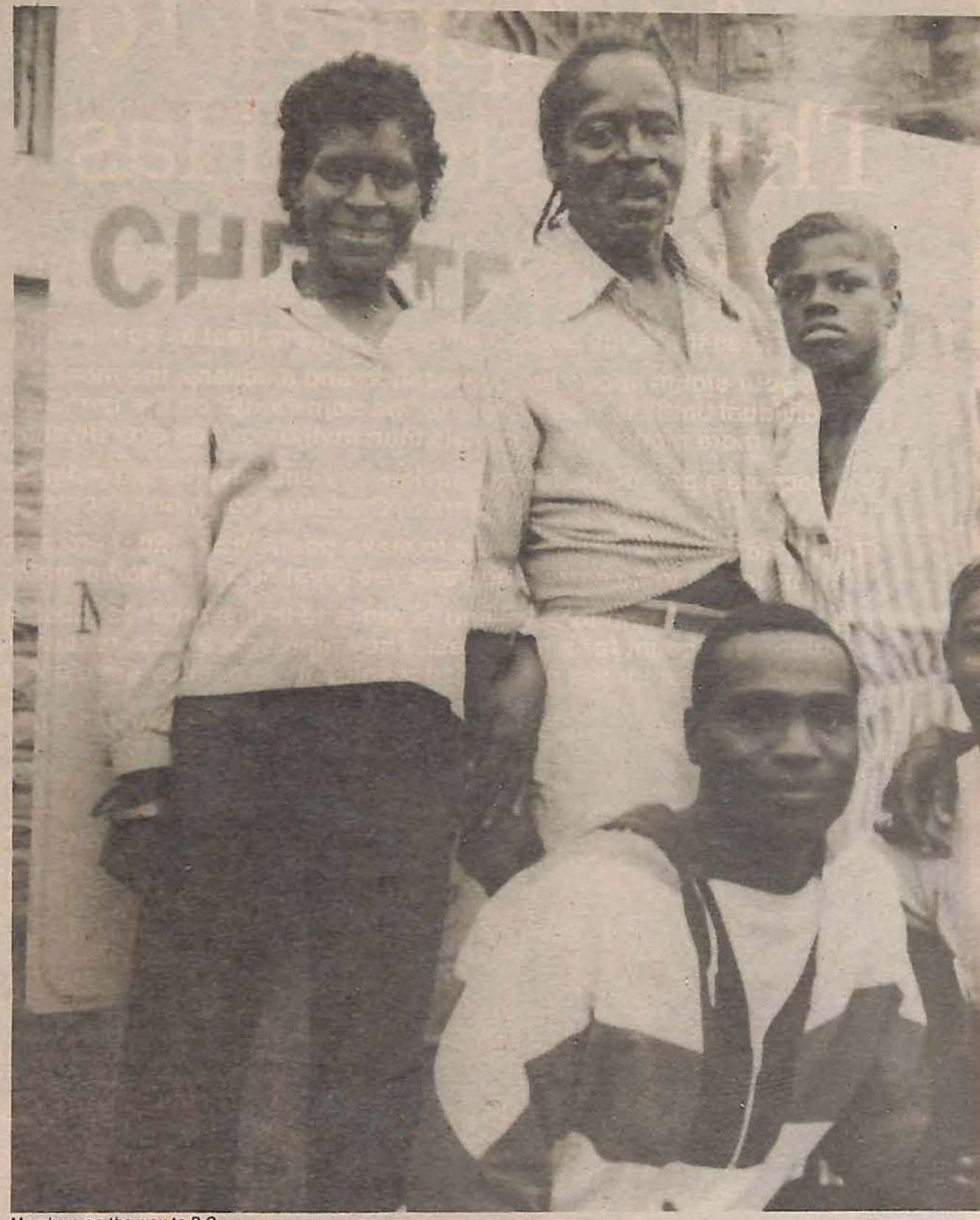
Marchers on the way to D.C.

Standing on a soup line is a job. There's a place in New York City on 28 Street and 9th Avenue where there are so many of us that you have to get up from wherever you are, off your cardboard box, off your park bench, out from under some shed or under somebody's garage or out of a doorway and make it to this place by 9 o'clock or 9:30 in order to be there to receive a ticket that they start issuing at 10:00 and start serving the food at 11:30, for lunch. That's a job. They go from place to place for a meal. And it's a job to travel all over town, and it's expensive to travel all over town just to get a meal.