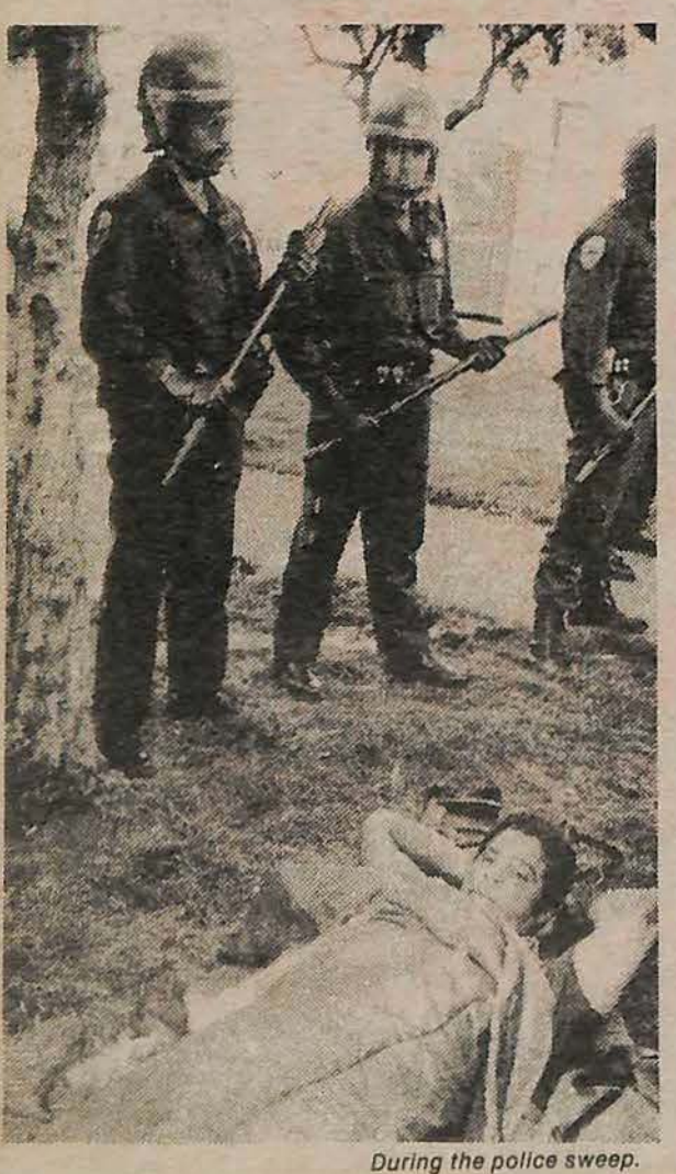
During the police sweep.

In the wake of this battle, the city ex-tended the original restraining order and FNB members have been arrested almost every time they distribute food. But while the authorities would like to crush FNB, a lot of middle class people and others have come forward through this battle to defend FNB and stand with the homeless. And many of the homeless have themselves gotten stronger and more determined through this latest round of struggle. One revolutionary white proletarian who is homeless told the RW, "I understand there's a million people homeless right now (in the U.S.). And that number is gonna keep growing every damn year. It's gonna turn into a civil war. It's gonna become a government of the people for the people cause the people are gonna take it right over."