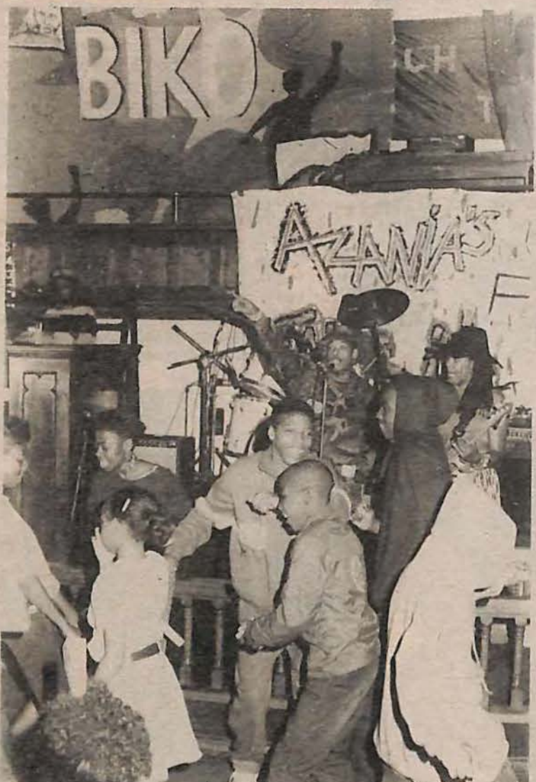
Dancing to Faith and Rebel Force