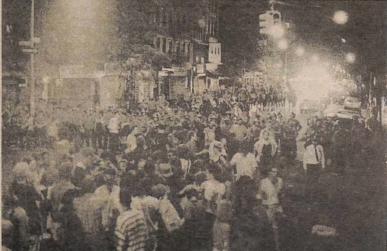
August 6, 1988

"When we were collectively threatened by the police riot, all of a sudden people who hated each other recognized each other as al-