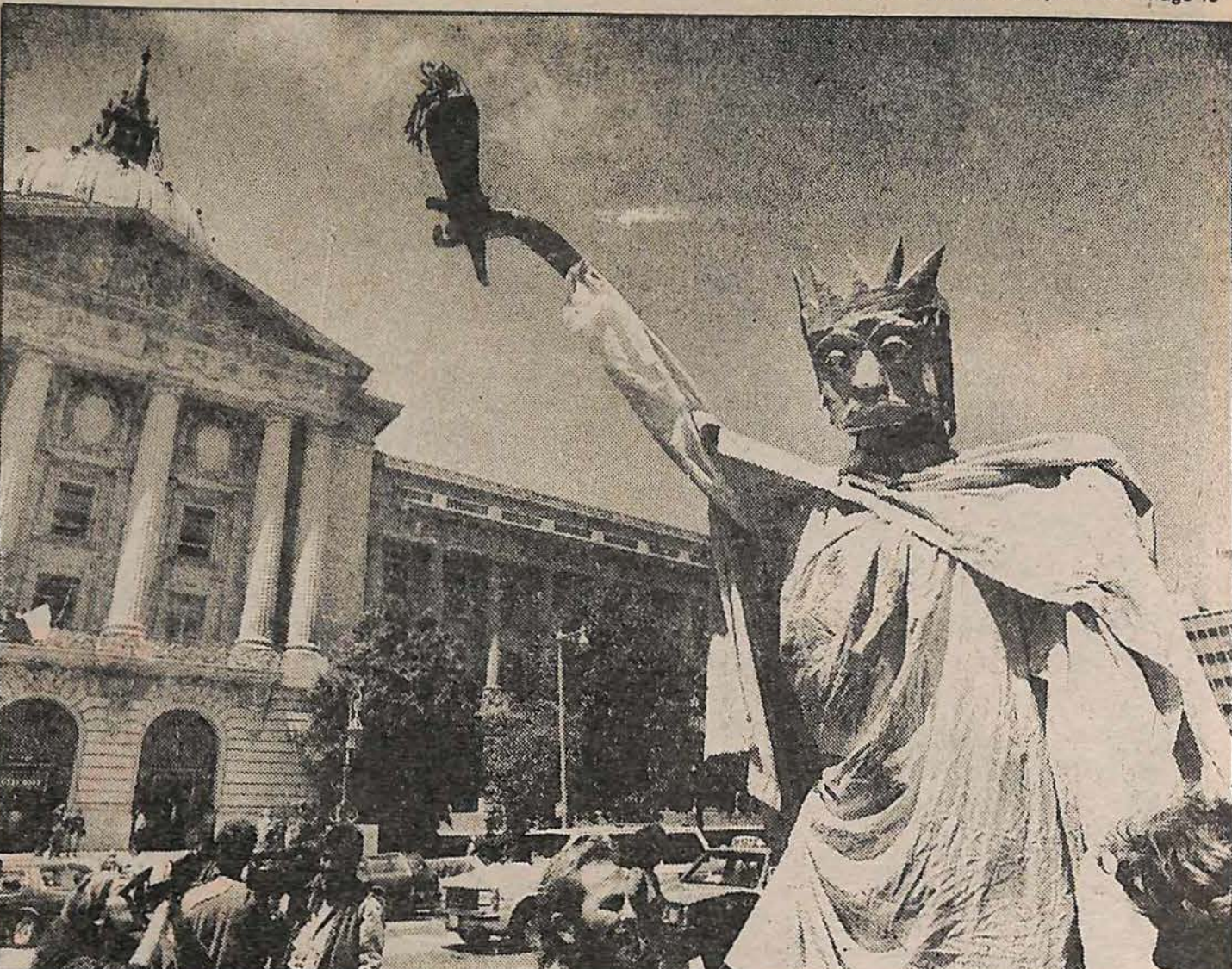
"The Goddess of Free Food"

San Francisco's Civic Center Plaza is a tree-lined park right in front of City Hall. It's next to the Civic Auditorium and the old main library, and strolling distance from the opera, symphony and the Museum of Modern Art. This summer it became the site of an intense battle between city authorities and hundreds of