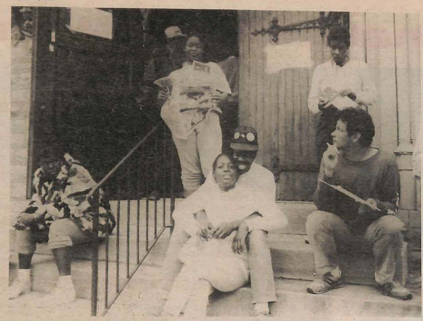
Marchers on the way to D.C.