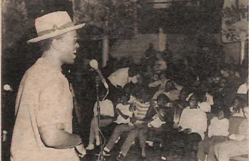
Fab 5 Freddy

Saturday, Sept. 23, the Biko Lives! Festival. The Willis Ave. Methodist Church fills up with an unusual mix of people. It is not a gathering the rulers of this system want to see, especially not here in the heart of New York's South Bronx. Black, Latino, white people. . . much youth . . rappers, rockers and reggae toasters. . . folk singers from Puerto Rico, the southeast African country of Malawi, and New York's East Village. . . revolutionaries from different countries. Women fresh from a protest against Operation Rescue pass out "Our Bodies/Our Choice" stickers to Black youth. Homeless people from Tompkins Square Park hang a banner from the balcony of the church: "Free the Homeless, Free South Africa!"