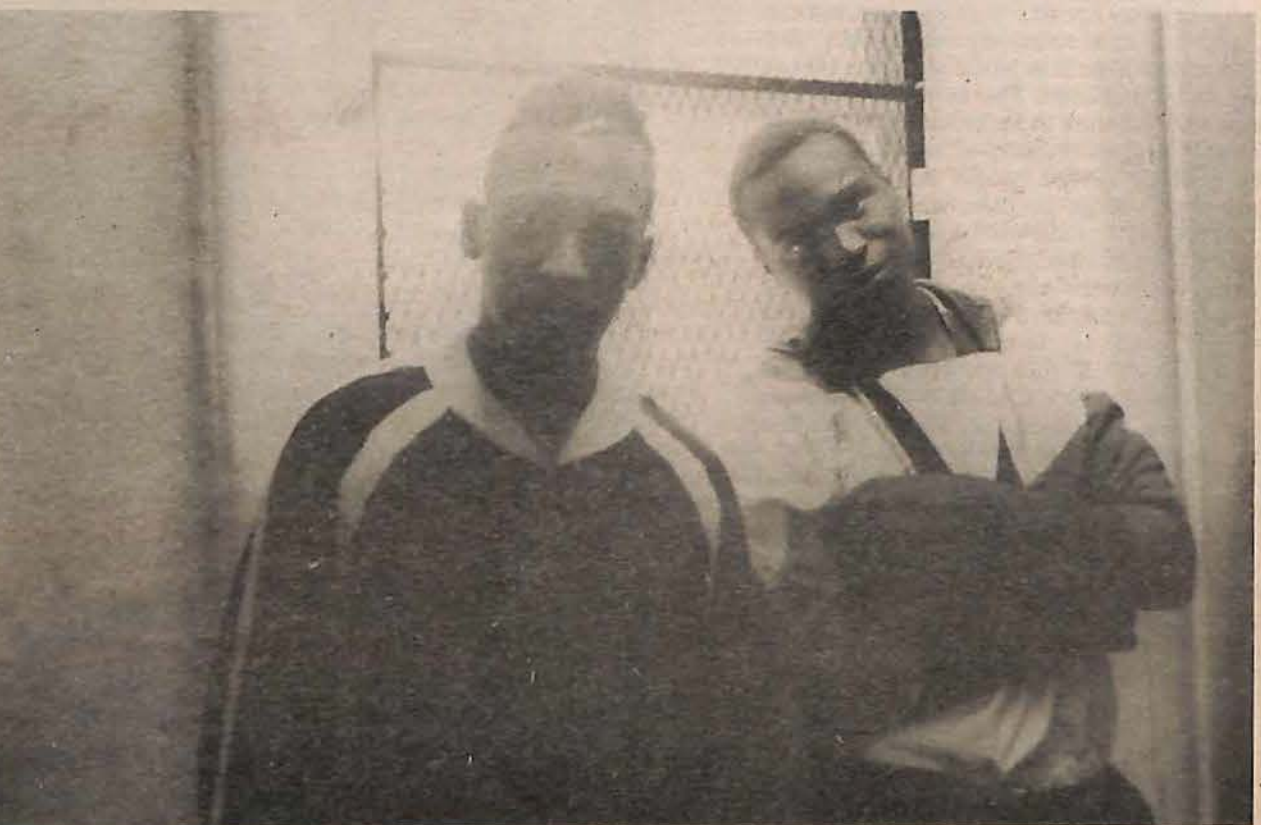
Marchers on the way to D.C.

I read that (referring to the RW). I think it's a very for real, down-to-earth, informative paper. It speaks about the real facts. I've been reading about the coal miners, and also about developments in Tompkins Square Park and the views of the Revolutionary Worker,