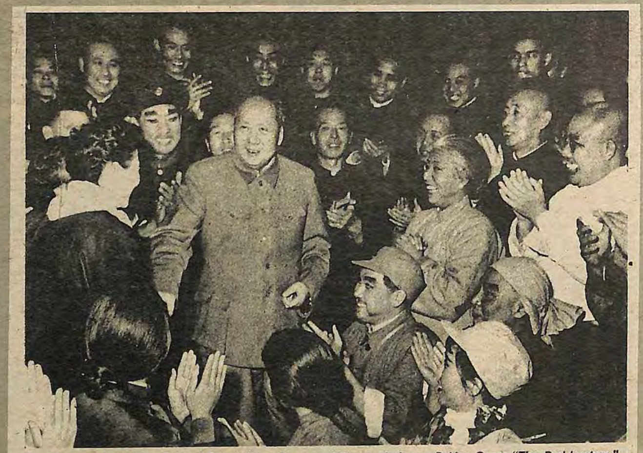
Mao Tsetung during the Cultural Revolution with cast of the revolutionary Peking Opera "The Red Lantern."