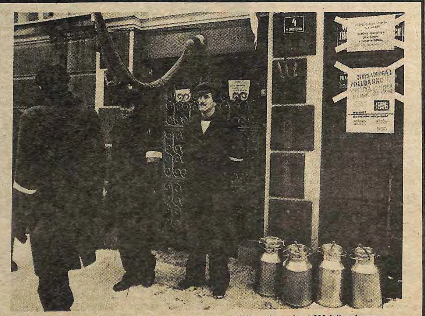
Farmers in Rzeszow, Poland, guard an entrance to the building where about 600 fellow farmers are staging a sit-in.

On January 1, amid reports that power stations had only a few days coal left and that food shortages were becoming more serious as well as continuing government threats and warnings that penalties for sit-ins and factory disruption could range from 2 to 10 years in prison, Walesa emerged from negotiations with the government, and agreements in hand, declared "Its the greatest success we've ever achieved. We've never got so far." This, however, was highly debatable. Although the government said it would Continued on page 9