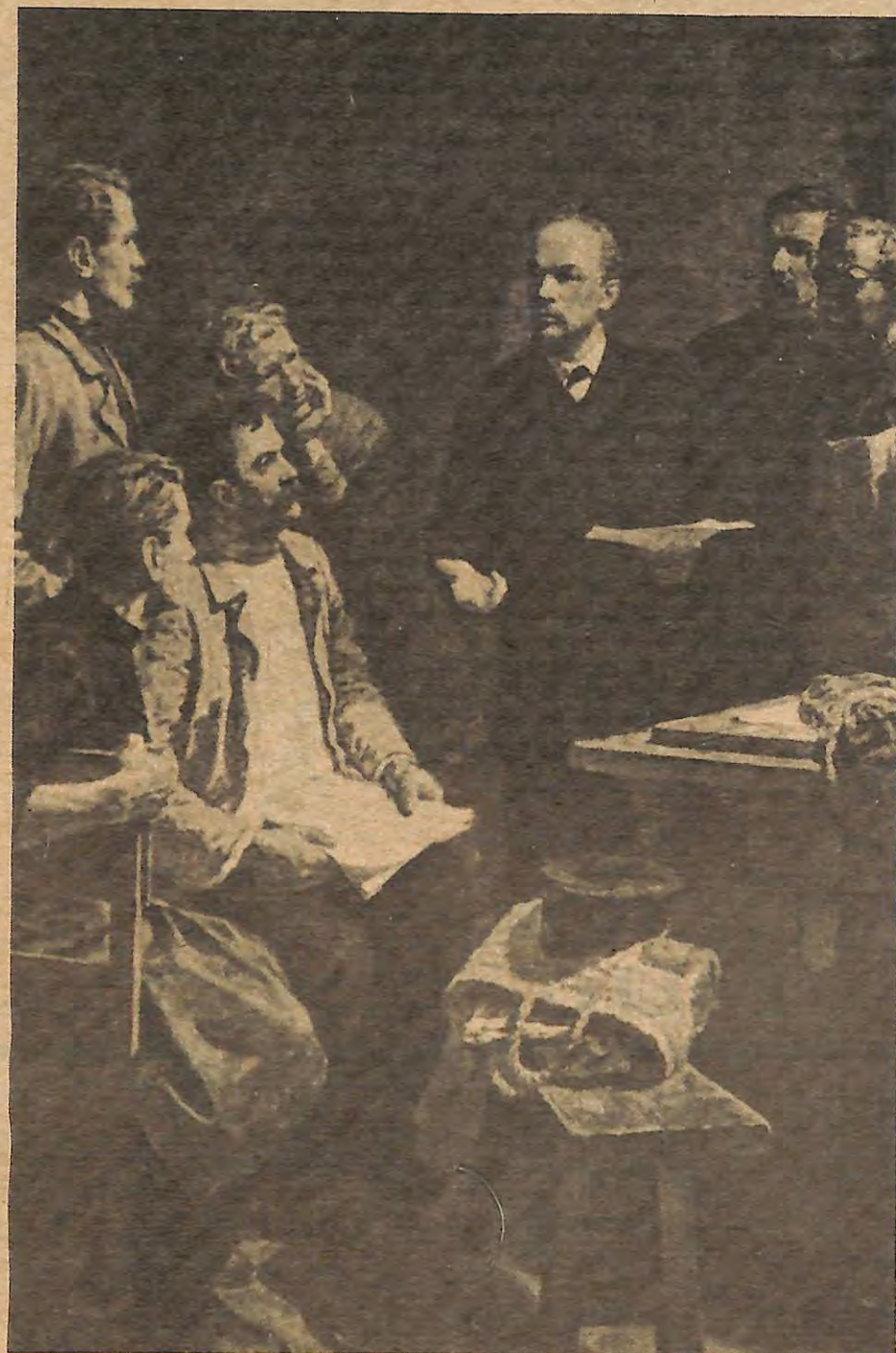
Lenin and revolutionary St. Petersburg workers prepare the first secret leaflet for distribution.

Rabocheye Dyelo , of course mentions Liebknecht's name in vain. The tactics of agitation in relation to some special question, or the tactics with regard to some detail of party organisation may be changed in twenty-four