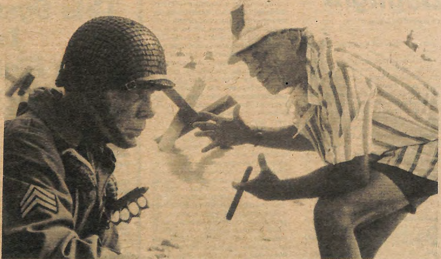
Sam Fuller directs Lee Marvin in the "Big Red 1"—would you buy a used war from this man?