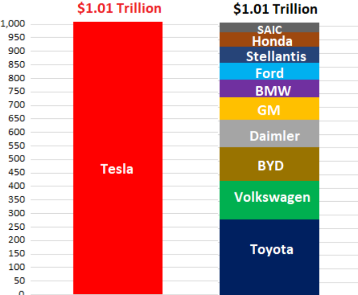
Tesla's sales numbers relative to other automakers contrast strongly with the company's market capitalization, showing clearly how Tesla's share price is driven by speculation.

To fight off potential runaway inflation, which is currently being driven primarily by currency debasement, deficit spending (and the related stimulus checks), and the supply chain bottleneck, not by an increase in consumption, the Federal Reserve is planning to taper asset purchases and raise interest rates in the next year or so, but has been cautious about doing so because of concerns about triggering a market crash. It is a very unstable situation when, in order to prevent a crash, the central bank has to purchase $120 billion of securities from the banks each month (as part of its Quantitative Easing program) and lend to them at negative real interest rates.