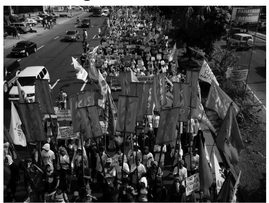
Peasant marchers from all over the country converged in Manila on 22 January to press their demand for genuine agrarian reform. They were joined by thousands of workers, the urban poor, and other progressive sectors.

Japan, The Netherlands, New Zealand, Saudi Arabia, South Korea, Taiwan, United Arab Emirates, United Kingdom and the United States. In a unity statement issued by Migrante International the migrants stated: "The Filipino migrant community believes that the government's labor export program is not the solution to the economic crisis, and the landlessness experienced by farmers in the communities we came from and in which our families back home are still struggling to survive.