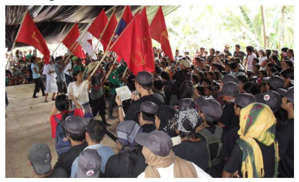
Banners of the NDFP member organizations are held aloft during the 41st anniversary celebrations of the CPP in Mindanao, 26 December 2009.