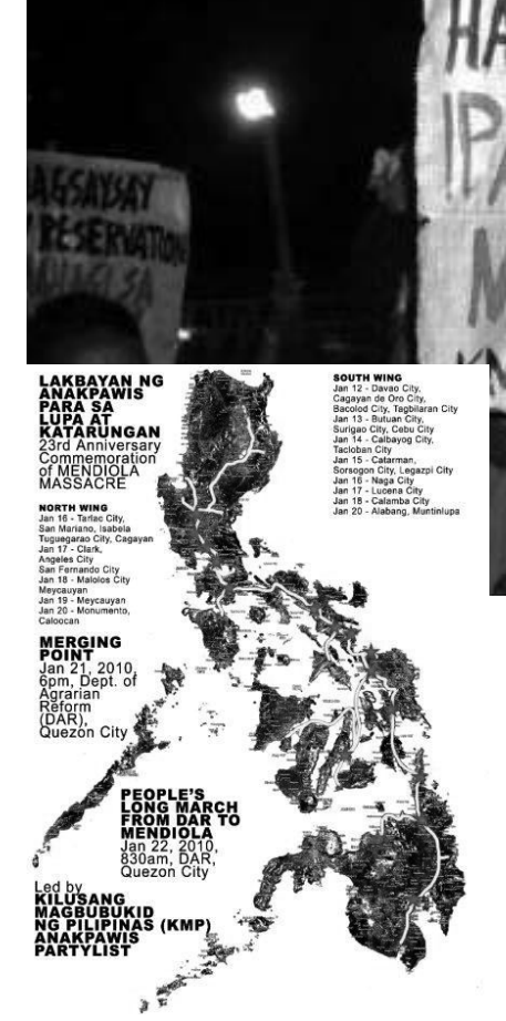
(Top photo) "Distribute Hacienda Luisita to the farmers!" Participants to the march demand implementation of genuine agrarian reform. Above, a poster indicating the routes and meeting points of the nationwide march.

Representatives of the people's government take advantage of the opportunity to discuss with candidates campaigning inside the revolutionary areas regarding some problems of the people and what can be done to pro-