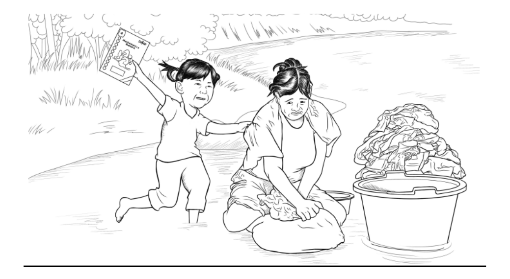
"Red...," from page 3

integrate with different people, until one time when she integrated in a peasant community where she first interacted with Red fighters. Later on, she decided to become a full-time member of the people's Army.