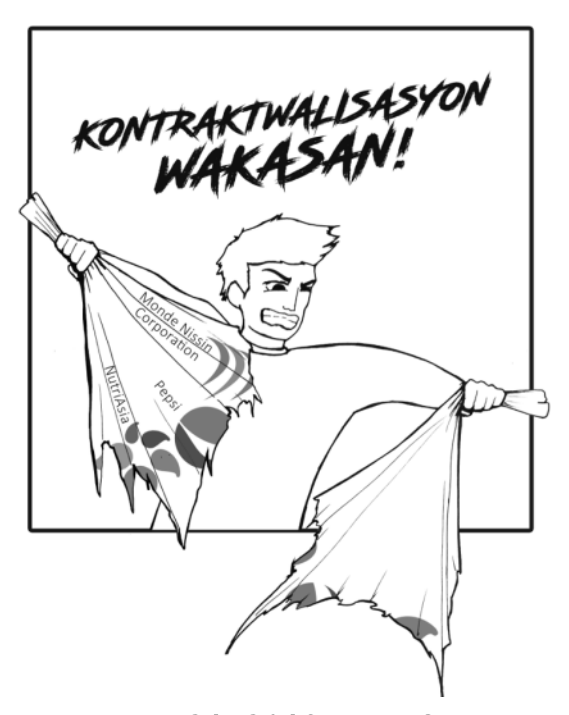
June 21, 2018 ANG BAYAN

beaten with truncheons and handcuffed by police officers. One of them was dragged to a sidewalk, beaten and held at knifepoint