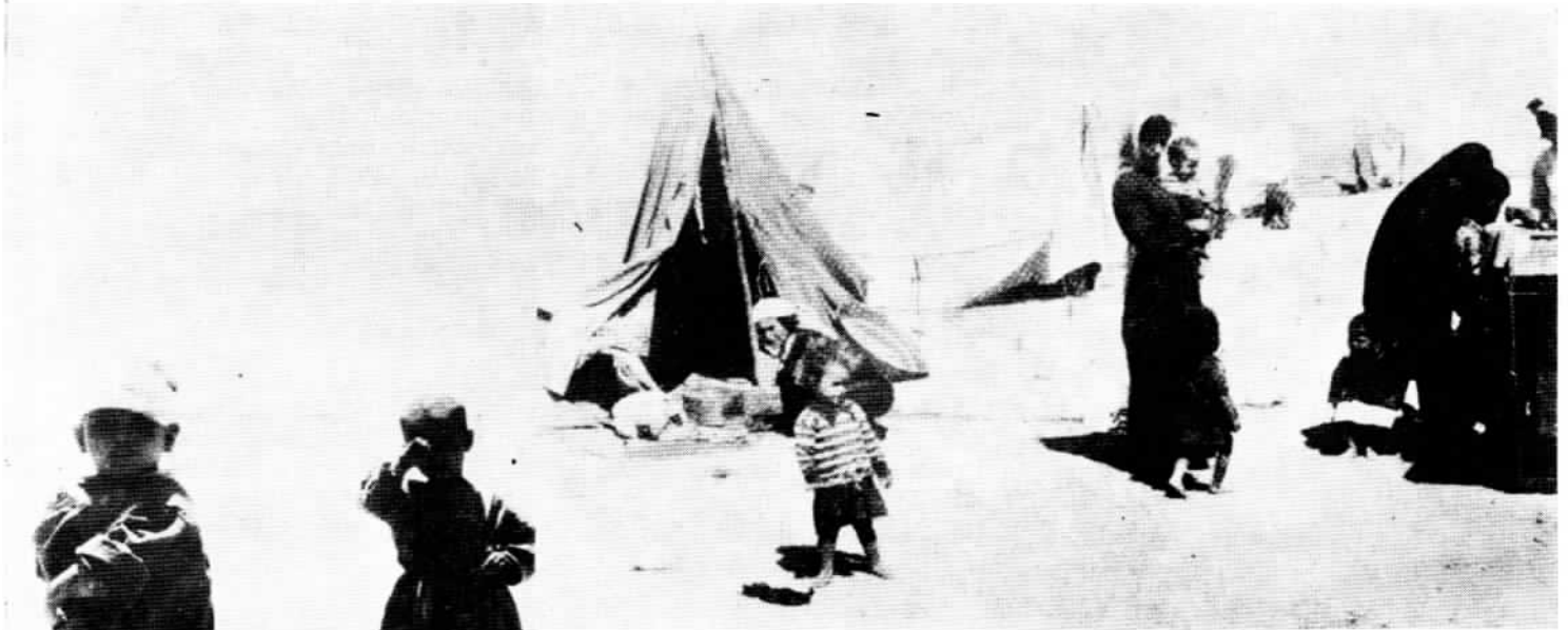
The Egyptians did not starve them.