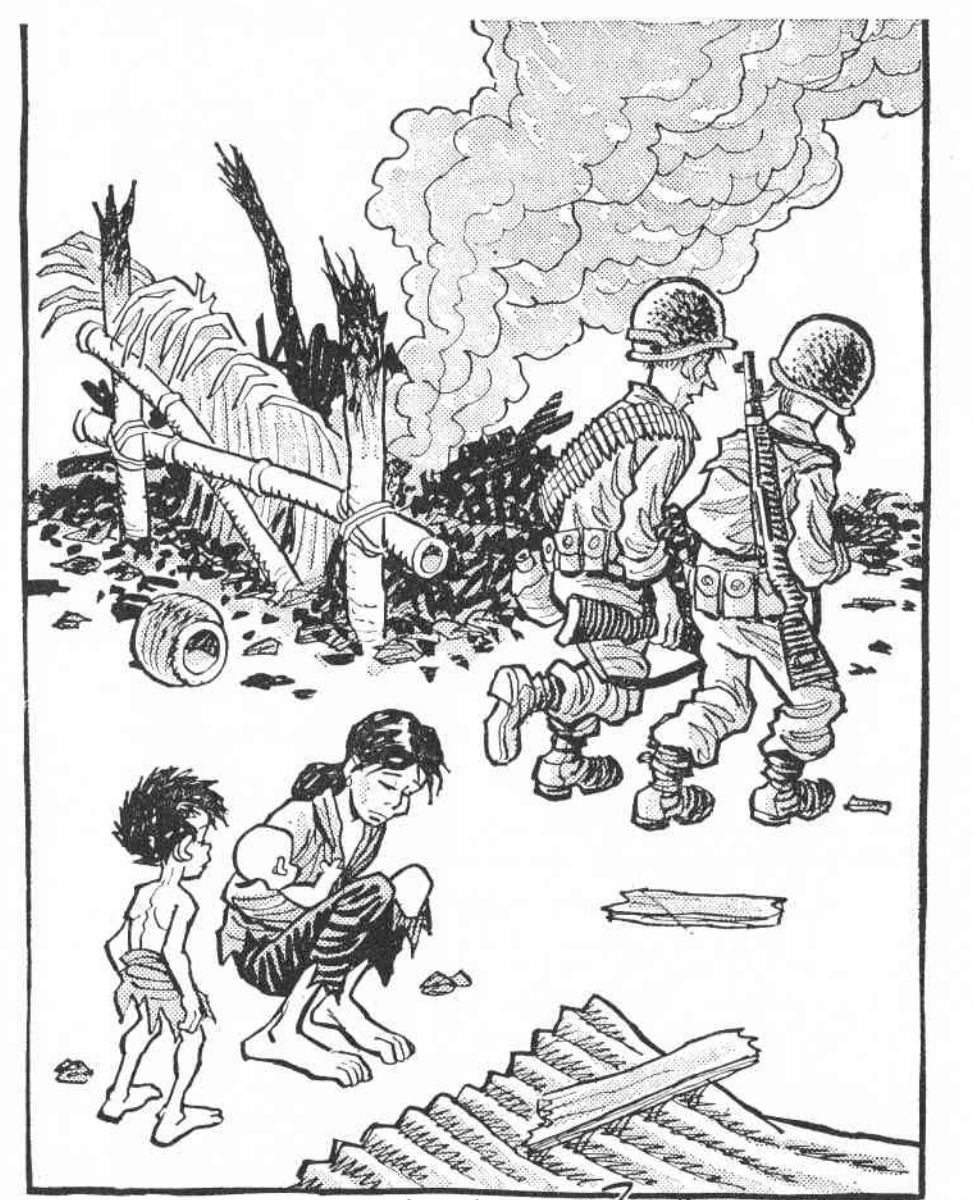
Great Falls Tribune GREENSBORD DAILY NEWS LSCHIESCHE Montana 7/26/68

'How Do You Tell 'Em We're On Their Side?'