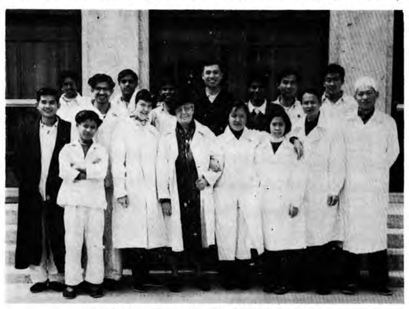
At the Asian-African Students Sanitorium—Peking