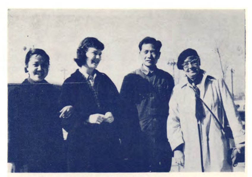
With my interpreter-companion, friend, and chauffer-Peking.