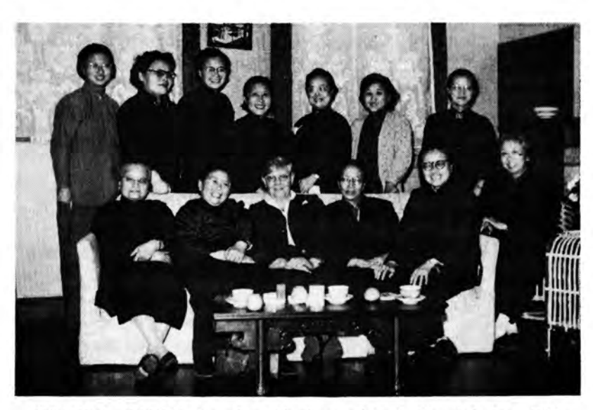
With National YWCA Committee Members and Staff-Shanghai, June, 1959