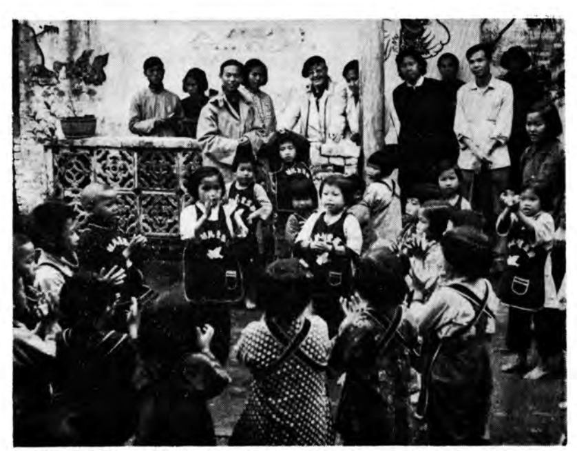
Children in the Pan Yu People's Communes greet us-Kwangtung Province