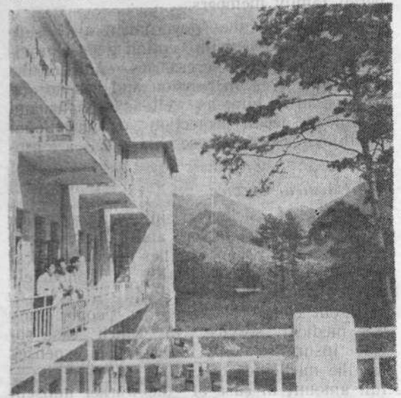
Myohyang-san Rest Home

Mines, coal mines, iron and steel works and other factories, where work is heavy, maintain their own sanatoria. Workers, who re-