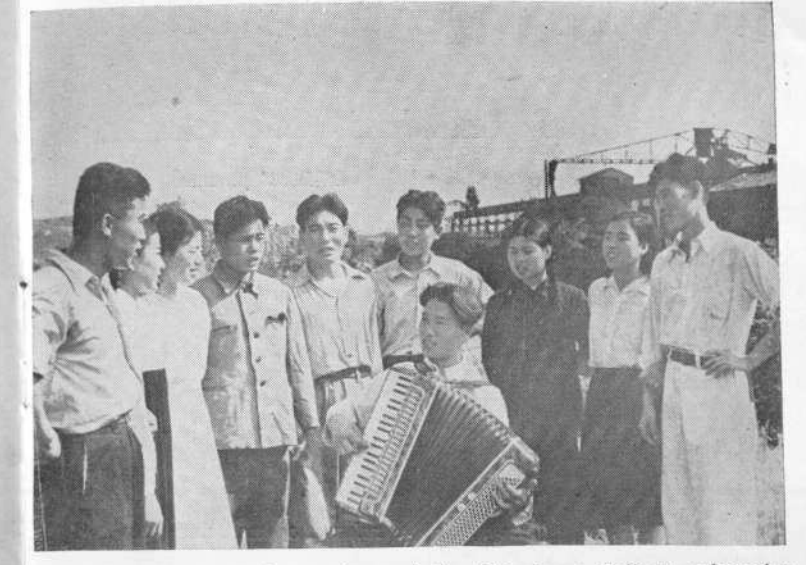
Music circle members of the Shinchang Colliery rehearsing a new piece for the art contest in celebration of Miners' Day

With the mechanization of labour-consuming process and with thorough safety measures, miners are now working free from danger.