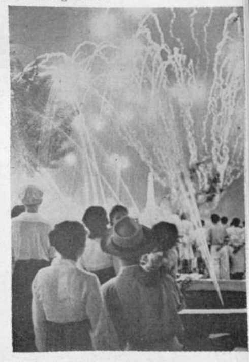
Gun salute in Moranbong Park, Pyongyang