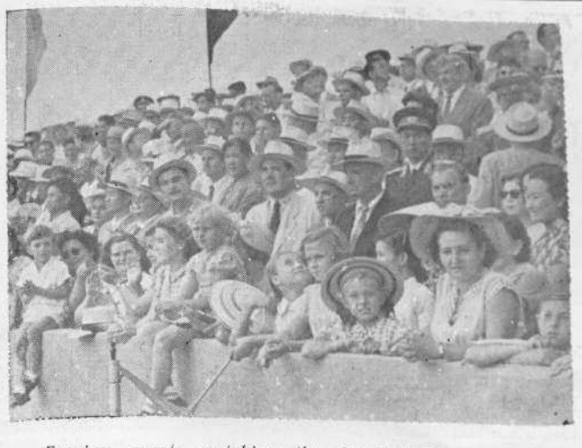
Foreign guests watching the demonstration