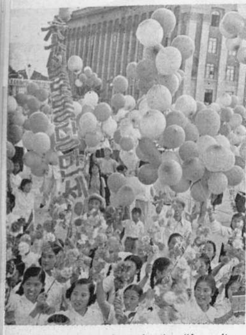
Women marchers shouting "Long live the Workers' Party of Korea!"