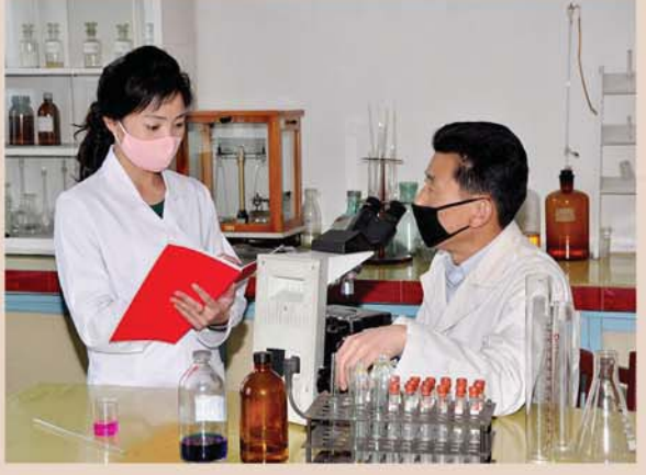
Researchers measure the state of microorganisms in fermented liquid of makkolli.

KOREANS HAVE LONG MADE DIFFERENT kinds of drinks and used them in their everyday life. One of the typical drinks is makkolli.