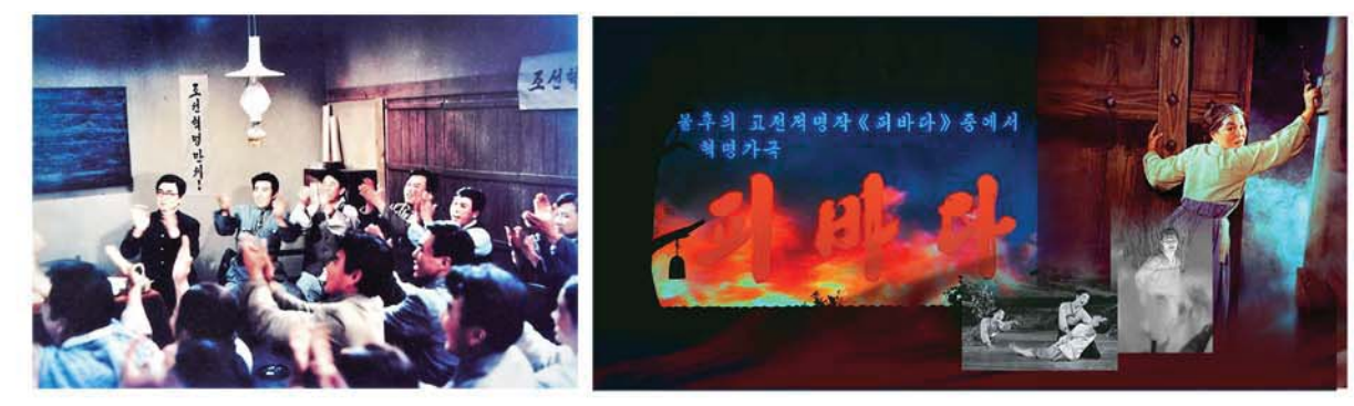
Scenes from the Korean feature film Star of Korea and the revolutionary opera The Sea of Blood produced during the revolution in the art and literature.

Barrage by the country. It was a gigantic project: They had to erect a dam across the 8-km-Uuring the time of Ardu-