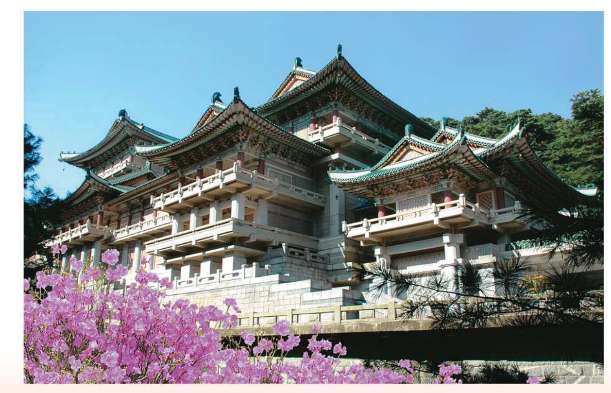
The International Friendship Exhibition House.