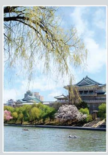
Back Cover: A view of the Pothong River