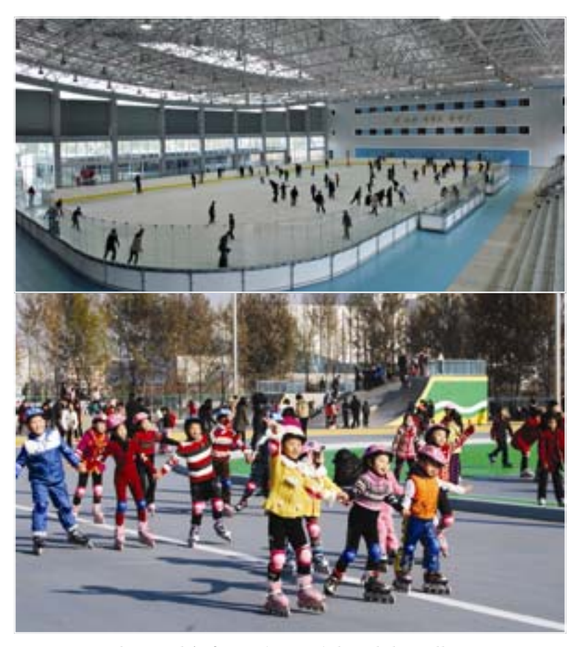
The People's Open-air Ice Rink and the Roller Rink built for the people's entertainment.

On the lunar New Year's Day of last year he visited the Mangyongdae Revolutionary School. There he sat on a bed in a bedroom of schoolchildren and told officials there to keep bedrooms in good temperature so as to make the schoolchildren pass the winter in warm rooms. And in the mess hall he kindly asked children having meat soup with rice in it if the dish was to their liking and what they wanted to eat. While looking over them having their meals as if there was lack of something, he said to officials that he would send myonggi beef to the school the next day so that the schoolchildren could eat boiled beef and that they should come to the school to personally see them eating boiled beef. In the birthday room, he said that it was laudable to prepare birthday feasts for the schoolchildren and earnestly requested the officials to take parental care of the children, as they would think of their parents before anybody else on their birthdays, so as to help them have no regret. Whenever he visited units of the Korean People's Army he felt mattresses, saving that the officers should take good care of the soldiers in life; at factories and enterprises he unreservedly held hands of the workers and acquainted himself