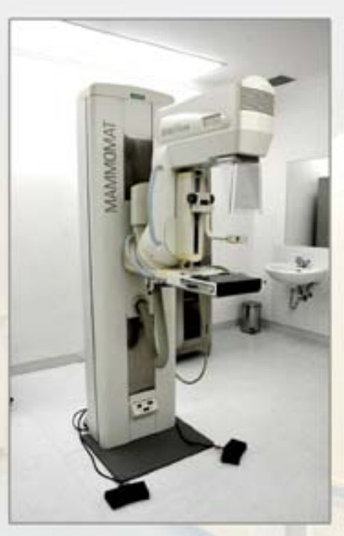
The mammary gland photographing room.