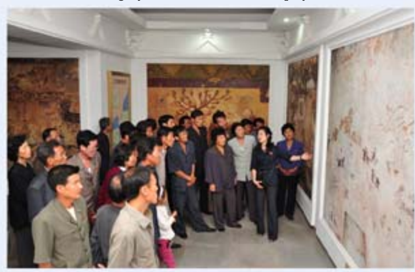
A tomb of a general.

Hwangryong Temple from the period of Silla and the one in Kumgang Temple from the period of Koguryo, all testifying to the features of those days and the then level of development of architecture. The pagoda at Kumgang Temple in particular is a typical pagoda from the period of Koguryo. It is 66 metres high and octagonal in shape. It is a life-size replica of the original built on the basis of scientific calculation of what were unearthed in the middle of the temple's compound in Taesong District, Pyongyang. We climbed the pagoda. The decoration of tanchong (red and blue) based on dark brown, the creaks caused by our stepping on the wooden floors and the wooden