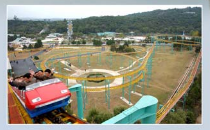
Updated Taesongsan Pleasure Ground.

the Songun era. The Rungna People's Pleasure Ground was built on the picturesque Rungna Islet in Pyongyang last year, and Mangyongdae Funfair and Tae-