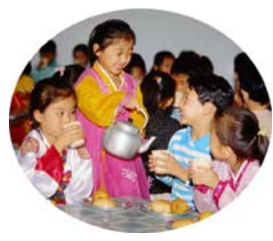
At a soya milk time.

▶ Songun revolutionary leadership, he took the trouble to visit schools to see pupils at class or operating computers and playing musical instruments and taught in detail how to develop all of them into strong pillars for the building of a thriving nation. Sometimes he provided schools with computers, educational apparatuses and materials, stuffed or immersed specimens, various musical instruments, colour TVs and video recorders.