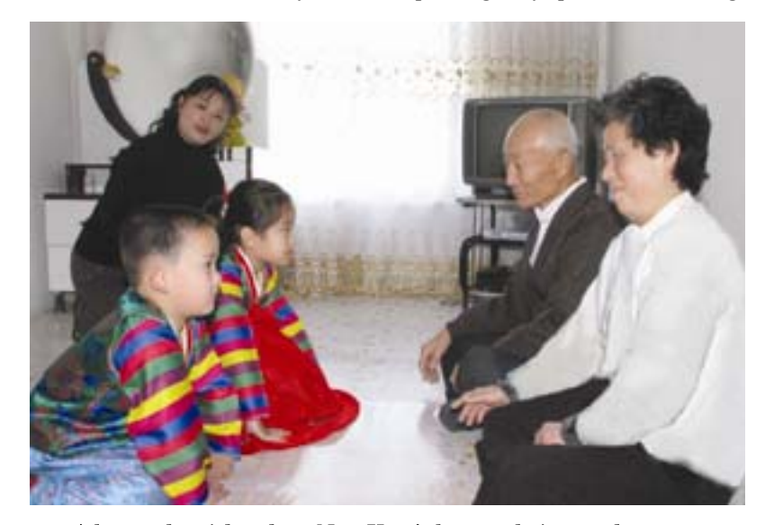
A boy and a girl make a New Year's bow to their grandparents.

Folk games made the atmosphere more pleasant. The games included yut played by people regardless of age and sex, women's seesawing, and children's kite flying, sledging, top spinning, toy pinwheel turning,