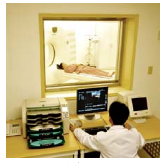
The CT room.

The institute has been built for the purpose of preventing and treating mastopathy and breast cancer of women in addition to conducting medical researches on their breast diseases. To this end, the institute is enforcing a system of giving women regular checkups, and preventing, diagnosing early and curing mastopathy and breast cancer. At the same time, it renders telemedicine all across the country.