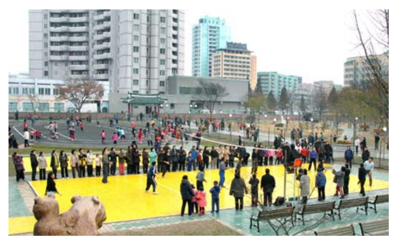
In a park in Pyongyang.

have courses and courts for roller-skating, volleyball, basketball, badminton and mini-golf where people can play sports games on Sundays and holidays; they are also equipped with various apparatuses of exercises and places for yut games, Korean chess and other folk games.