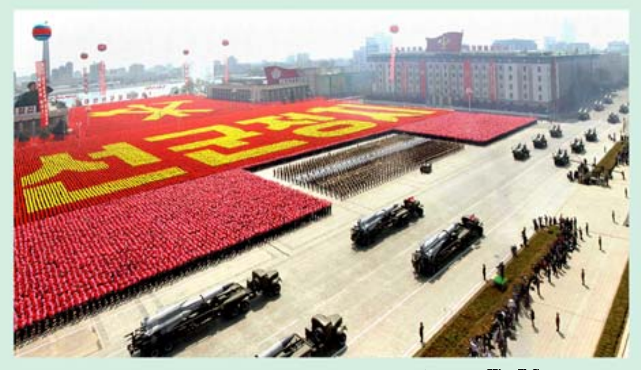
The military parade held to mark the 100th birth anniversary of President Kim II Sung.

▶ socialism in the former Soviet Union and the East European countries gave rise to a great change in the world political structure and balance of forces. By taking advantage of the collapse of the global socialist system, the reactionary imperialist forces intensified their offensive against the anti-imperialist independent forces, wielding the strong arms arbitrarily in the international arena.