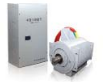
Permanent Magnet Synchronous Motor