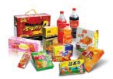
Kumkhop General Foodstuff Factory for Sportspeople