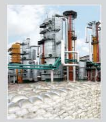
Namhung Youth Chemical Complex