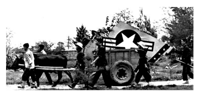
12: A US jet plane goes to the airplane cemetery, Hanoi, 1966

Hungary) plus representatives of the Pentagon and the VPA, at which were agreed the modalities of the handing-over procedure. A representative of the U.S. Air Force then took his place at a table under a tent awning, with a list of POW's to be released, flanked at other tables by the ICCS officers. When all were in place, a camouflaged bus drew up and out stepped the pilots. Neatly dressed, sleek – obviously fit – one by one they marched to the desk, saluted, gave their names and units, and were escorted off to silvery Stratoliners waiting to fly them off to Guam.