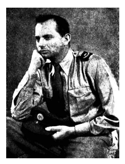
1: Wilfred Burchett as war correspondent in 1943

[Chapter 9 of Wingate Adventure (F.W. Cheshire, Melbourne, 1944), pp. 46–57.]