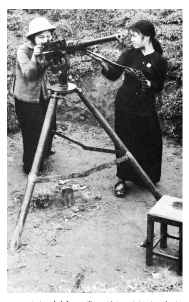
10: Anti-aircraft defence: village girls in training (North Vietnam, 1966)