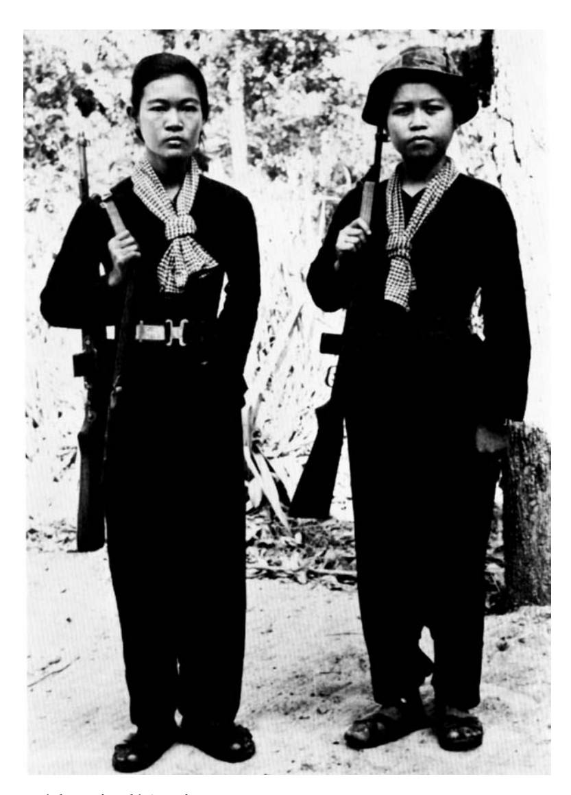
8: 'Blossom' and 'Lissom', 1964

last but one phase before graduation. The last was an actual combat engagement, usually against lightly-armed local guerillas. To their surprise, this batch had run into regular troops who also had heavy machine guns. Doubtless those particular graduates were put