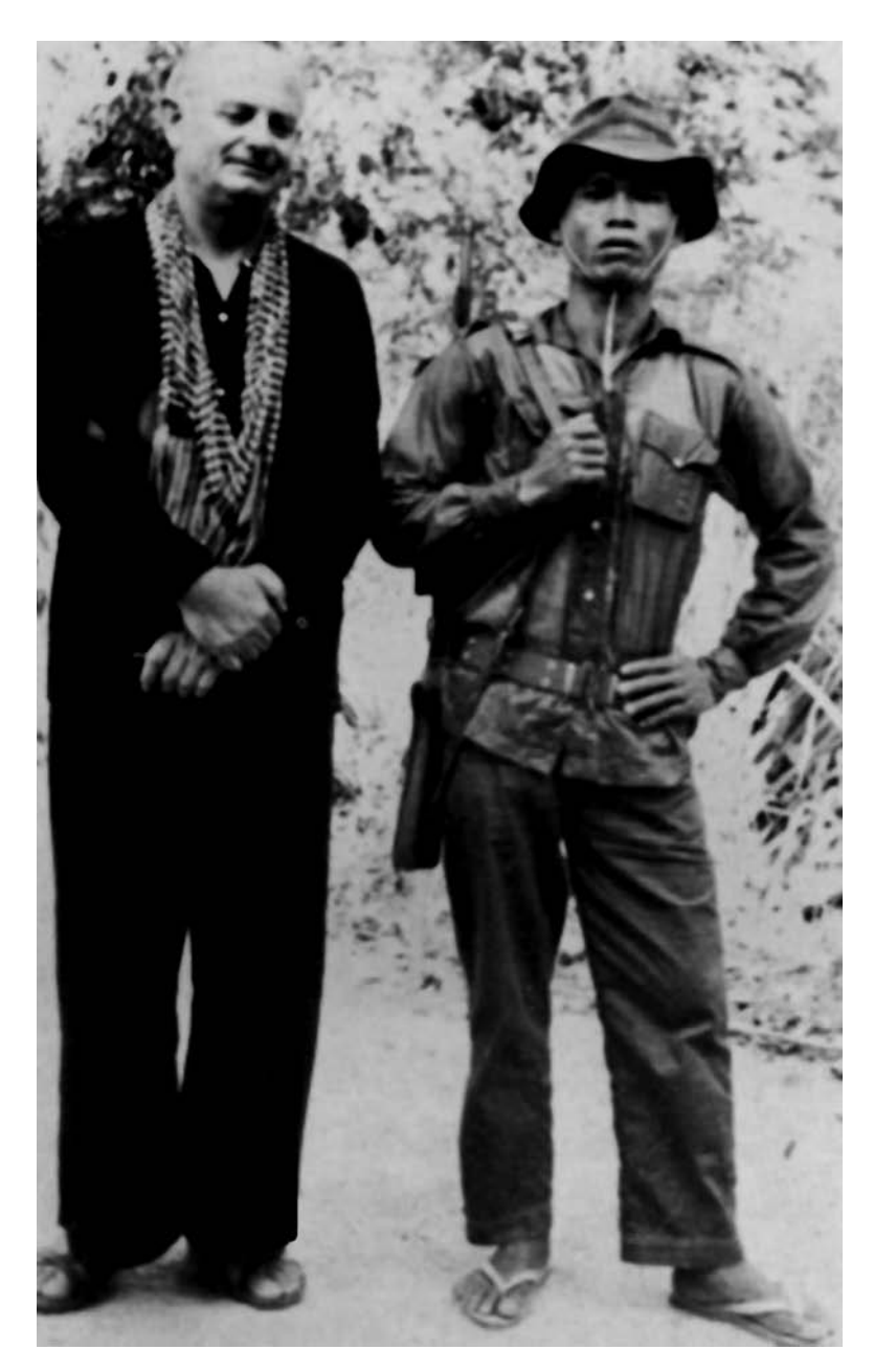
9: Wilfred Burchett with a member of a Vietnamese village self-defense corps, 1964