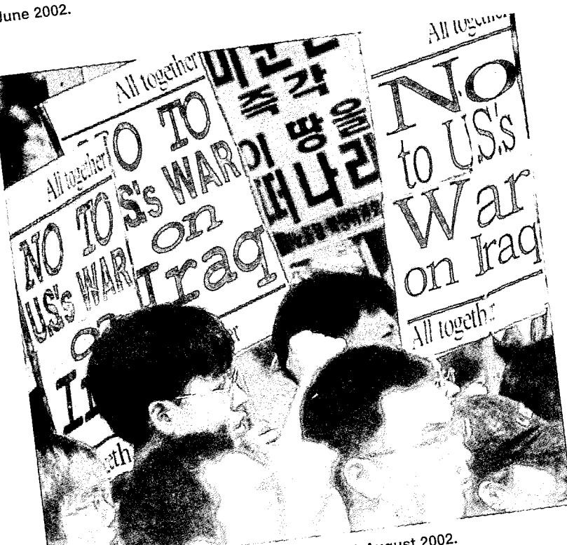
Near the US embassy in Seoul, S. Korea, 13 August 2002.

The emerging new wave of revolution is stretching throughout the world and the struggles of the people are increasingly intertwined. New mass organisations are sprouting, some of which, such as the World People's Resistance Movement active now in Europe and South Asia, are consciously linking the fight against imperialism and support the just liberation struggles of the peoples of the world, from Palestine and Iraq to Peru and Nepal.