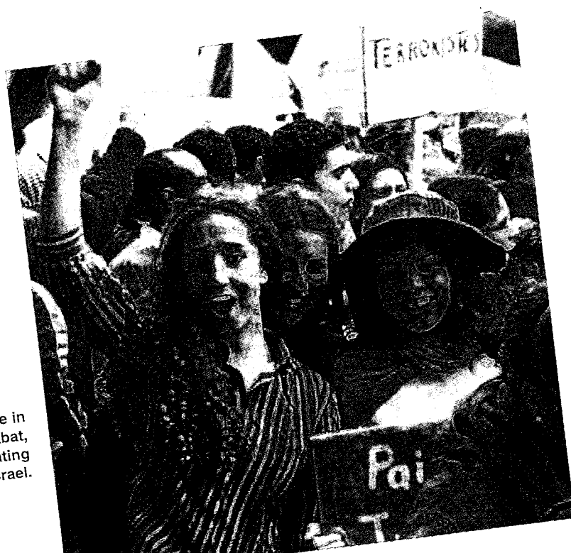
Over a million people in the streets of Rabat, Morocco demonstrating against Israel.