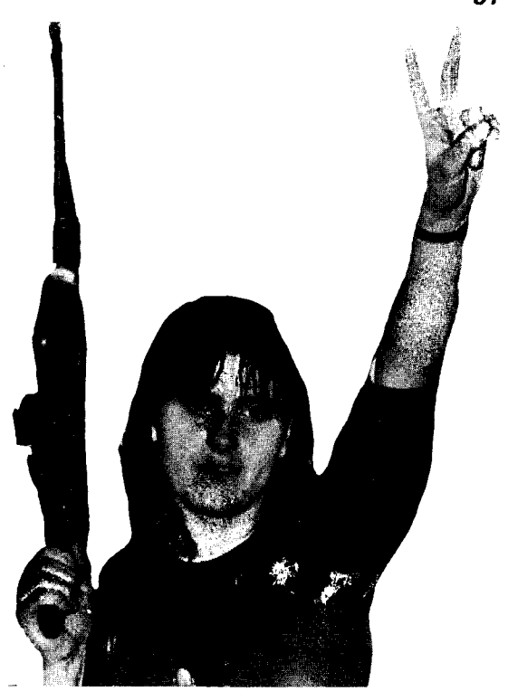
Top: Women with rifle celebrating the fall of Ceausescu.

Bottom: University building on left, site of initial armed struggle against Securitate.