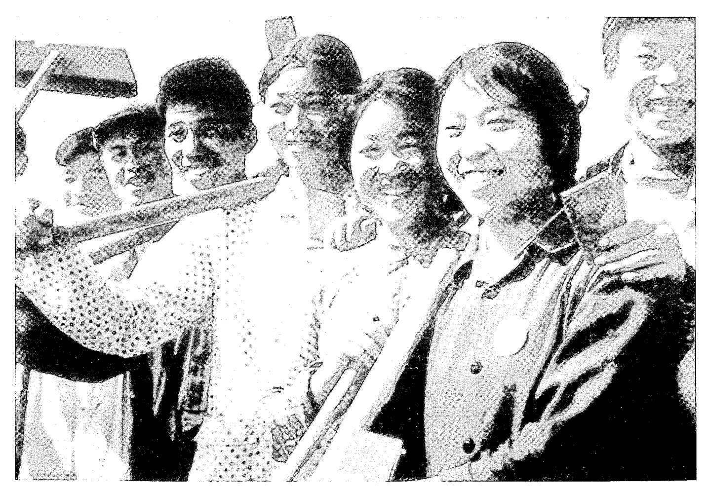
Peasants during the Cultural Revolution, holding Quotations of Chairman Mao Tsetung. Collectivisation of agriculture helped lay the basis for the liberation of women.

siders that a cardinal problem of the CCP was its treatment of the family as an ideological phenomenon, Wolf considers that the CCP didn't pay enough ideological attention to the family: "Social planners in China, alas, have ignored the fact that patriarchal thinking, the ideology of the men's family system, pervades every aspect of Chinese society and continues to inhibit women's full participation in political as well as economic life. Although there were brief spurts of ideological retraining in 1953 during the Marriage Law campaign, and again in 1974-75 during the Anti- Confucius campaign, the restructuring of the Chinese family has been left to the natural erosion expected to result from other societal changes. Of more concern to the CCP was the destruction of the power of the lineages and of the landlord class