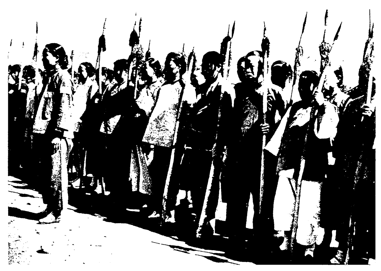
Women guerilla fighters during the national liberation war.