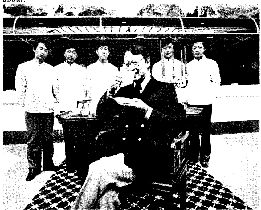
American-born hotel owner has opened China's first deluxe hotel. "I'm making a revolution," he says, " and I'll show them what service is all about."

Decollectivisation also goes handin-hand with an end to relying on the masses to consciously plan production. Today instead the peasant plants according to the logic of the marketplace. One result of this discussed by Schell is that land is being rapidly pulled out of production