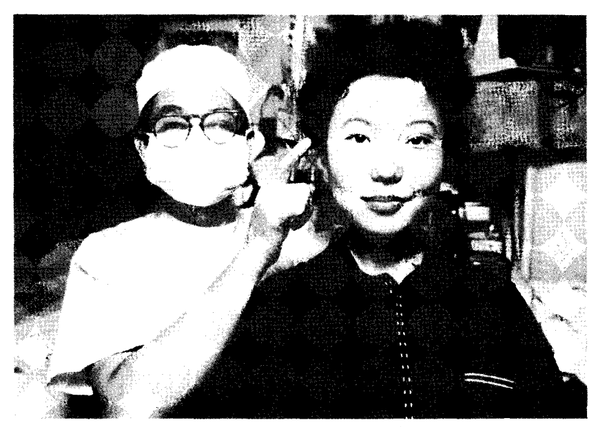
Capitulation and idolizing of the West stretches from high Party leaders to Peking's clinics: cosmetic surgery to give women "double eyelids" common to Western features has skyrocketed in recent years. Only one eye is done at a time.

of grain, and converted to the production of more lucrative cash crops like cotton, tobacco, fruits and vegetables, etc. While increased production of higher-priced goods contributes to an apparent rise in overall agricultural production, it disguises a potential long-term disaster for the Chinese economy. For the practice long established under Mao had been to take grain as the key link in agricultural production, and this was founded on a solid basis. After all, feeding people in a planned and expanding way is a key task. The undoing of socialist policies regarding grain cannot be compensated for by simply relying on the market mechanism to encourage productivity by raising prices — and even if it could, rising grain prices would lead to further disaster. The poorer workers — and polarisation is certainly increasing in the cities too would be left unable to afford the grain, and inflation, rampant in prerevolutionary China, would be pushed ahead. But if the current regime doesn't let grain prices rise. then land will continue to be taken out of grain production, giving rise to shortages and hunger.