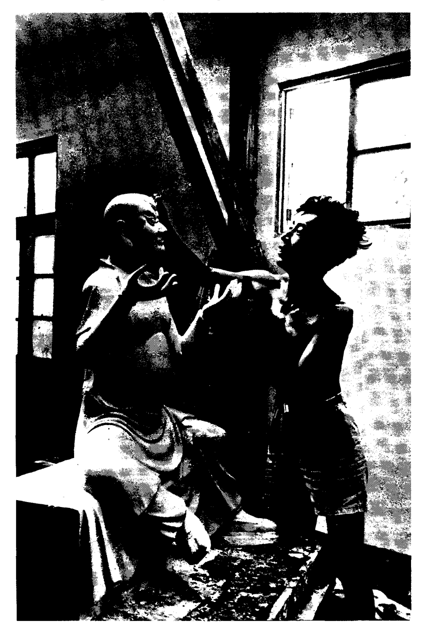
Reactionary subjects like this Buddha and other demons, ghosts and mummies are once again the vogue among artists in China.

to suggesting the old exploitative society the Communists had set out to transform with their revolution. But sensitivity to such socialist niceties is evidently on the wane, for as I watched, a potato-shaped woman, carrying several net bags bulging with food and packages, rudely tapped the driver on the chest with her fan and woke him up. After haggling over the price, she heaved her bulk into the pedicab and barked an order, and a moment later they were off, the calf muscles of the driver flexing as he strained to get his vehicle moving."