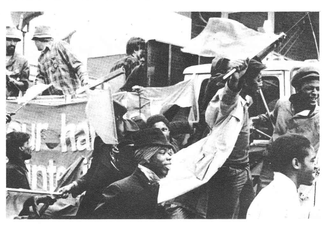
May Day 1980