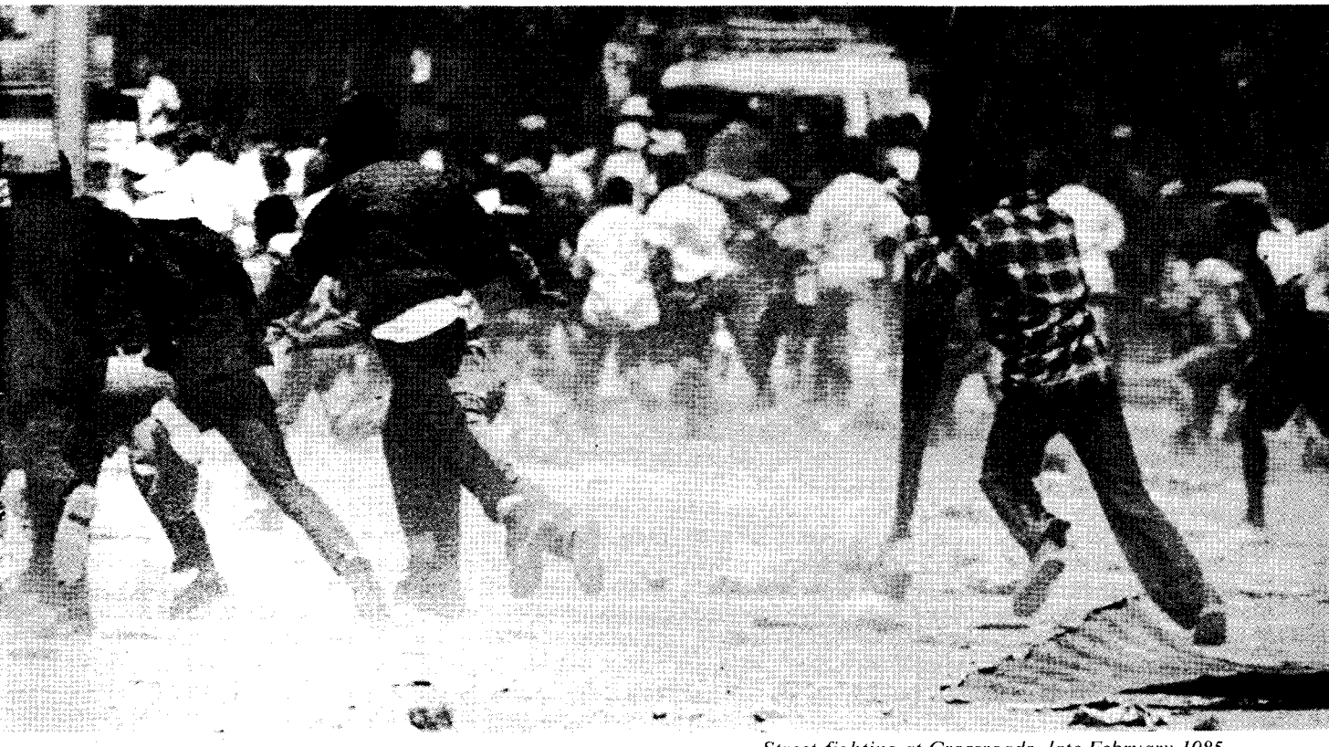
Street fighting at Crossroads, late February 1985.

theid's system of rule, becomes clea- had been photographed shaking the rer. But as we will see later, this is laced up with the crisis of the impe-