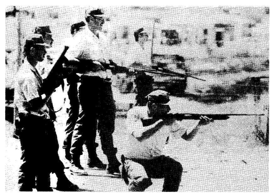
Botha's "Law and Order."

lest of fig leaves is both highly instructive and a tremendous spur to further exposure and revolt for the masses. It is in this light that the scrambling has begun in earnest for qualified demagogues, turncoats and sleeping pill vendors.