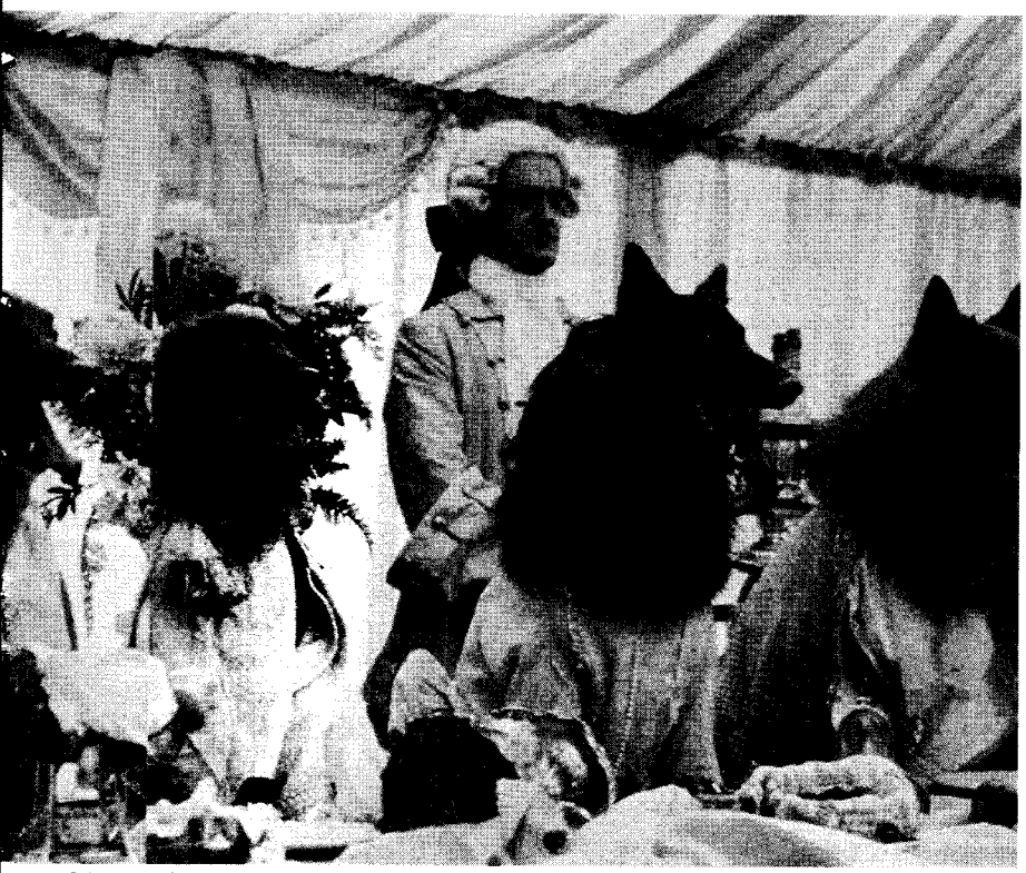
Africa to discuss "Meaningful Reform of Apartheid Today."

Cubans) agreed to stop the Namibian guerrillas of SWAPO (South West African Peoples Organisation) from operating out of neighbouring Angola. Mozambique pledged to cut off aid and sanctuary to the pro-Soviet African National Congress(ANC), a South African organisation operating partly out of Mozambique's territory.