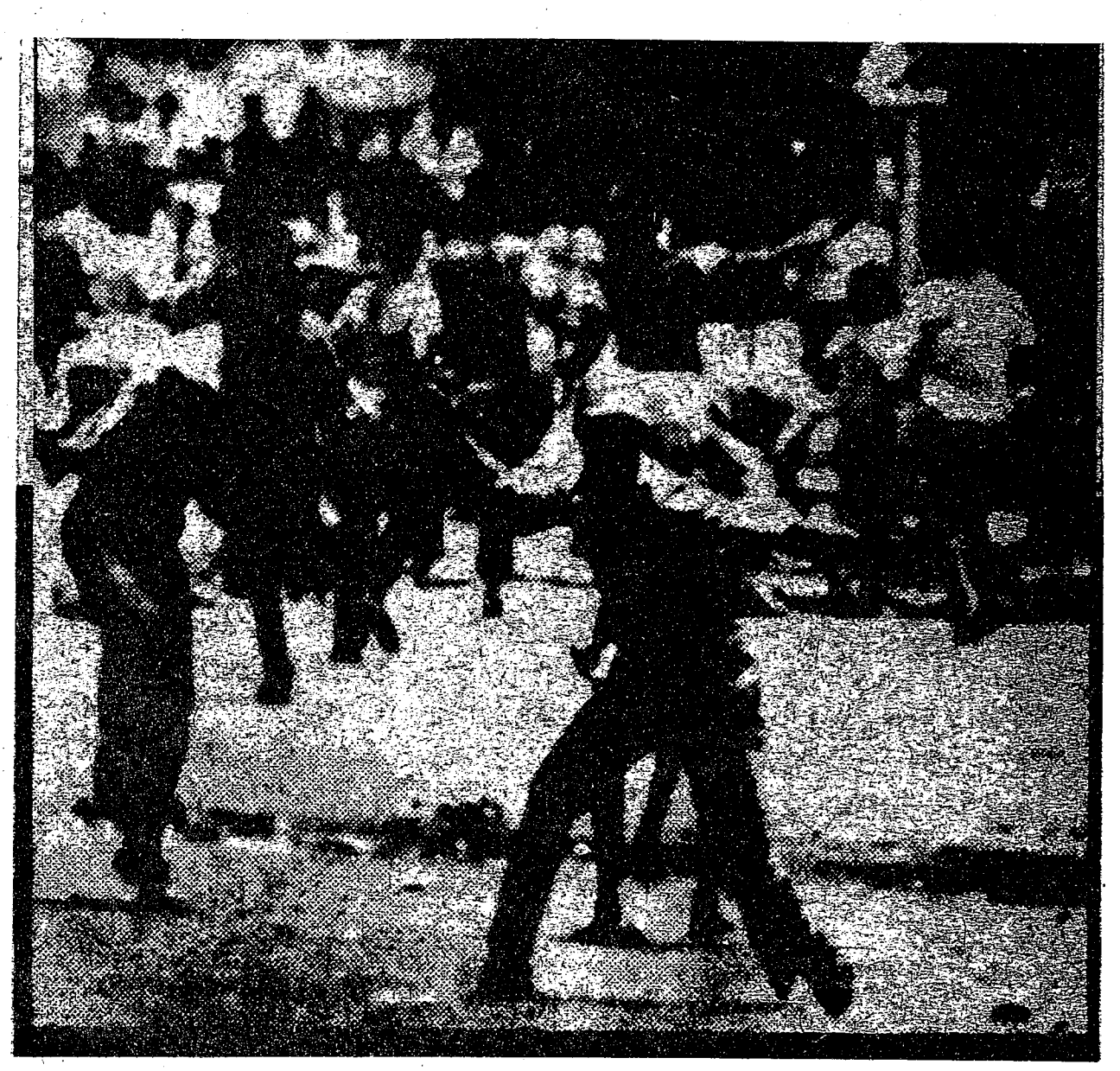
On April 23 and 24, a social earthquake shook the Dominican Republic.