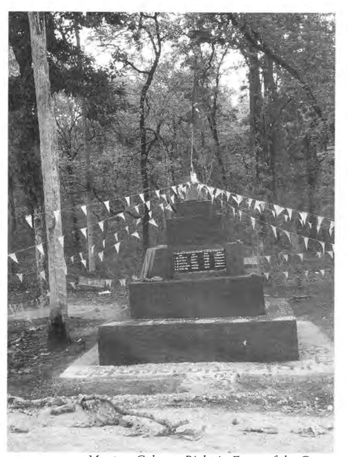
Martyrs Column Right in Front of the Camp

Since then, the movement against the building of the paramilitary camp in Silger has been continuing for a year now, expanding into a bigger movement against the setting up of multiple paramilitary camps every 3-4 kms. On 2nd Nov 2021, joint squad of Commando Battalion for