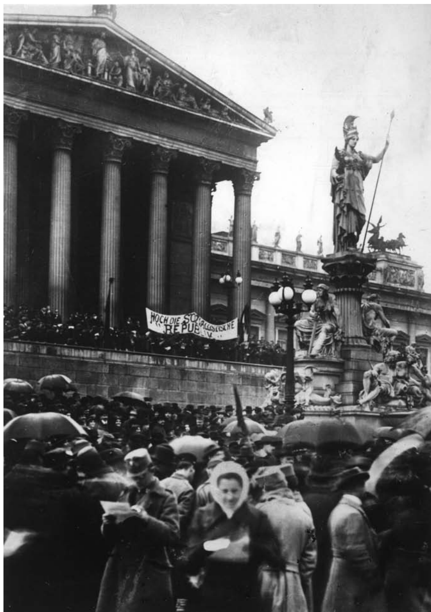
FIGURE 3 Mass demonstration in front of Parliament on the occasion of the proclamation of the First Republic of German Austria, 12 November 1918