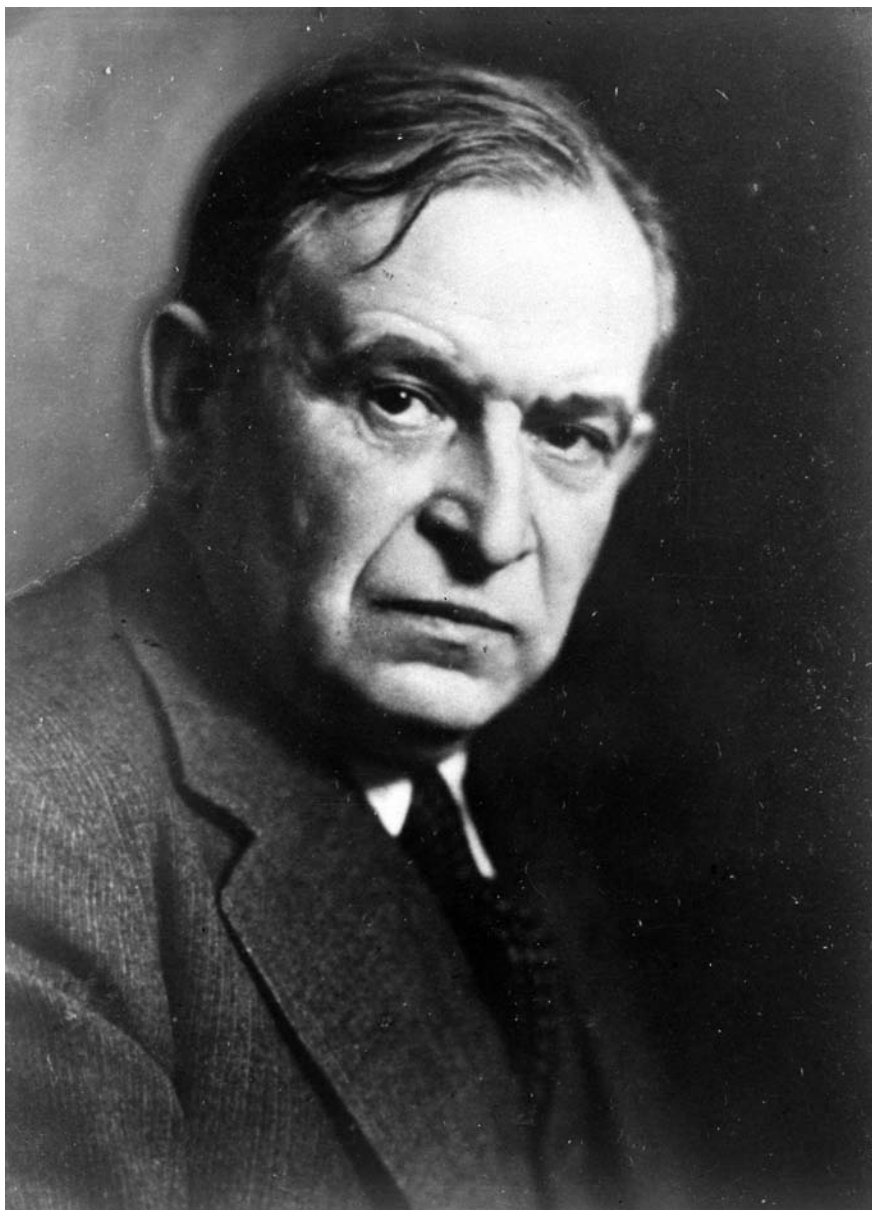
FIGURE 2 Otto Bauer ÖSTERREICHISCHE NATIONALBIBLIOTHEK, INVENTORY NUMBER: LW 75202-B.