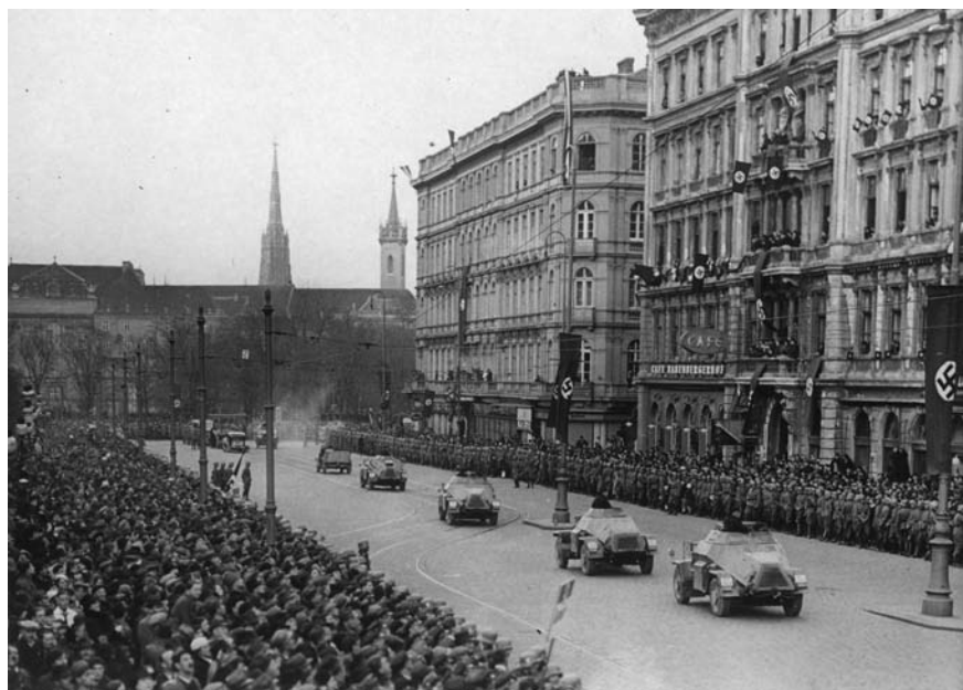
FIGURE 21 Hitler in Vienna, 15 March 1938.