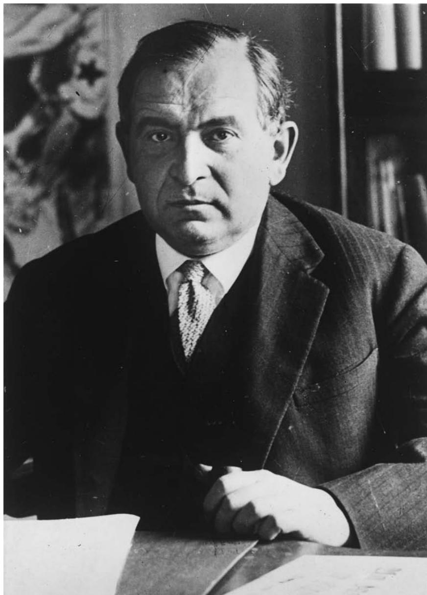
FIGURE 8 Otto Bauer in 1931

PHOTOGRAPHER: ALBERT HILSCHER. ÖSTERREICHISCHE NATIONALBIBLIOTHEK, INVENTORY NUMBER: H 680/2