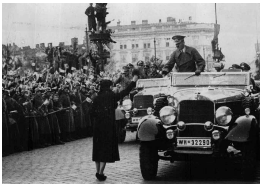
FIGURE 19 Warm welcome for Hitler in Vienna, 1938 ÖSTERREICHISCHE NATIONALBIBLIOTHEK, INVENTORY NUMBER: S 60/41