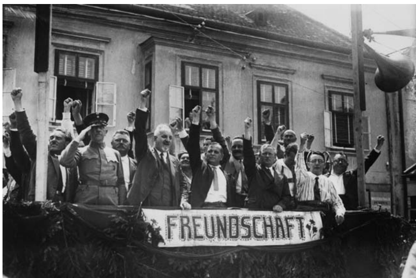
FIGURE 13 Protection League (Schutzbund) march in Eisenstadt, 1932; Otto Bauer standing in the middle on the bleachers