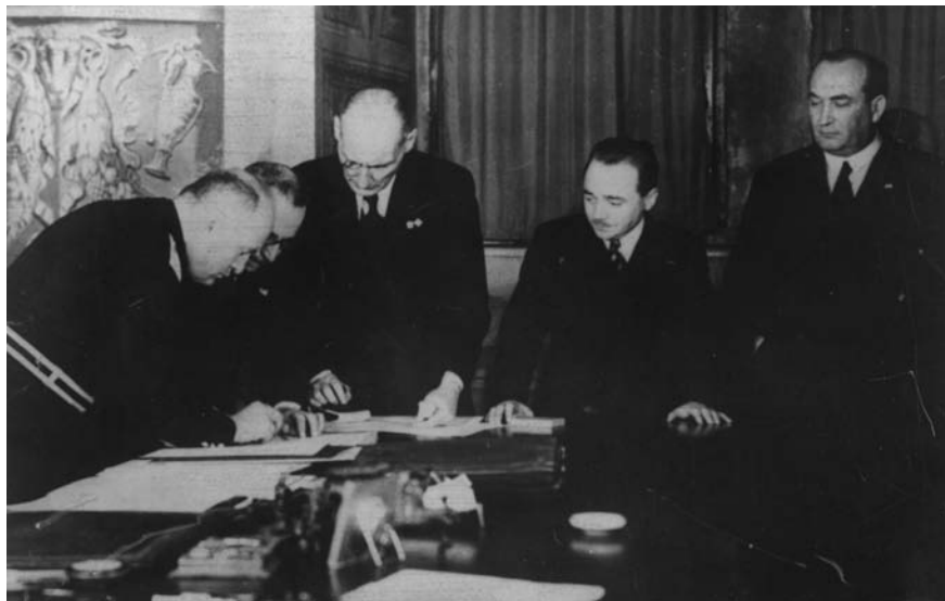
FIGURE 18 Dollfuss with Gombosi and Mussolini, signing the Rome Protocols on 17 March 1938 ÖSTERREICHISCHE NATIONALBIBLIOTHEK, INVENTORY NUMBER: PF 5465 c(36)