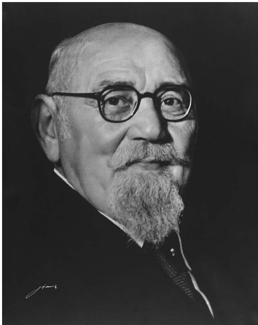
FIGURE 6 Karl Renner, First President of the 2nd Republic, around 1949 ÖSTERREICHISCHE NATIONALBIBLIOTHEK, INVENTORY NUMBER: SIM 21