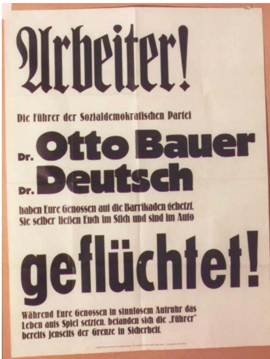
FIGURE 17 Flyer announcing Otto Bauer and Julius Deutsch's escape in 1934. (Text: "Workers! The leaders of the Social Democratic Party: Dr. Otto Bauer – Dr. Deutsch – drove your comrades to the barricades. They let you down and fled by car! While your comrades put their lives at risk in senseless revolt, the "leaders" were already safe at the other side of the border.")

ÖSTERREICHISCHE NATIONALBIBLIOTHEK, INVENTORY NUMBER: PLA16318199