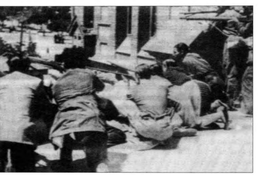
Street-fighting against the rebel military.

In the Federal Republic of Germany, the armed resistance to the German occupation has been hushed up for another, more telling reason. In any event, what furnished the popular theme in newspaper articles, films, and television documentaries was the French resistance. But, here too, the focus of interest was on persecution: Espionage, detention, torture, and deportation to the concentration camps have a much higher profile than resistance activities, which is scarcely surprising, in that these activities were directed against Germans. German soldiers travelled on the trains that the partisans derailed. The officers of the German security service that Dutch resistance fighters gunned down in the streets were German officers. The troops who perished in a partisan ambush in the forests of Lithuania were their own brothers, fathers, and grandfathers.