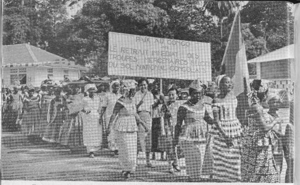
Two women members of the Chinese delegation marching in the International Working Women's Day demonstration at Kissidougou, Guinea