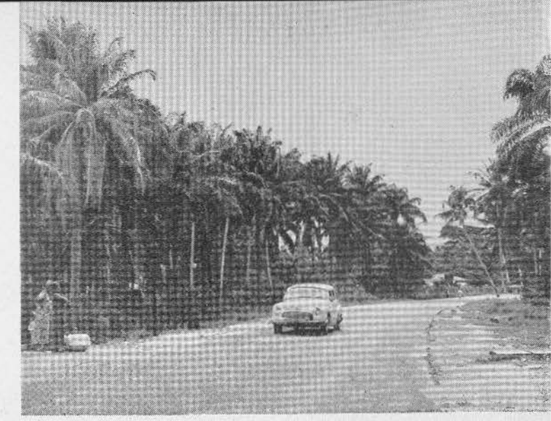
Palm groves, Dahomey