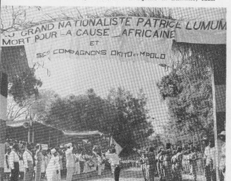
The ceremonial naming of Lumumba Square in Bamako, Mali