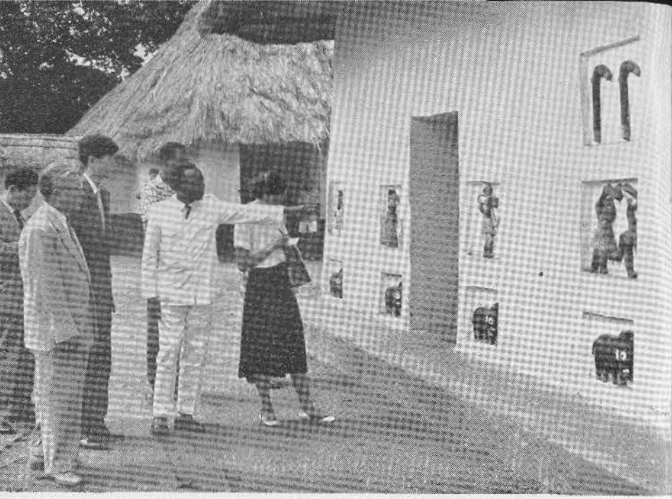
The delegation of the Chinese-African People's Friendship Association visits a museum in Abomey, Dahomey