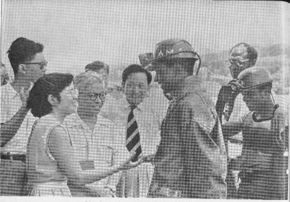
Members of the friendship delegation talk with Ghanaian coal-miners

Niger friends hand out tasty pieces of barbecued mutton to the visitors