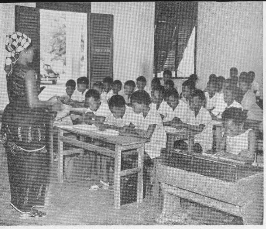
Fourth-graders in a state primary school in Lomé, Togo