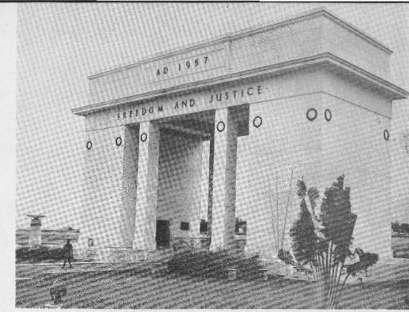
Arch of Independence on the February 28 Road, Acera, Ghana