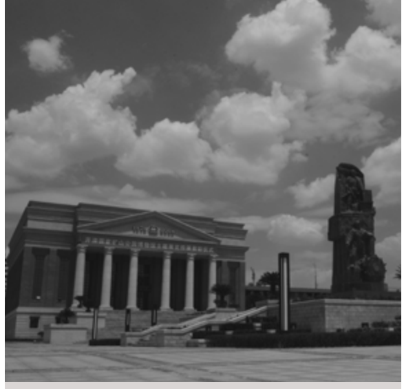
Kailuan National Mine Park in Tangshan