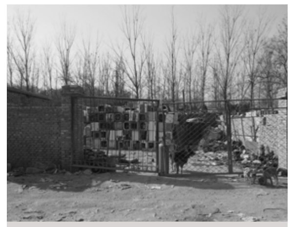
A workshop in Dongxiaokou, late 2014

Hundreds of family-owned enterprises dominated the landscape. They all looked more or less the same. Behind a metallic gate was a rectangular courtyard where old newspapers, waste wood, plastic bottles, used electronics, or anything else with a commercial value was stored. In one of the corners of the yard there was always a small building, usually composed of two rooms, where an entire family lived. Sometimes a dog was chained to one of the walls to guard the yard.