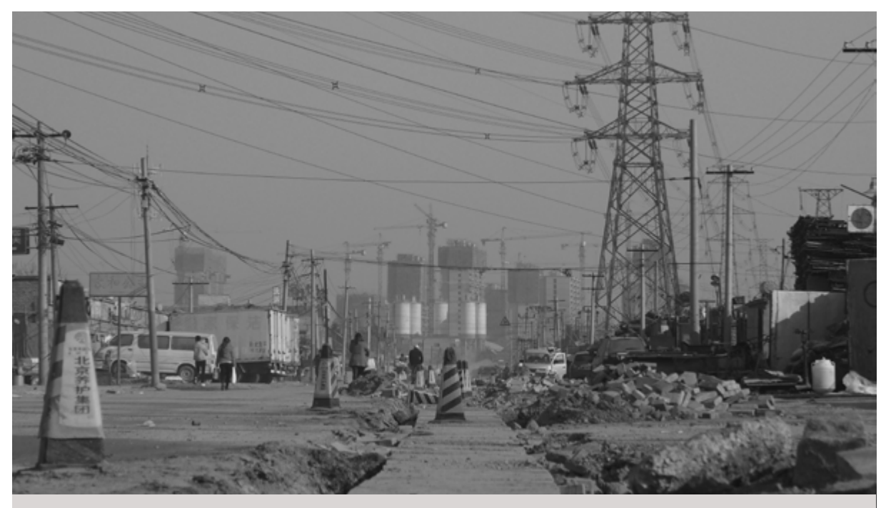
Urbanisation on the outskirts of Beijing. Dongxiaokou, late 2014.