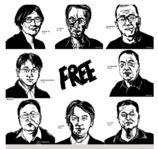
Free the Rights Defense Lawyers, by Badiucao