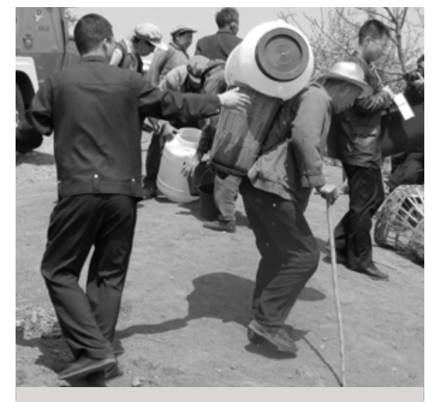
A water delivery initiative in northwest Yunnan. Famers receive barrels of drinking water from the government while fresh water from local springs is impounded and diverted elsewhere.