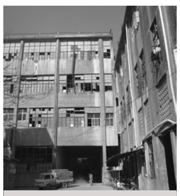
The former state-owned People's Porcelain Factory, 2010.

remnants of China's socialist past. In Jingdezhen, the bulldozer approach to urban planning began in 2000, when the Bureau of Industry and Commerce bought the Jingxing Porcelain Factory, demolished it, and turned the area into a fruit and vegetable market. Other sites of socialist industry were torn down and replaced with retail storefronts and apartments.