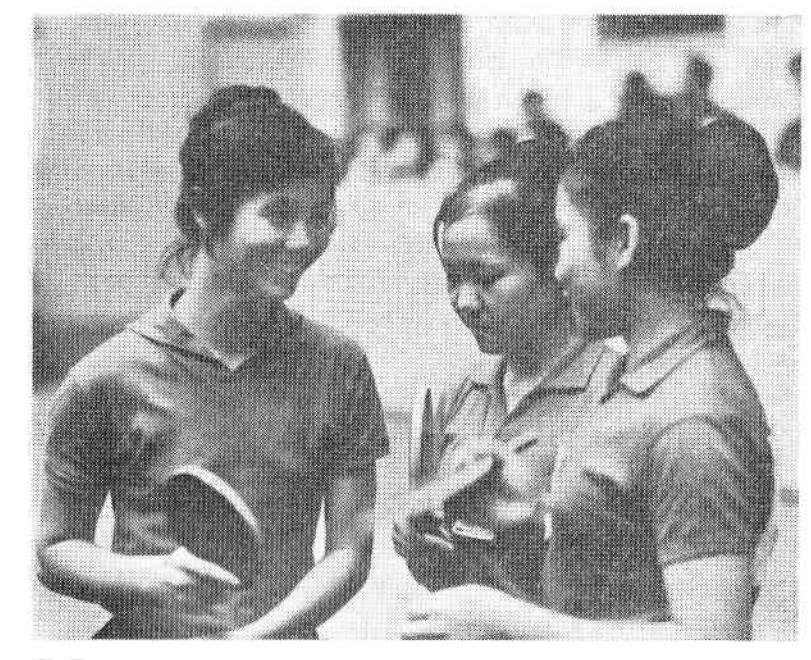
The First Asian Table Tennis Championships

During the Spring Festival new colour documentary films were released in Peking and elsewhere throughout the country. They include Tachai the Red Banner; The First Asian Table Tennis Championships; Samdech Sihanouk Visits Tsinan and Tsingtao; The Chinese Table Tennis Delegation Visits Canada, the United States, Mexico and Peru; Hunting an Elephant and The Taming of the Deer.