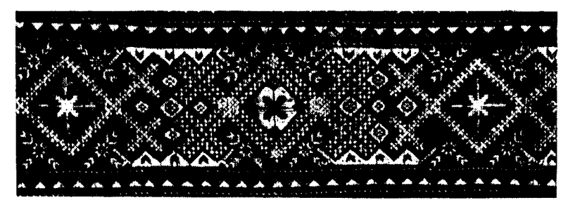
Design for a border

Before liberation the Miao women, suffering from feudal exploitation and oppression, had no chance to study the fine arts. But generation after generation they inherited and developed the craftsmanship of their predecessors. Though they have never studied drawing, they can sketch the beautiful objects they see from memory and then reproduce them with a thread and needle. The more experienced and gifted among them embroider lifelike representations of leaping fish, flying and singing birds, running beasts, flitting butterflies or a single blade of grass or herb. From their practice they have learned the rules of Chinese art, especially of decorative art. In the complex world of flora and fauna, they make a point of capturing the typical posture and features of different objects, instead of striving to achieve a detailed likeness. For they know that even if they succeeded in turning out an exact replica of the real thing, people would not like it so much. Their designs are stylized imitations of nature, vividly and graphically bringing out the special features of the objects delineated.