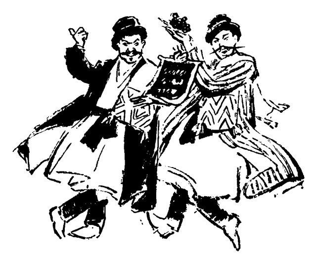
Two Men Deliver Gifts

A team from Lanchow presented a one-act comic opera Fighting for the Basket to show the comradeliness in our army units. A squad leader refuses to let his vice squad leader go out to work with the others because he is unwell. But since the squad leader has just returned from a company meeting, the other insists that he must have a rest. Both try to grab the basket for carrying manure and a comic situation arises. Finally the squad leader who has tried to lock up the vice squad leader is locked up himself, and this turning of the tables brings the house down.