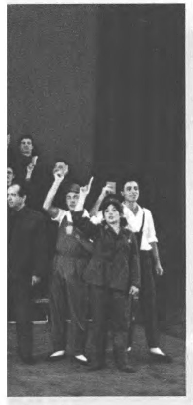
se People's Liberamary masses in the erformance. After sponsible comrades a together with the