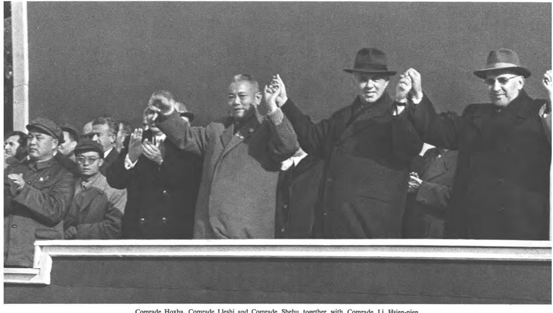
Comrade Hoxha, Comrade Lleshi and Comrade Shehu together with Comrade Li Hsien-nien and Comrade Li Teh-sheng, head and deputy head of the Chinese Party and Government Delegation, on the reviewing stand. A grand military review and mass parade was held in Tirana, capital of Albania, on November 29, 1969 to celebrate the 25th anniversary of the liberation of Albania and the victory of the people's revolution.