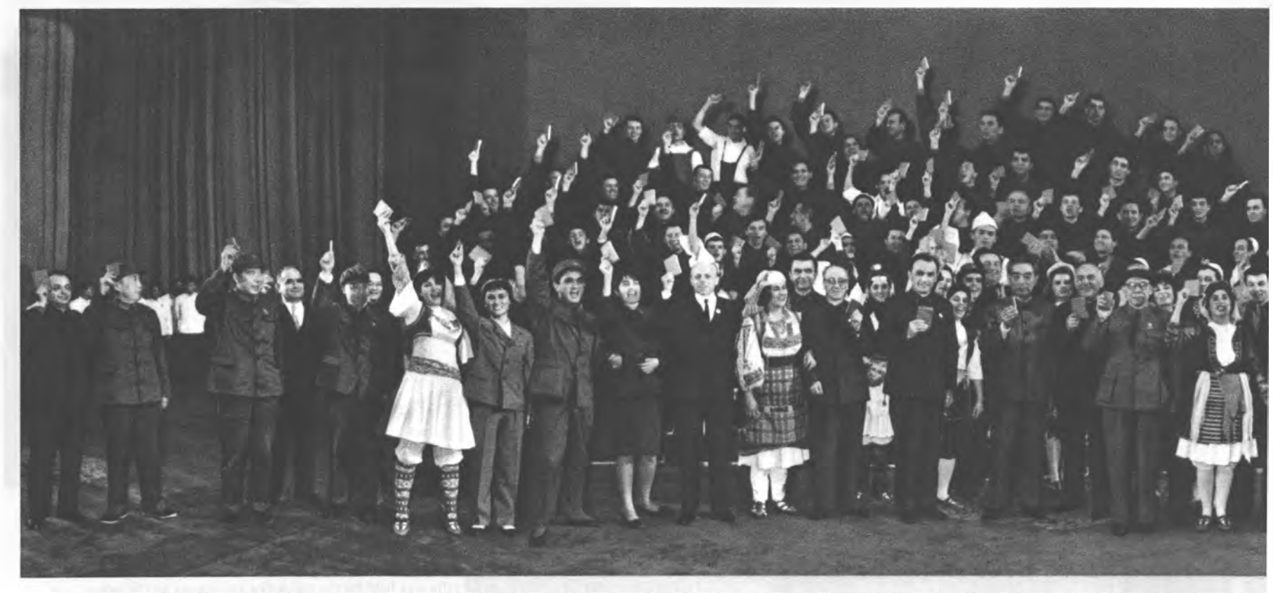
On the evening of November 27, 1969, the Albanian People's Army Art Troupe gave a splendid performance at the Great Hall of the People. Attending the performance were: Chou En-lai, Chen Po-ta and Kang Sheng, Members of the Standing Committee of the Political Bureau of the Central Committee of the Chinese Communist Party; (the following are listed in the order of the number of strokes of the surnames) Wu Fa-hsien, Yao Wenyuan, Huang Yung-sheng and Hsieh Fu-chih, Members of the Political Bureau of the Party Central Committee; and Chi Teng-kuei, Alternate Member of the Political Bureau of the