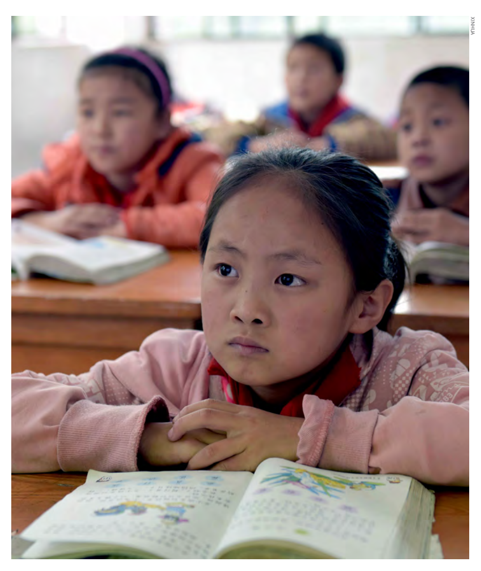
Pupils at an elementary school in a village in Dulongjiang Township at class on May 27, 2017

rant in the township, is from Lijiang, a city in Yunnan. She followed relatives to Dulongjiang 11 years ago, seeking business opportunities.