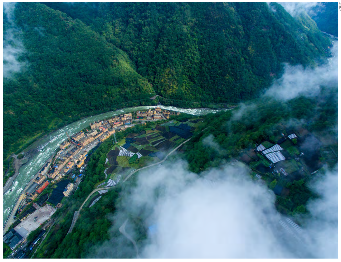
An aerial view of Dulongjiang Township in Gongshan Dulong-Nu Autonomous County, southwest China's Yunnan Province, on April 18

Yunnan, which borders Myanmar, Laos and Viet Nam, has 25 ethnic minorities. The vast mountainous areas in the