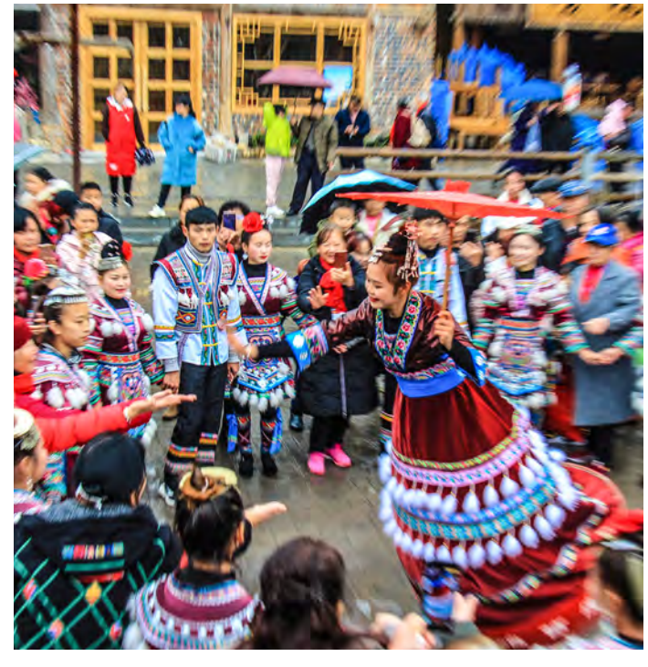
The Miao people celebrate Miao New Year in Rongshui Miao autonomous county of Guangxi Zhuang Autonomous Region, south China, on December 21