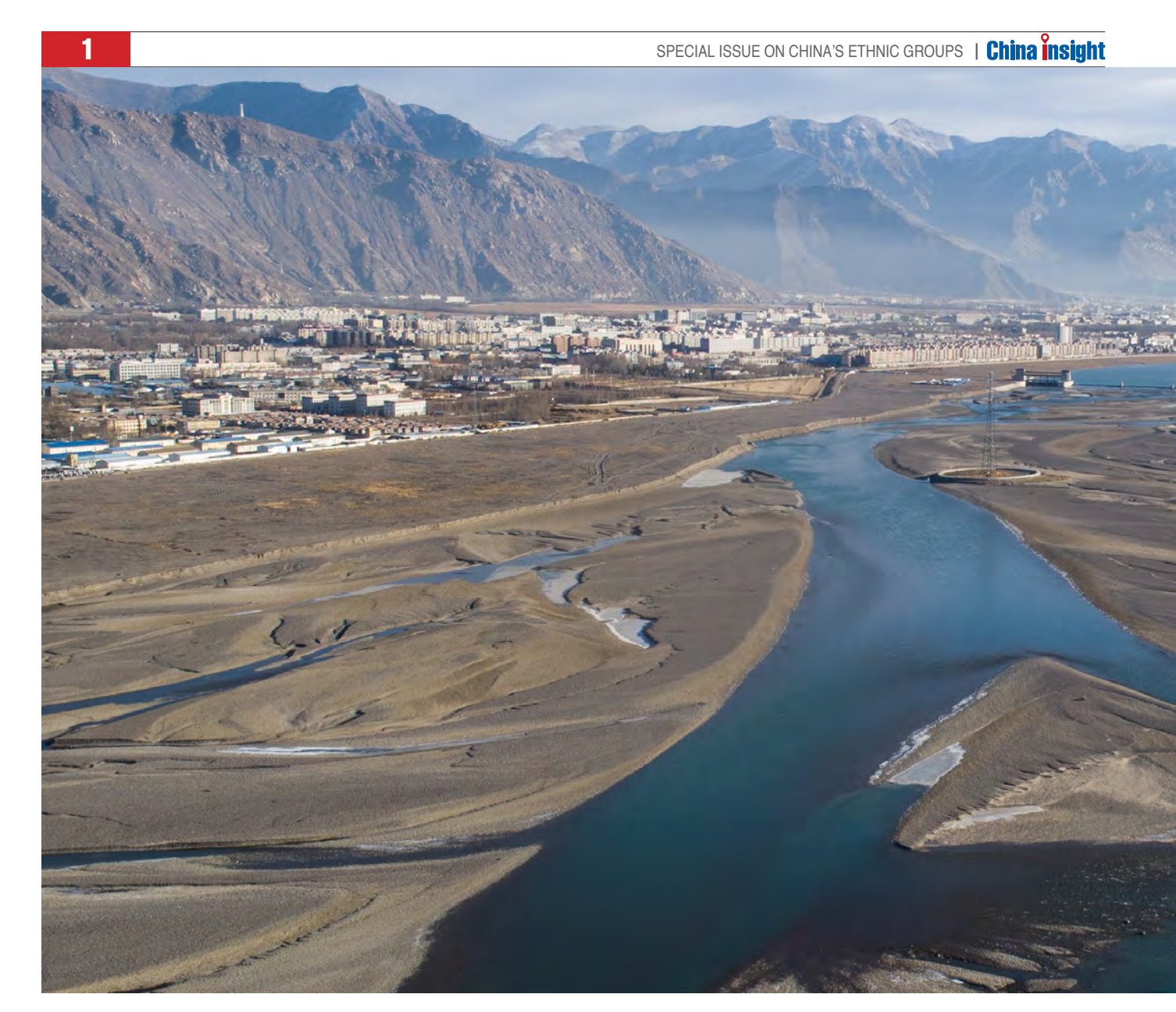
An aerial photo taken on January 11, shows a highway leading to Lhasa, capital city of southwest China's Tibet Autonomous Region