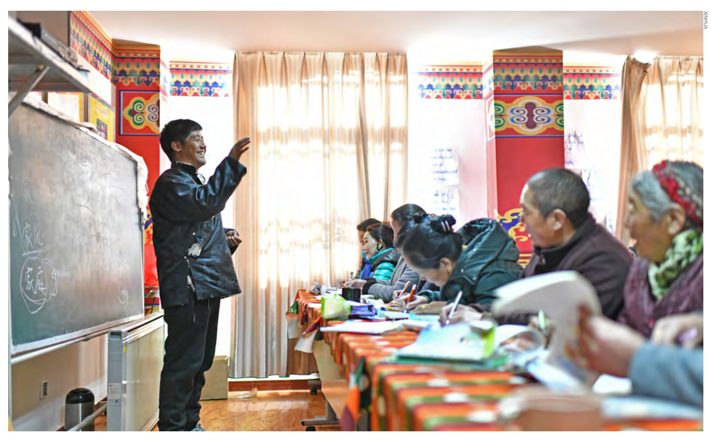
A teacher conducts a cultural course for seniors at an activity center in Lhasa, capital city of southwest China's Tibet Autonomous Region, on March 4

happiness in the afterlife or the next life.