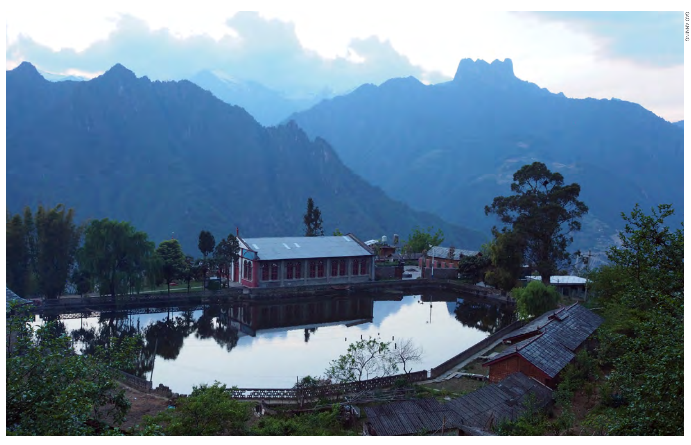
A view from the rooms of the family inn run by Yu Wulin in Laomudeng Village in Nujiang Lisu Autonomous Prefecture, southwest China's Yunnan Province, on April 20

Things began to change in 2000. The local government granted aid to local residents in order to promote tourism, and the couple was the first in Laomudeng Village to open a guesthouse.