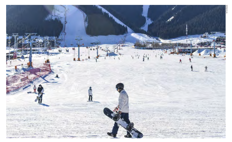
A ski resort in Urumqi, Xinjiang Uygur Autonomous Region in northwest China, on December 8

Next on the agenda, Xinjiang will offer regular and open education and training for village officials, CPC members in rural areas, farmers and herdsmen, as well as