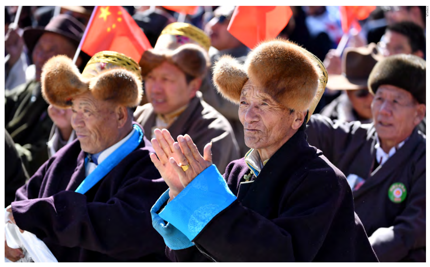
People celebrate the 60th anniversary of the campaign of democratic reform in Tibet at the Potala Palace square in Lhasa, capital city of southwest China's Tibet Autonomous Region, on March 28

participation in the administration of state and local affairs through the people's congresses at various levels.