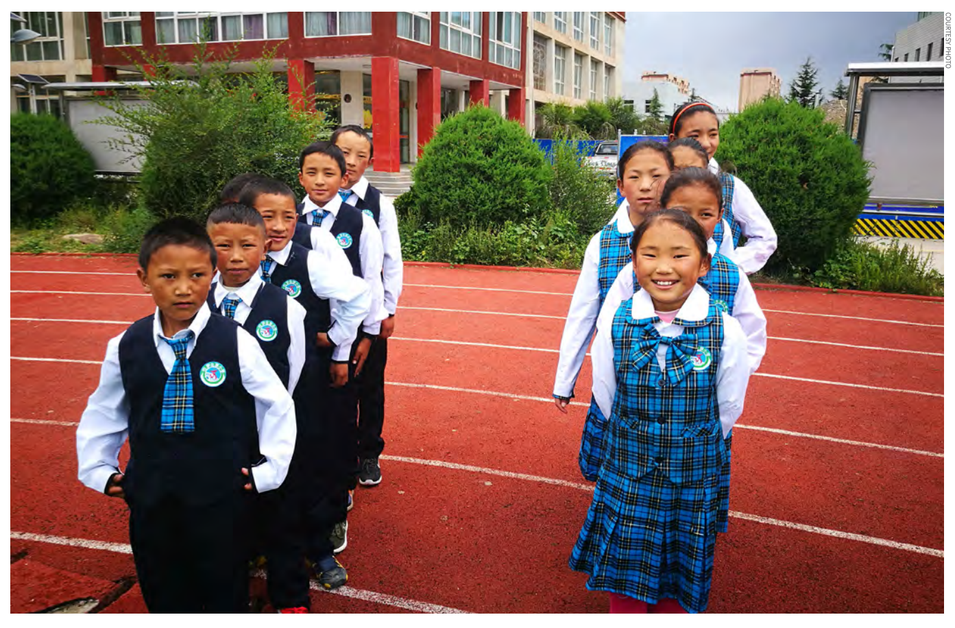
The first batch of Tibetan Children from Shuanghu start their studies in Lhasa on August 31, 2017, with free tuition and accommodations provided

from high blood pressure, hyperlipidemia—abnormally high fat levels in the blood, and hyperuricemia—abnormally high levels of uric acid in the blood, according to Shao Zhengyi, a Beijing doctor who worked at the People's Hospital of Lhasa in 2012. Insomnia and headaches resulting from the lack of oxygen in the air are other common problems.