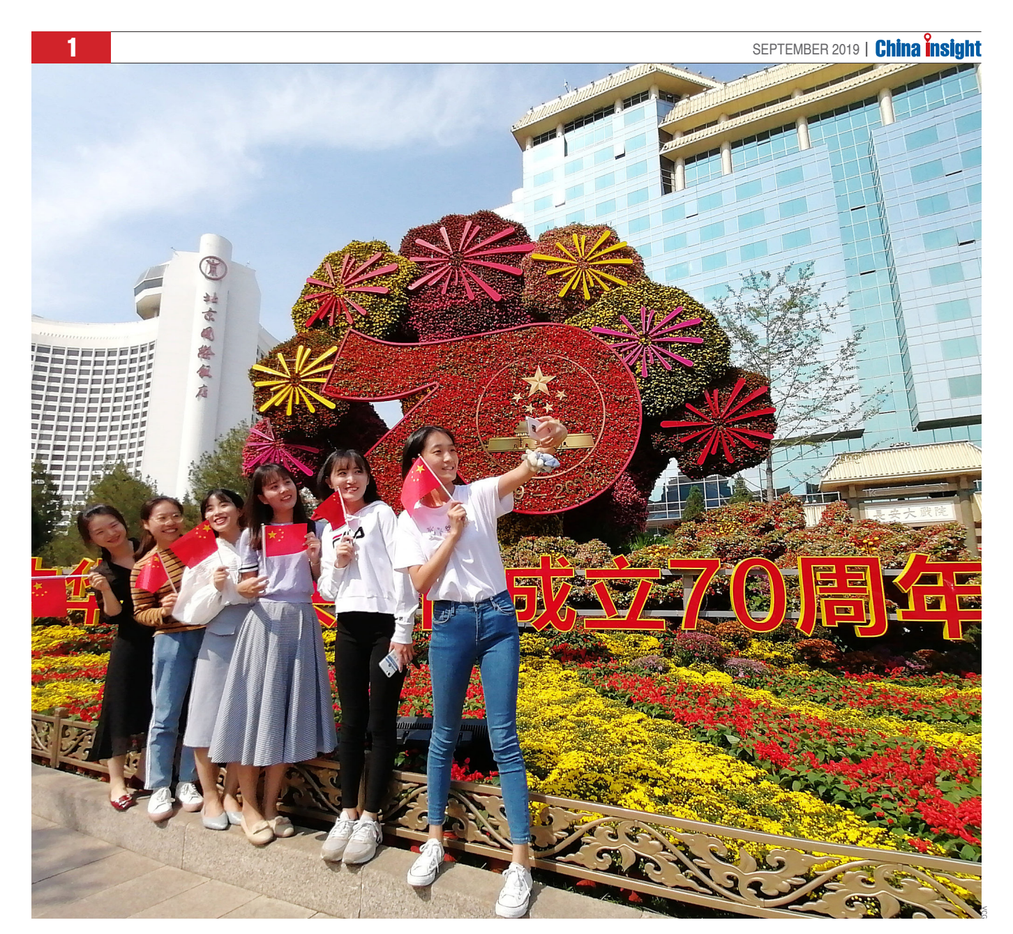
College students pose for photos with the national flag in front of a flowerbed in celebration of the 70th anniversary of the founding of the People's Republic of China in Beijing on September 23