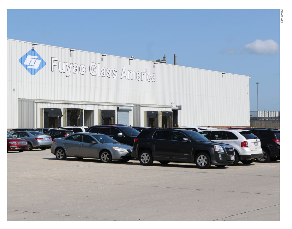
The Fuyao Glass America factory in Moraine, Ohio