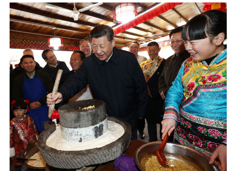
Wenchuan County, southwest China's Sichuan Province, during an inspection tour to the province before the Spring Festival of 2018

Xi's order to make combat capability the fundamental criterion to judge their work.