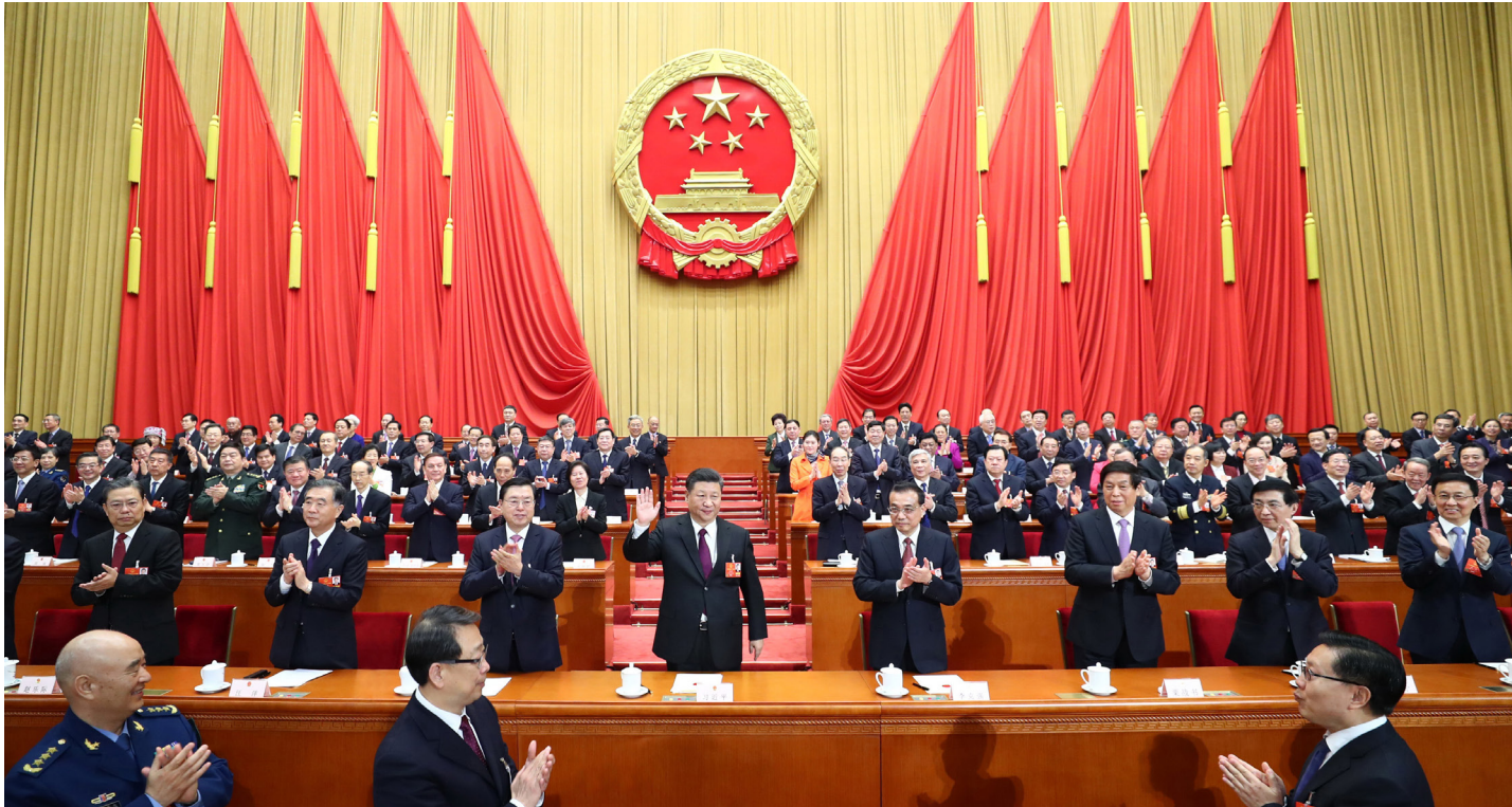
Xi Jinping is elected Chinese president and chairman of the Central Military Commission of China at the fifth plenary meeting of the First Session of the 13th National People's Congress (NPC) at the Great Hall of the People in Beijing on March 17

Xi Jinping steers China toward prosperity