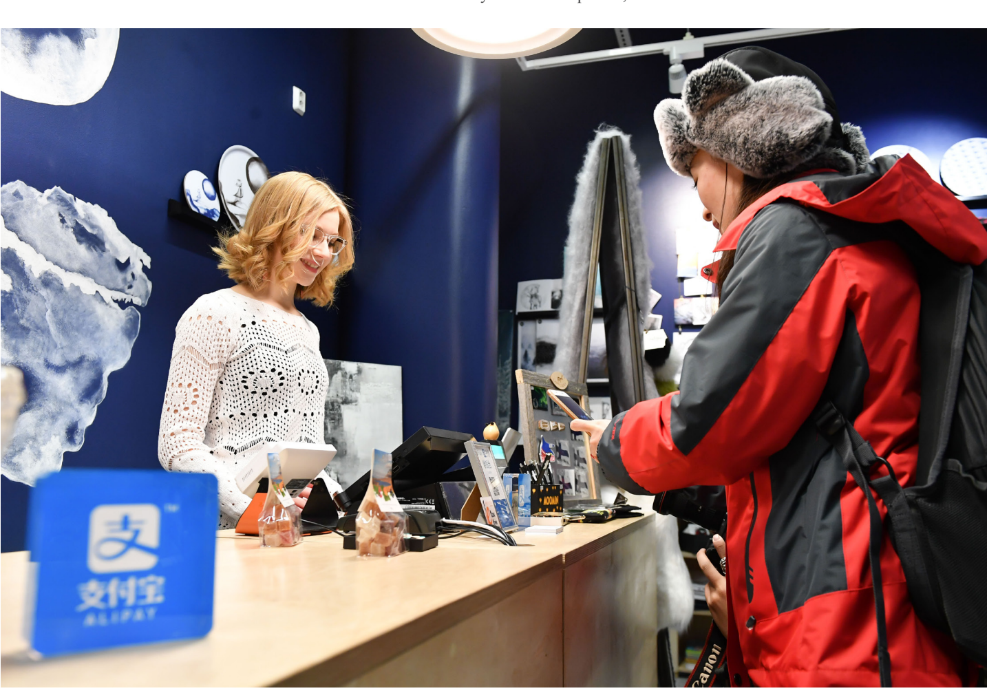
A Chinese tourist pays her bill with her mobile phone in a city in Finland on January 21

(The author is director of the China Institute at Fudan