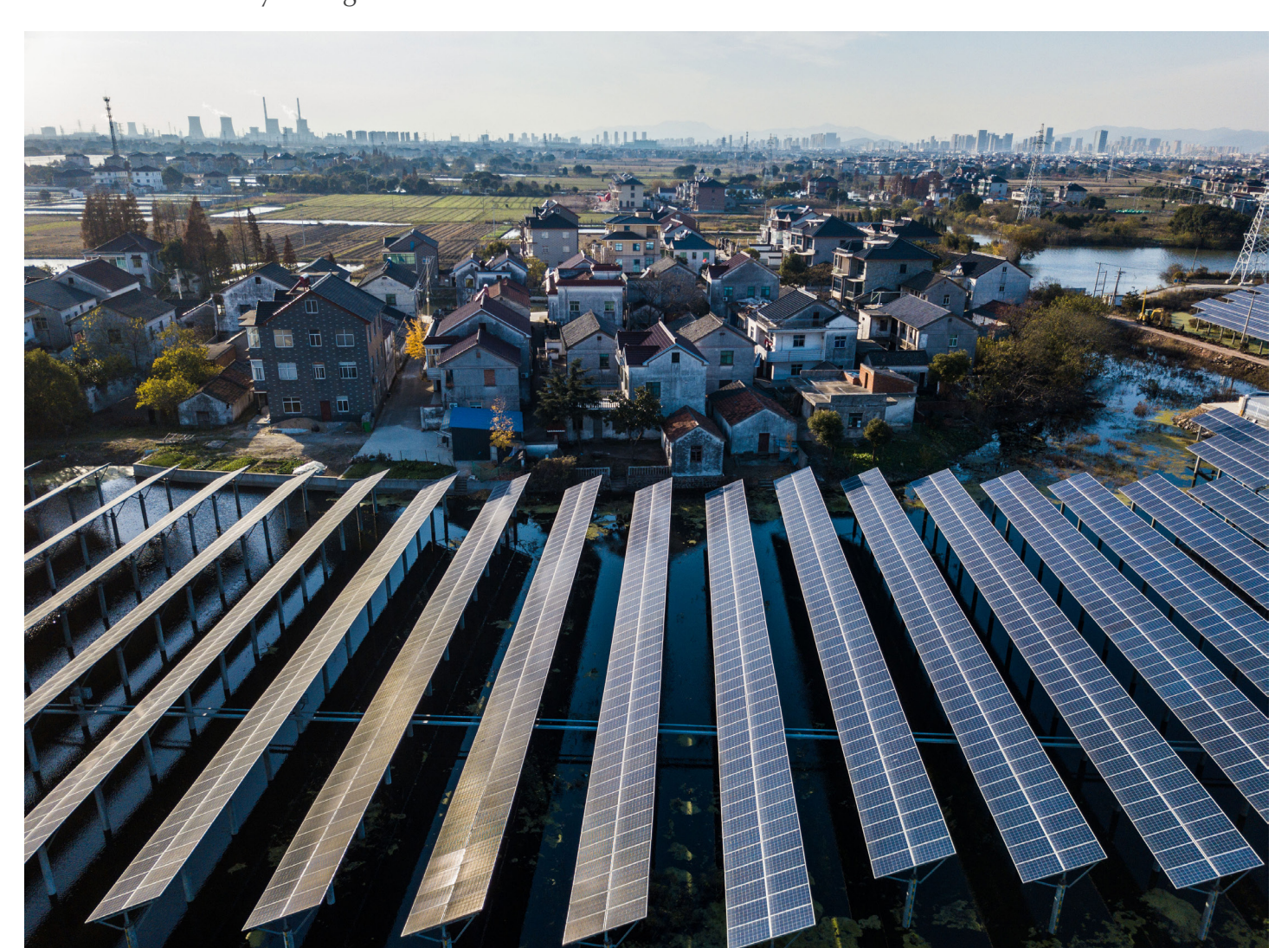
Solar panels of a photovoltaic power generation project in Gulong Village in Changxing County, Zhejiang Province

hina's dramatic rise in recent decades has taken many Western observers by surprise. Those who forecast a pessimistic future for the country have turned out to be wrong. China is now the world's largest economy in terms of purchasing power parity, with the world's largest middle class, foreign exchange reserves, propertied class and number of globe-trotting tourists. China is also the world's leader in renewable energy in terms of both investment and output, and a champion