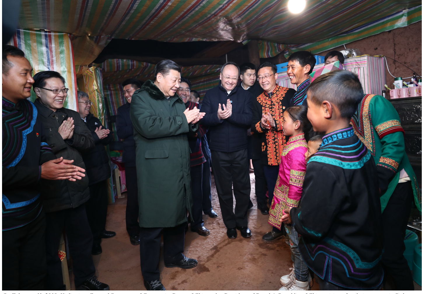
On February 11, 2018, Xi Jinping, General Secretary of Communist Party of China, also President of People's Republic of China, visits a family in poverty in Sichuan Province.

The CPC Central Committee has stressed the need to transform