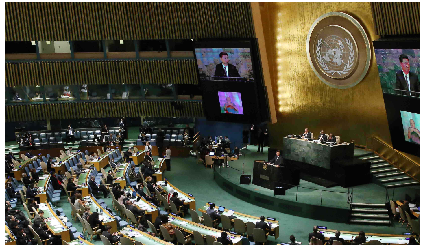
Chinese President Xi Jinping addresses the UN Sustainable Development Summit at the UN headquarters in New York City on September 26, 2015

he world is currently at an historic juncture of a new phase of development. Peace and development are the prevailing trend, nurtured by conditions which suit their advancement as never before. But we are also gradually moving toward a new period of transformation and instability. An increasing number of global challenges demand that countries upgrade their philosophies of global governance and overcome their differences.