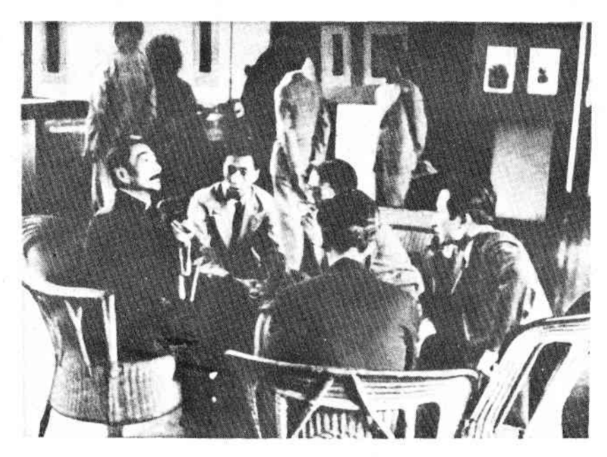
Lu Hsun with the Woodcut Discussion Group