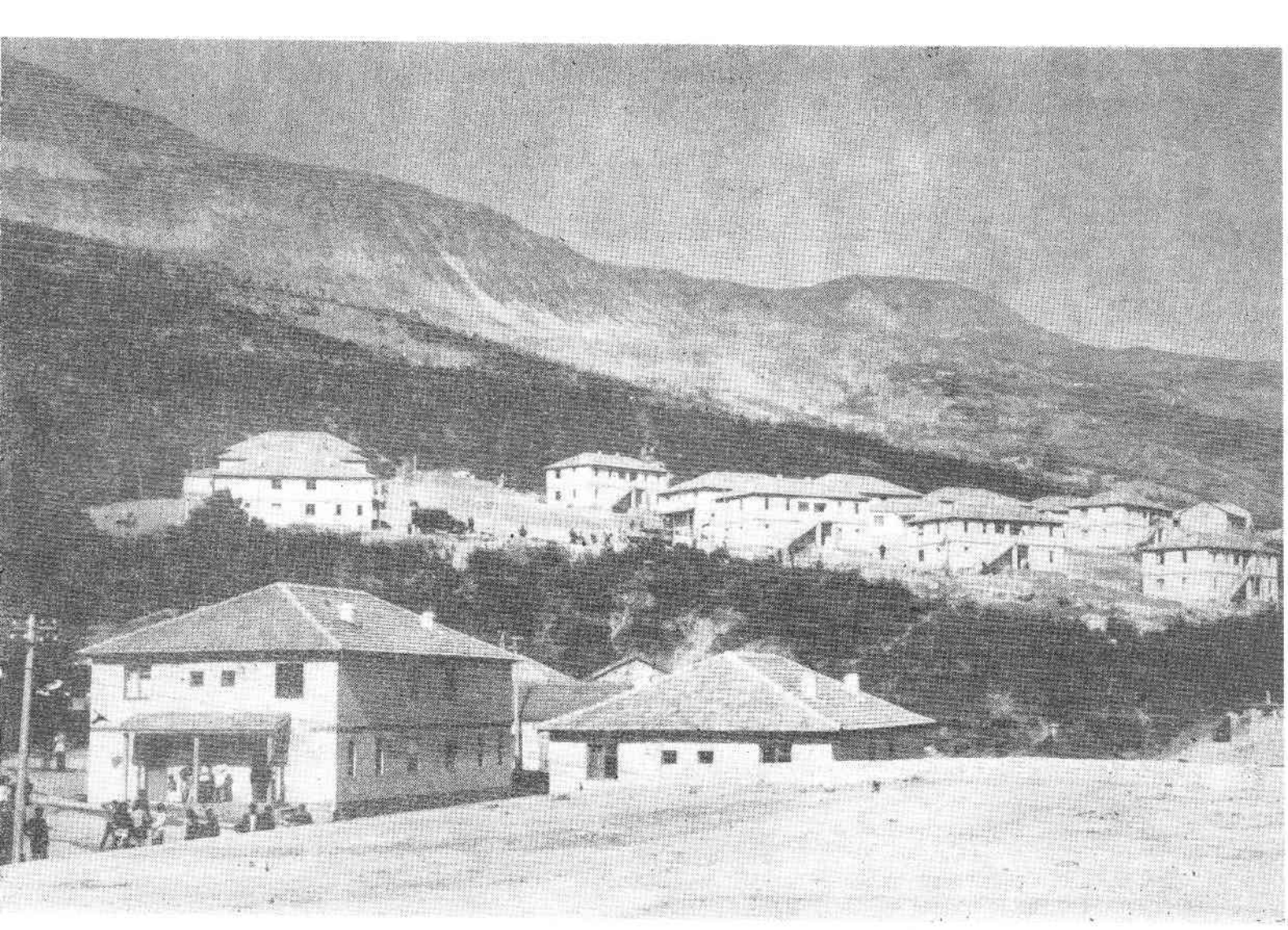
A partial view of the new village of Moglica.