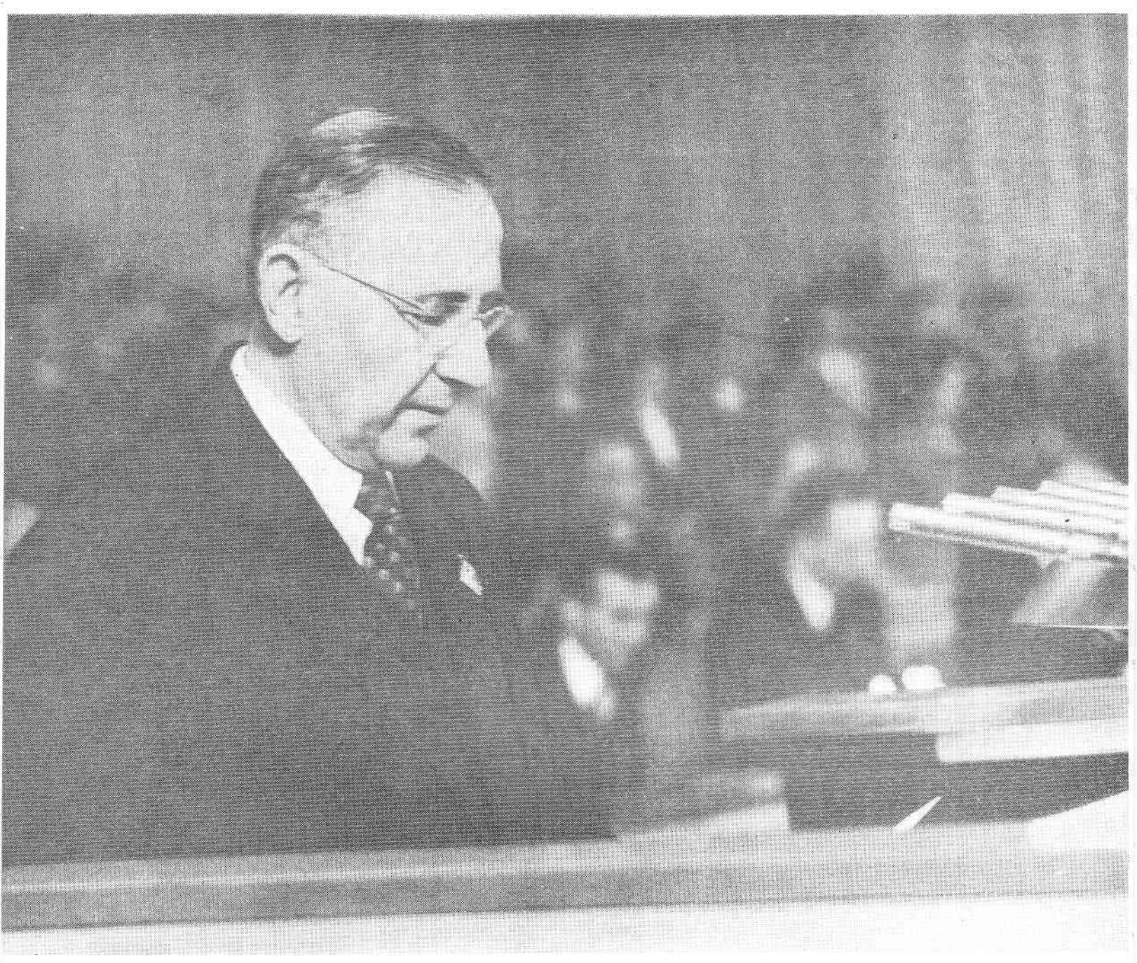
The Member of the Political Bureau of the Central Committee of the PLA and the Chairman of the Council of Ministers of the PRA, Mehmet Shehu submitting his report