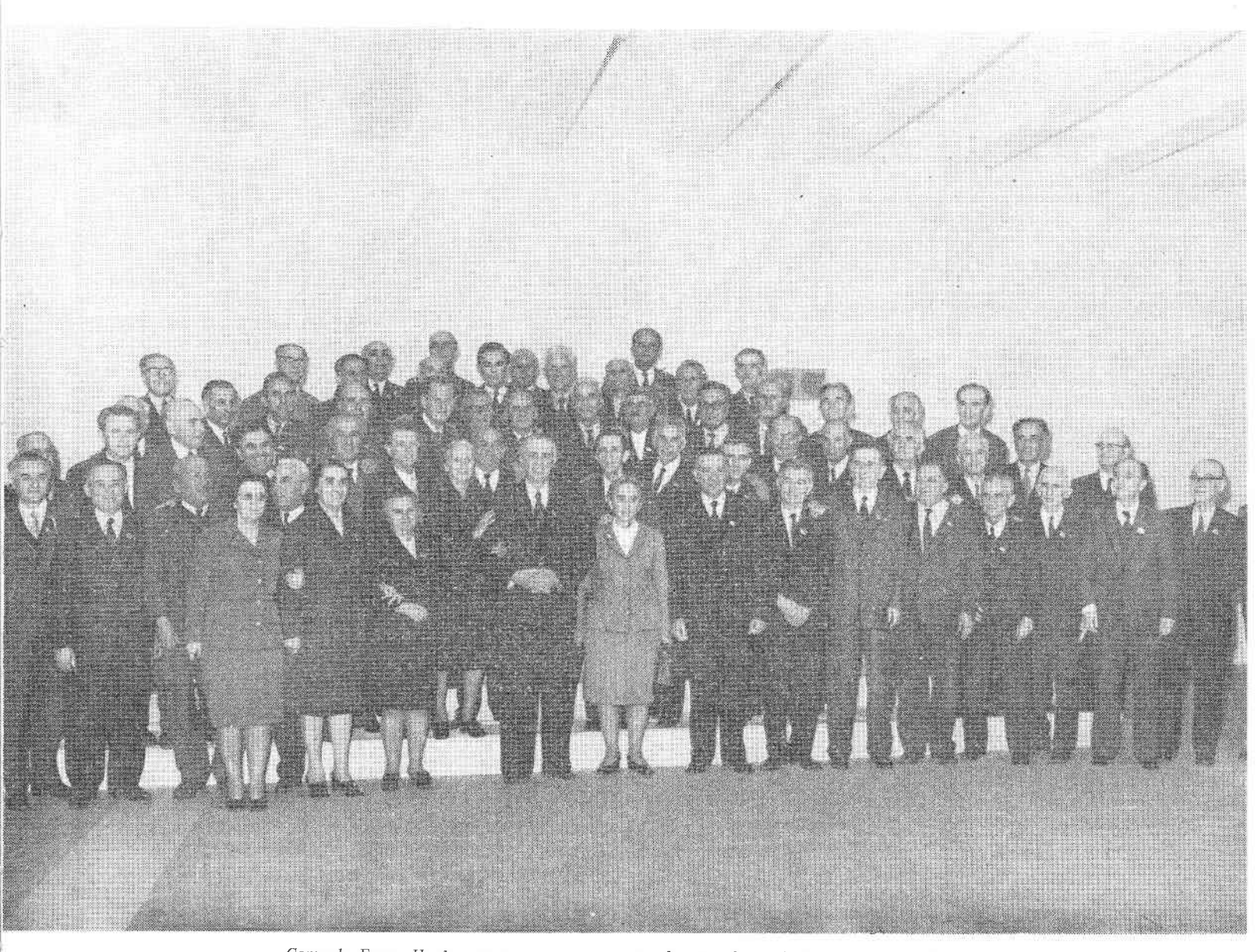
Comrade Enver Hoxha among a group of comrades, members of the Party since 1941