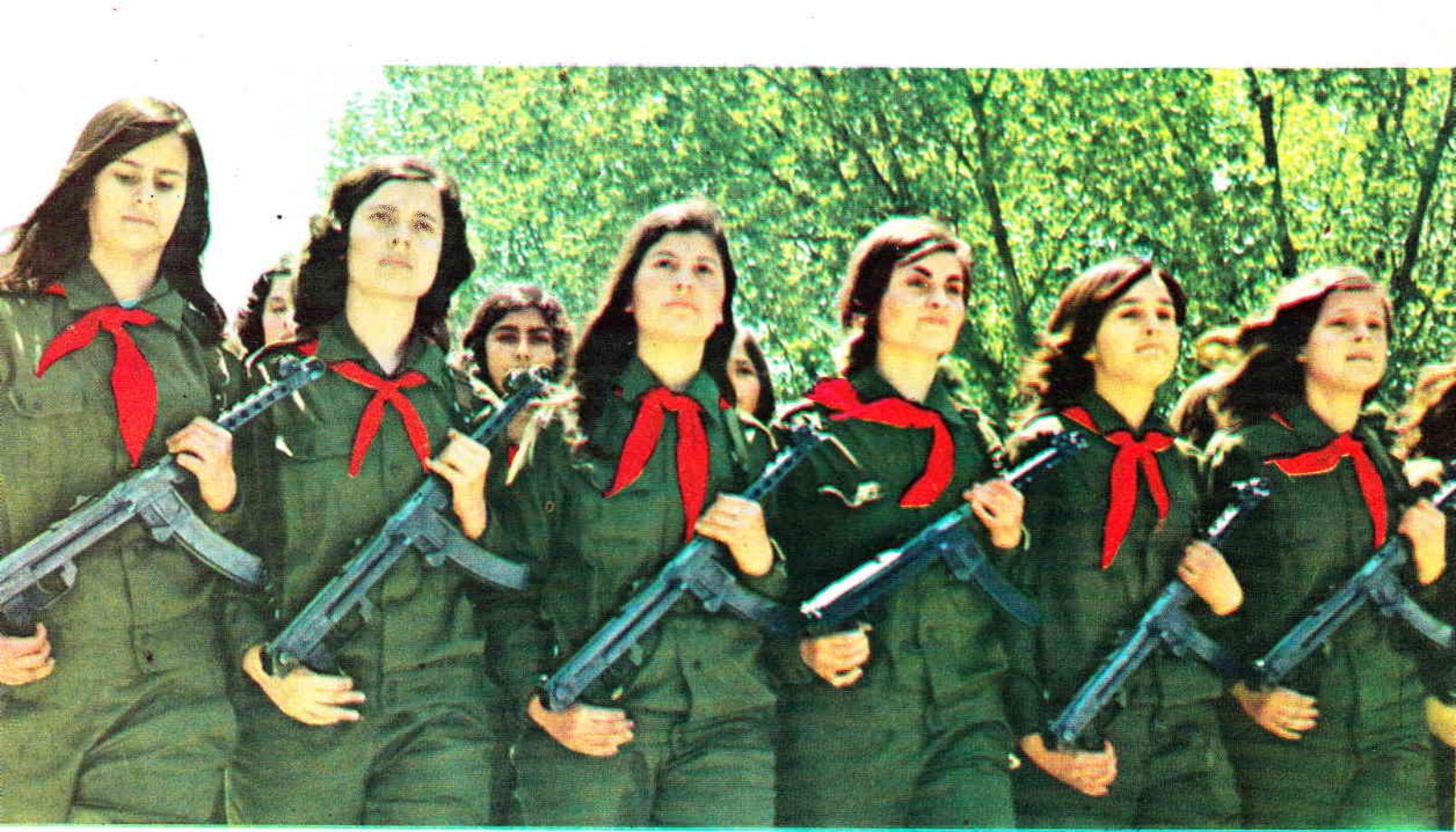
There is no stronger army than the people armed and militarily trained and there is no more powerful weapon than the people's war in the flames of which any aggressor is burned and destroyed.

*KEEP HIGH THE REVOLUTIONARY SPIRIT. a sculptural tragment by Mumtas Dhrami.