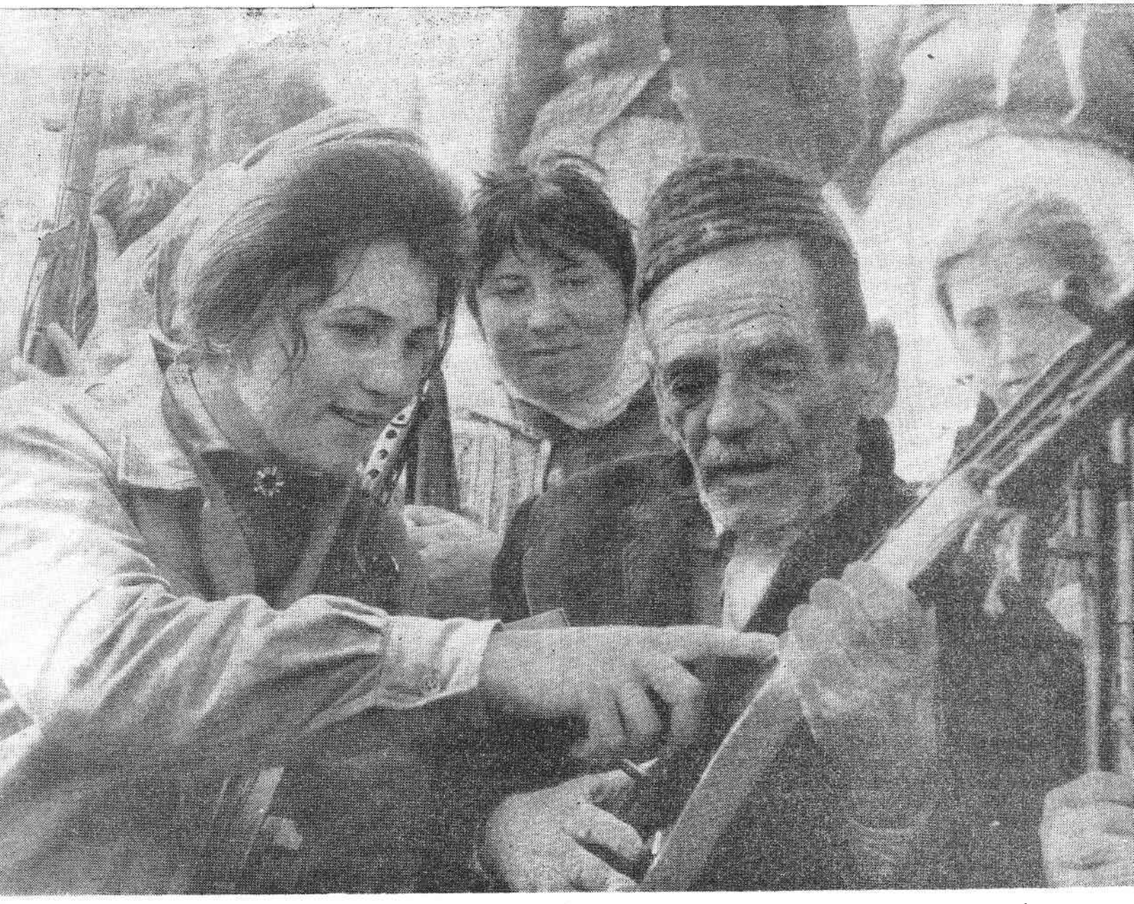
The gains of socialism with us are secure, for they are defended by the People's Army and the whole soldier people