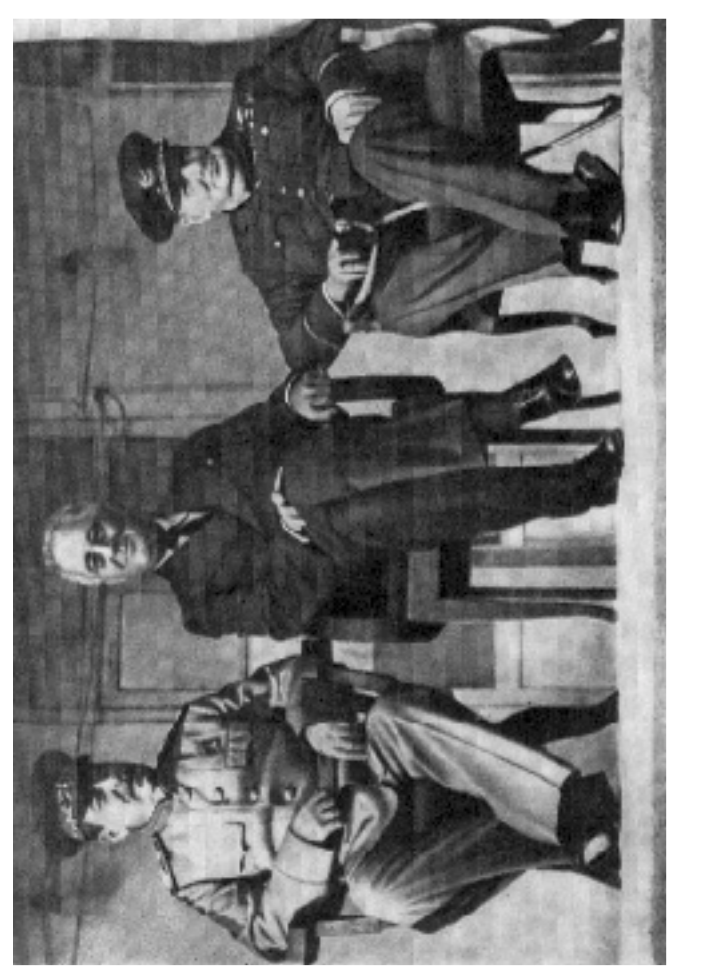
The leaders of the three powers at the Tehran Conference