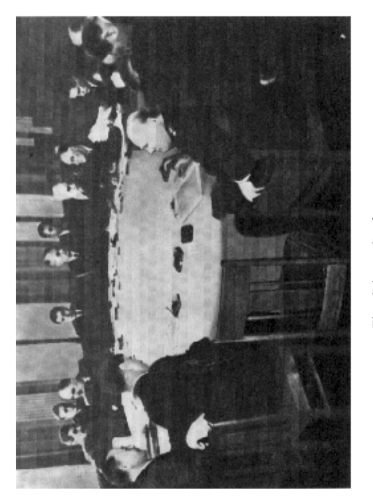
The Crimea Conference Plenary session