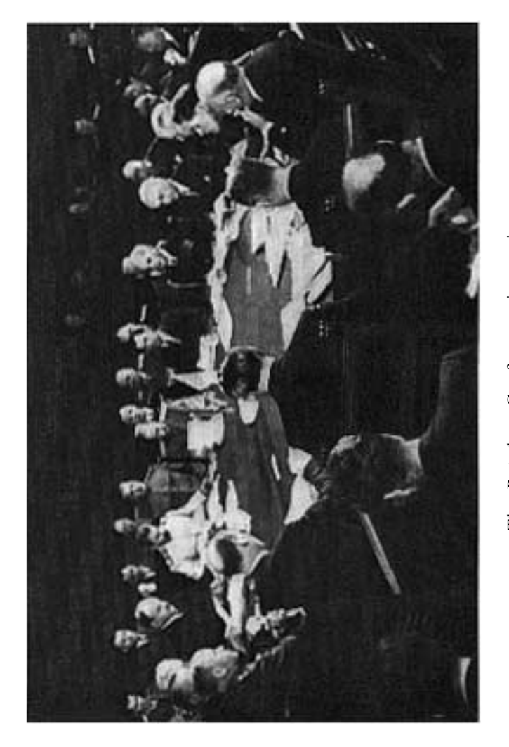
The Potsdam Conference in session