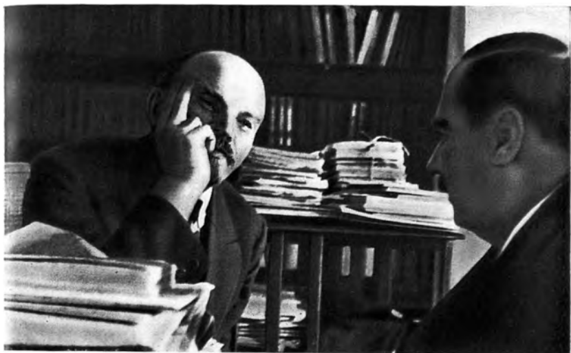
Lenin in conversation with Herbert G. Wells at the Kremlin. Photo, October 1920.