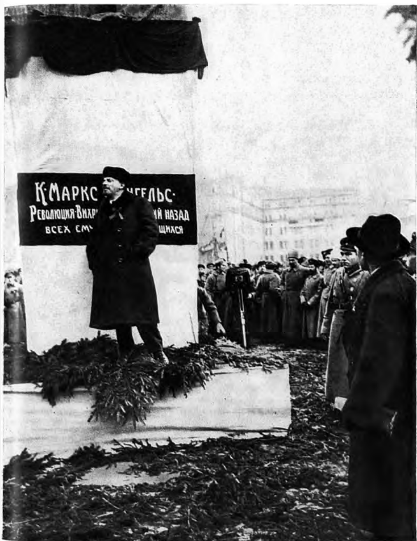
Lenin delivers a speech at the unveiling of a temporary monument to Marx and Engels on Revolution Square. Photo, November 7, 1918.