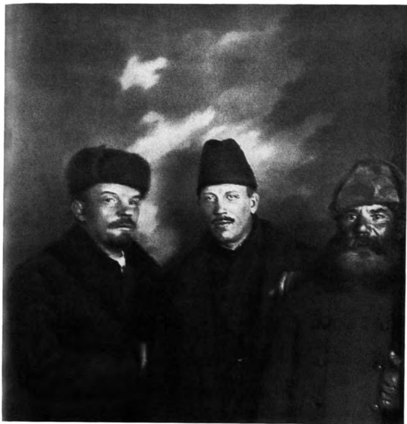
Lenin, Demyan Bedny and F. Panfilov, delegate to the Congress of the Russian Communist Party (Bolsheviks), during the Congress. Photo, 1919.