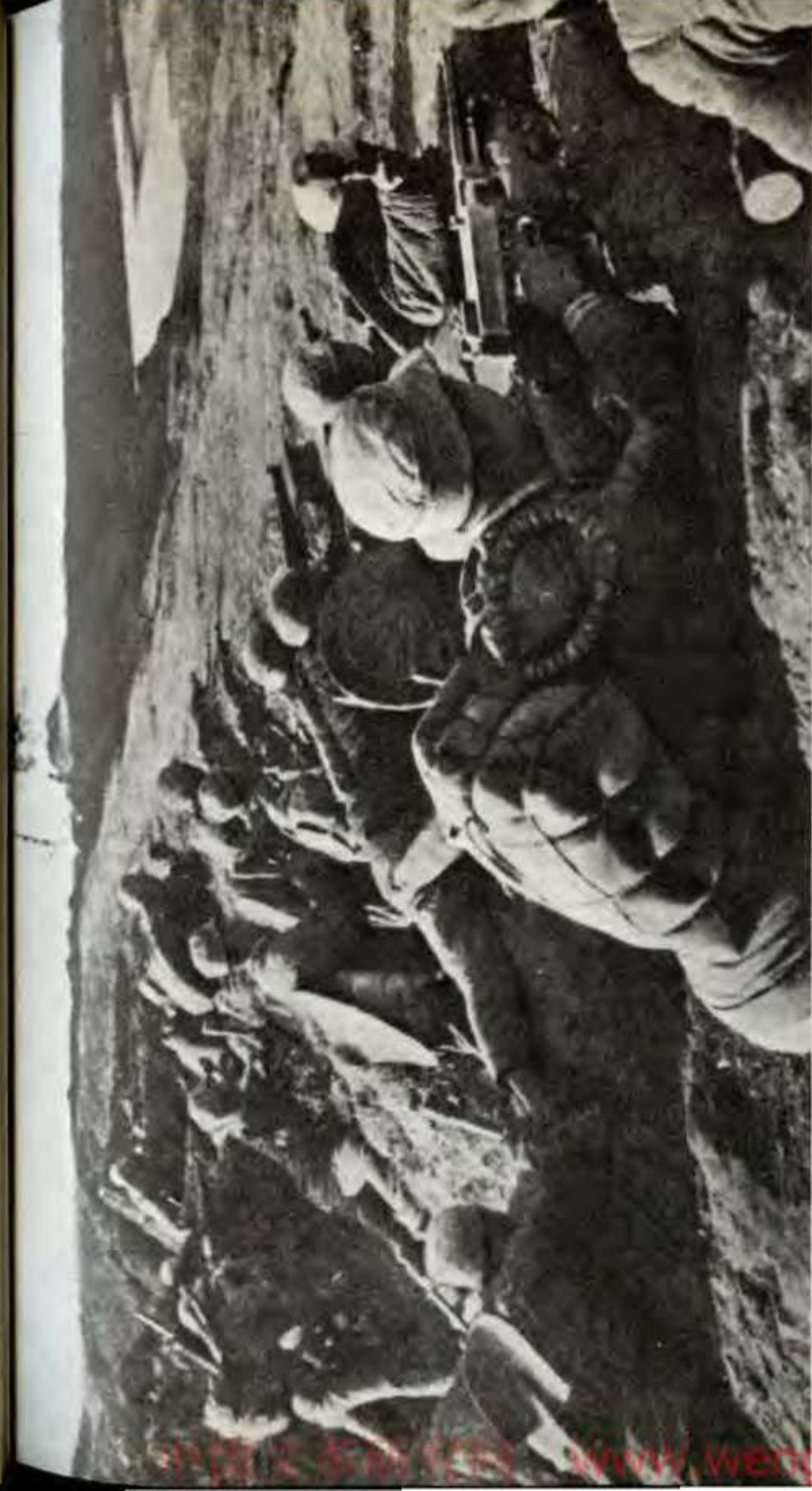
A unit of the New Fourth Army, led by the Chinese Communist Party, intercepts a column of Japanese invaders during the anti-Japanese war (1937-1945), which was a substage in the new-democratic stage of the Chinese revolution.

After Lenin's death, Stalin not only led in building socialism in the Soviet Union, but in giving support to and helping to formulate the line for revolutionary struggles throughout the world, including in the colonial countries, China in particular. In several speeches and articles during the period of the revolutionary up-