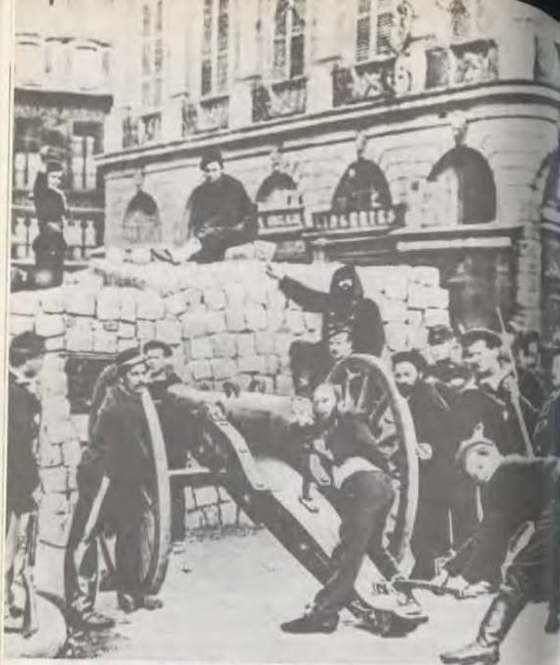
Fighters man the barricades of the Paris Commune, the first dictatorship of the proletariat.

The maxim of socialist society is: from each according to his ability, to each according to his work. This corresponds to the general level of development of production relations that characterizes socialist society (which in turn is ultimately determined by the level of development of the productive forces). This means that, while provision is made for those actually unable to work, etc., and after a certain amount is set aside for accumulation, public services, and so on, generally each person gets back in the way of consumer goods an equivalent to what his labor has contributed. In all socialist societies that have existed, the exchange of labor for consumer goods has taken place so far through the medium of money—that is, workers receive money-wages with which they buy these consumer goods. This is itself a commodity relation and is an aspect of the situation where commodity relations have not been eliminated in society as a whole. To the degree that this is the case the law of value continues to operate (the law