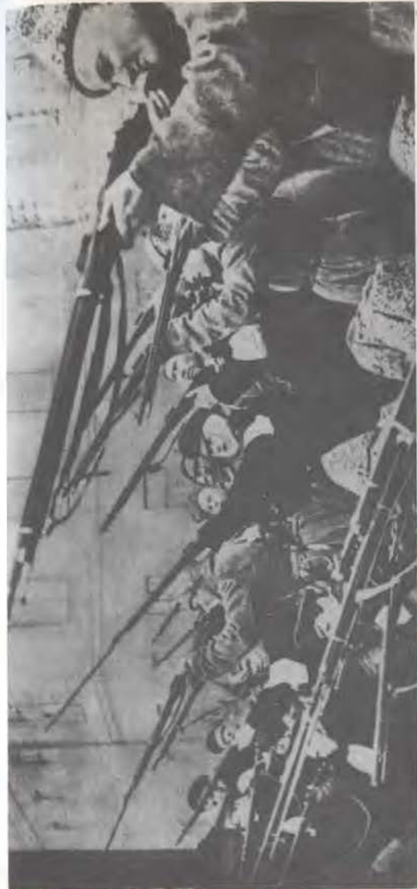
Rebellious Czarist troops in Petrograd turn their rifles around and join the workers in insurrection—an insurrection which led to the working class' taking and holding state power for the first time in history.

This is a profound analysis of some of the basic factors involved in the transition from socialism to communism, and one of its implications would seem to be that this transition period, socialism, will cover a relatively long historical period—for, as Lenin notes here, the economic basis for communism is by no means achieved by the expropriation of the capitalists, but only by the resolution of the contradiction between manual and mental labor. (In saying this Lenin was following Marx and Engels, who had pointed out that the division of labor into mental and manual is the basis for classes.) And it is clear that the overcoming of this contradiction (between mental and manual labor) will take a fairly long historical period.