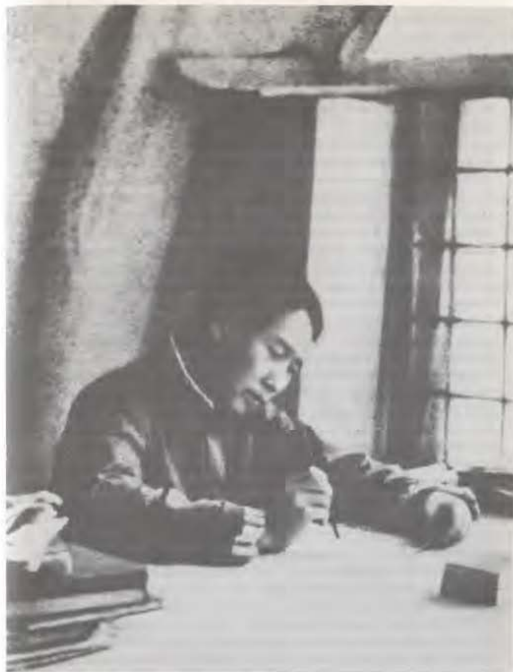
Mao writing in a cave in Yanan, 1938.

In the first chapter of this book (on revolution in colonial countries), it was pointed out that as a crucial part of developing, defending and applying the line of new-democratic revolution, and specifically the policies for the anti-Japanese struggle which constituted a sub-stage within the stage of new democracy, Mao took up the struggle in the philosophical realm. This struggle was particularly aimed against dogmatic (and secondarily empiricist) tendencies which reflected idealist and metaphysical thinking in opposition to materialist dialectics. Mao's criticism of this was embodied especially in "On Practice" and "On Contradiction," both written in 1937 and constituting two (the first two) of Mao's major philosophical works. In the earlier chapter in this book (referred to just above), while it was pointed out that these works enriched Marxist philosophy, the political significance of these works and their role in the inner-party struggle and the overall revolutionary struggle at that time were stressed. Here attention will be focused on the principles of Marxist philosophy elaborated and enriched by Mao in these works, while also reviewing their relationship to the