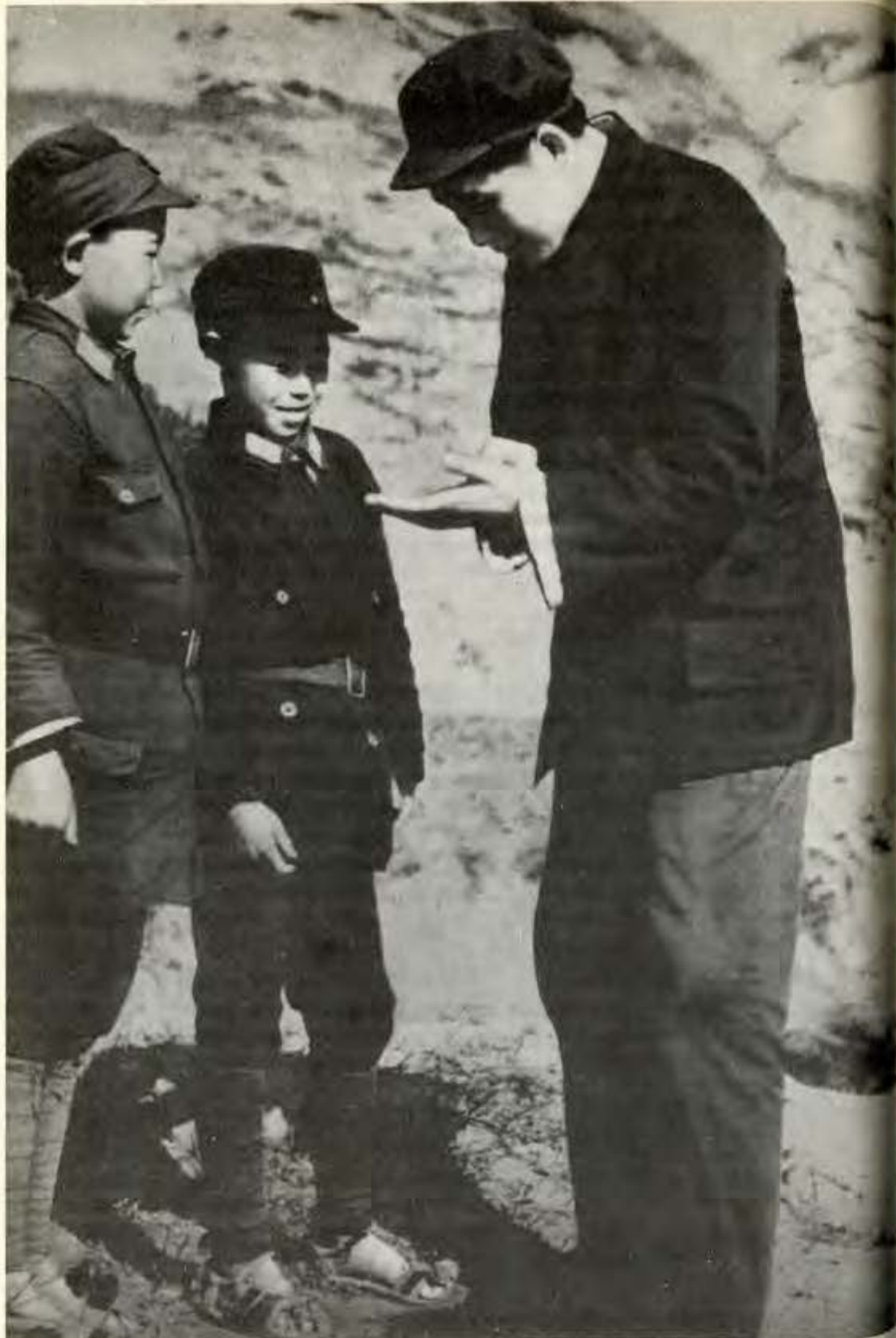
Mao talks with young fighters of the Eighth Route Army in Yenan, 1939.