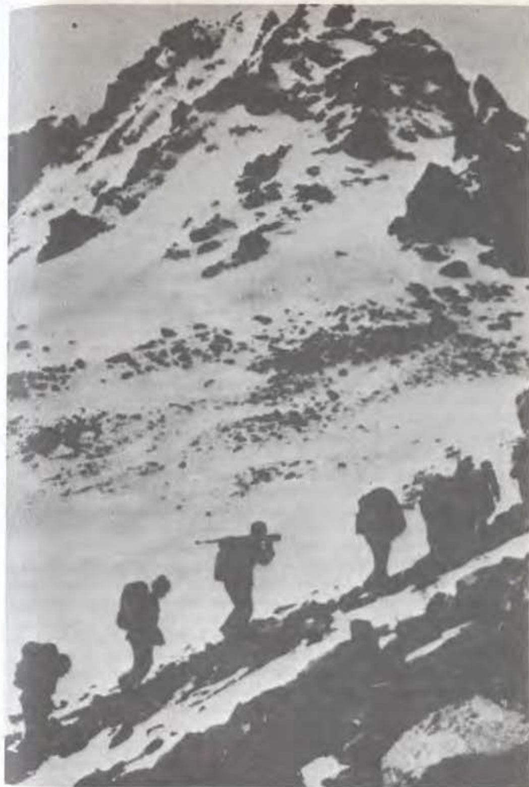
Crossing the Snow Mountains on the Long March.

(SMW, "The Present Situation And Our Tasks," pp. 349-350)