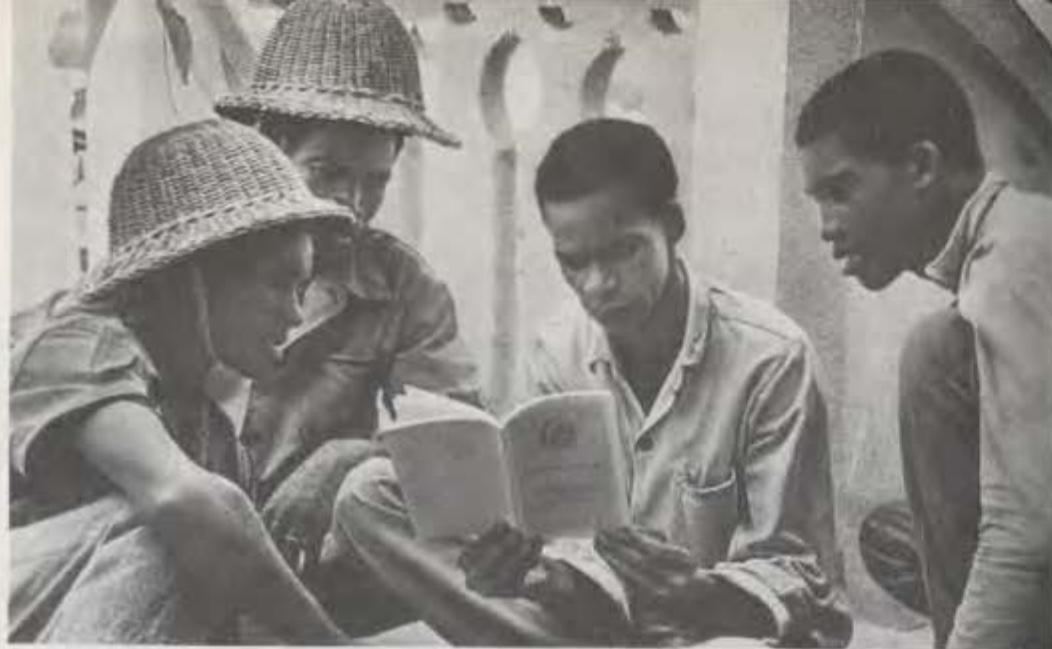
Above, workers in Guinea study Mao's works at a construction site. Below, Japanese workers on top of a street barricade hold up a red banner inscribed with the words "Long Live Mao Tsetung Thought."