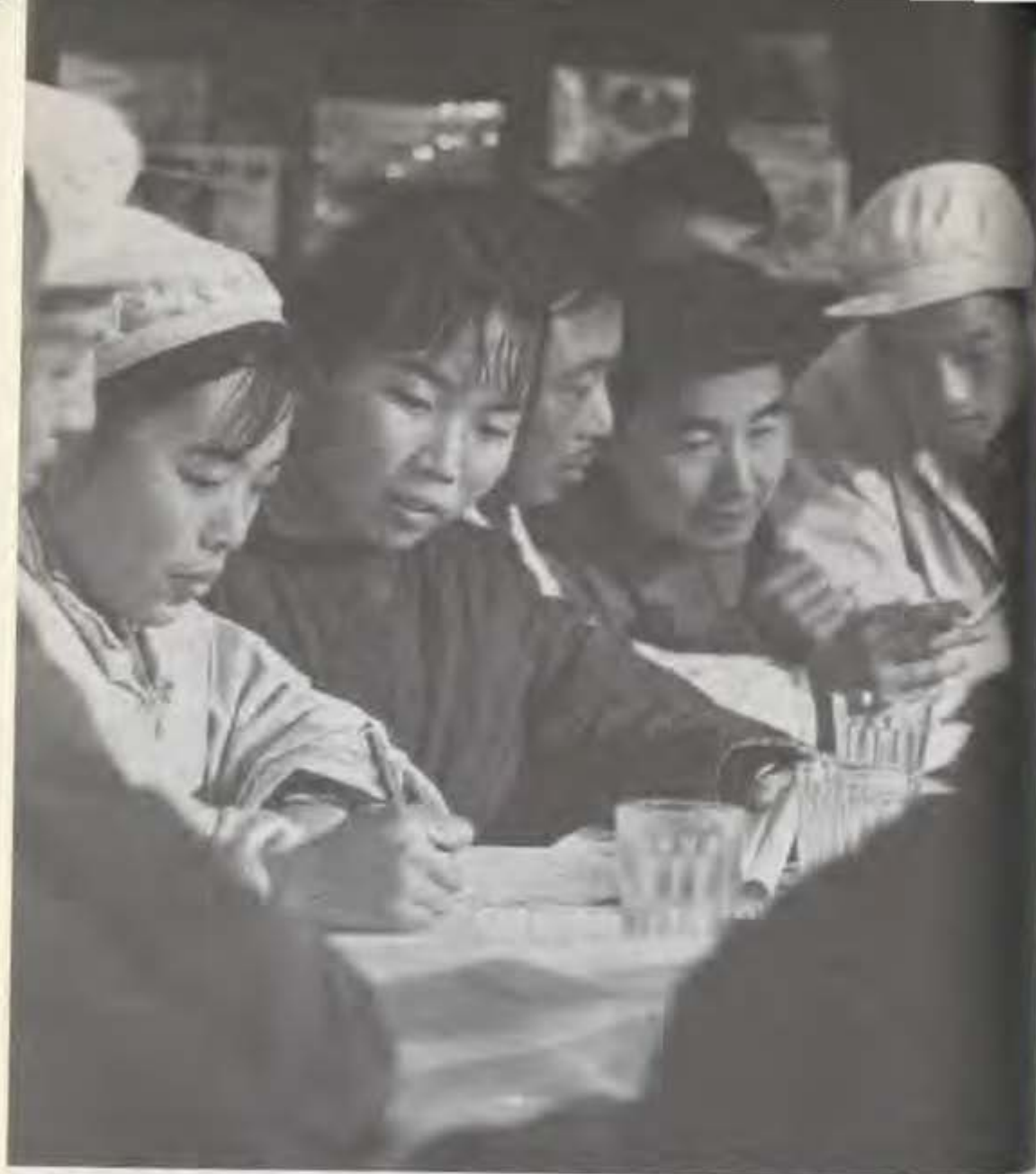
1975—Teachers and students of the international politics department of Fudan University study the current economic crisis in the capitalist world together with worker-theoreticians at a Shanghai bakery. Groups like these were created and spread on a wide scale during the Cultural Revolution.

bourgeoisie under the dictatorship of the proletariat, the proletariat cannot continue to rule and cannot continue the advance to communism.