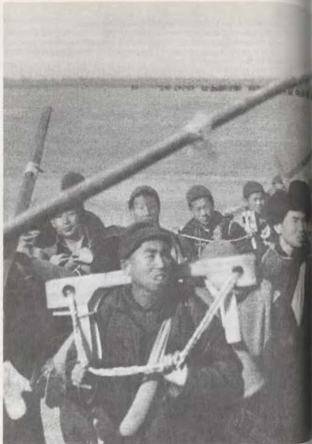
Chinese peasants from the liberated areas mobilize to support the People's Liberation Army in the war for national liberation.