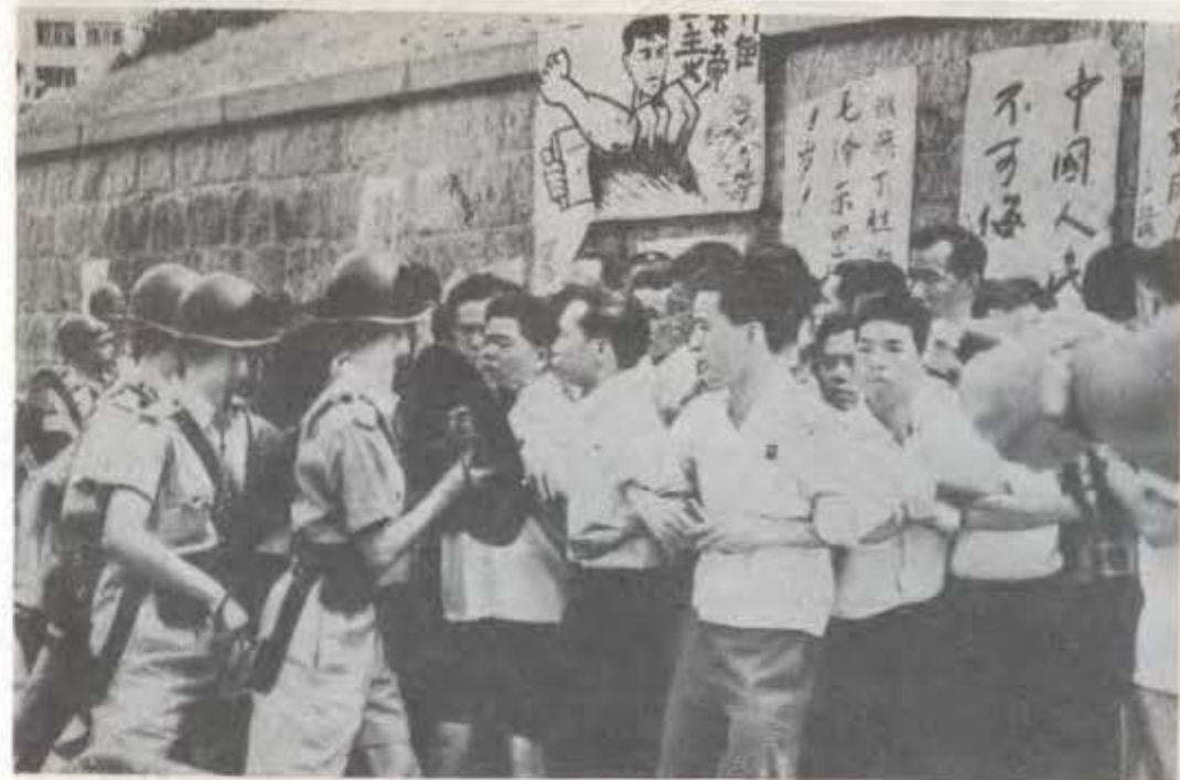
Above, British riot police fail to break up 1967 protest in Hong Kong as demonstrators hold on tightly to their Red Books, Quotations from Chairman Mao Tsetung . Below, scene from January 29, 1979 march outside the White House in Washington, D.C. where 500 revolutionaries led by the Revolutionary Communist Party, USA unfurled Mao's banner in the face of the visit by Chinese revisionist traitor Teng Hsiao-ping.