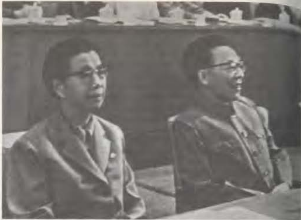
The four top revolutionary leaders overthrown in the October 1976 revisionist coup in China: above, Chiang Ching (left) and Chang Chun-chiao at the rostrum at the Tenth National Congress of the Communist Party of China.