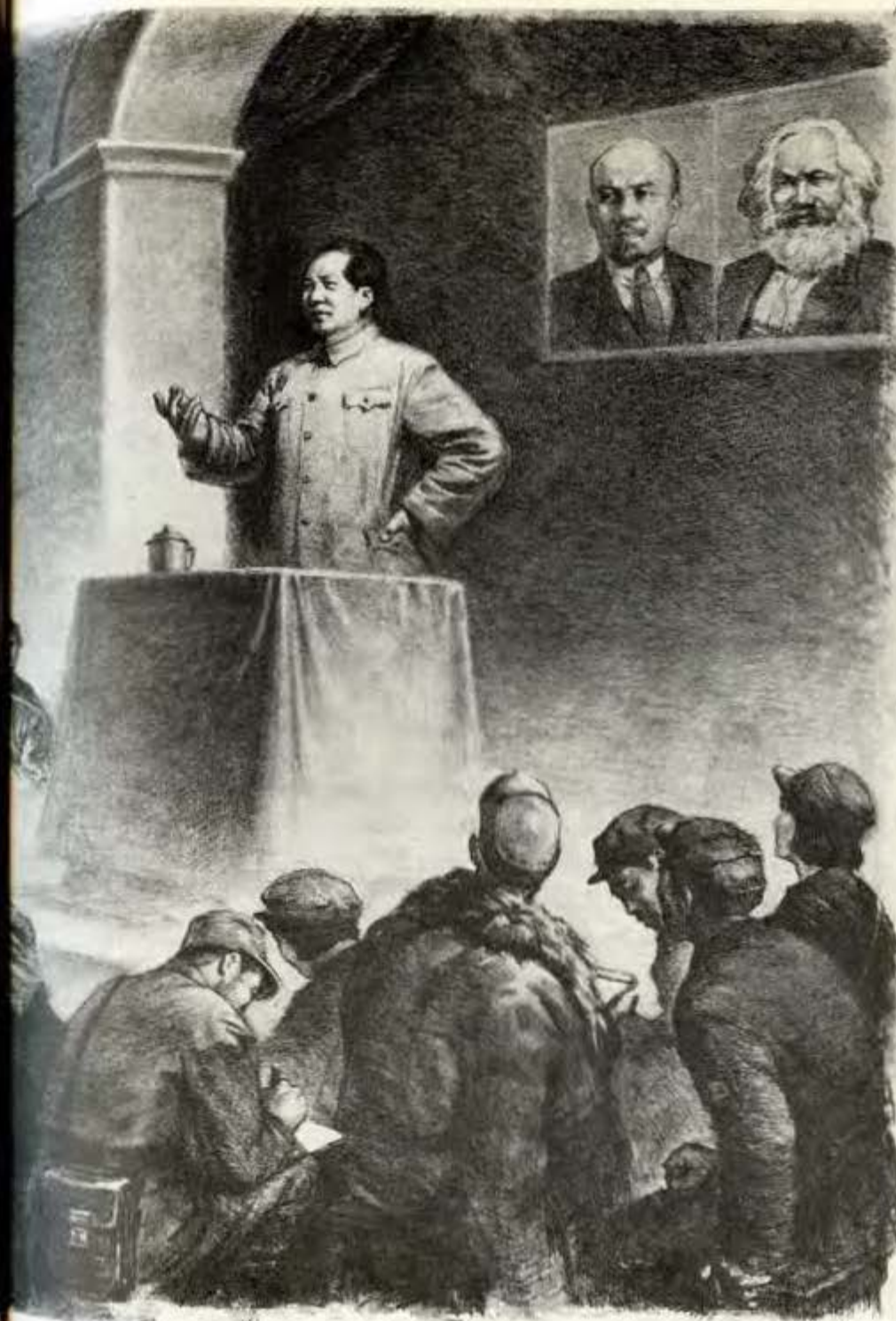
"Chairman Mao Delivering a Report at a Cadre's Meeting in Yanan on Rectifying the Party's Style of Work" (Chinese pencil sketch)