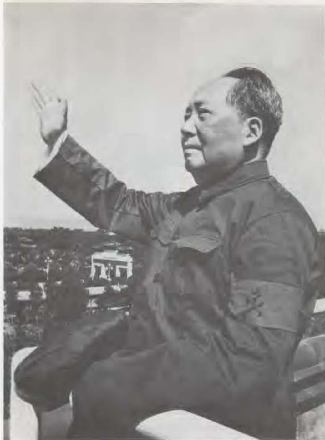
Mao reviewing Red Guards in Tien An Men Square on August 18, 1966, showing his backing for the mighty tide of the Cultural Revolution sweeping the country.

The Center has repeatedly stressed the importance of self-education,