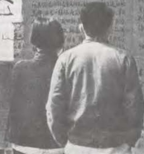
Peking University, May 1966: China's first Marxist-Leninist big character poster. With Mao's support, newspapers and radio across the country carried this poster's call to uphold Mao Tsetung Thought and unite around Mao and the Central Committee, "break