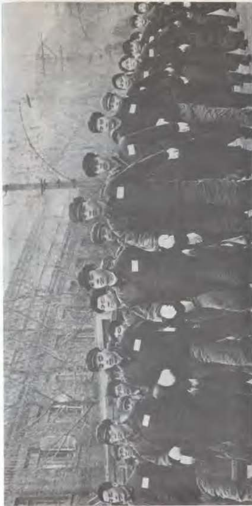
The worker-militia of the Peking No. 1 Machine Tool Plant who came to the defense of Mao's line in suppressing the counter-revolutionary incident in Tien An Men Square instigated by Teng Hsiao-ping in April of 1976.

If the leading cadres do not take part in productive labor together with the masses; if at the same time they increase their income relative to that of the masses, through expanded wage differentials, bonuses proportional to wages, etc.; if they put profit in command; and if they monopolize management and planning while the masses of manual workers are effectively barred from these things rather than being politically activated to take part in them and supervise the leading cadres; then in essence how much different is the relationship between the leading cadres and the working masses from that between the workers and the capitalists in capitalist society? And with regard to the high officials who exercise leadership in the ministries, in finance and trade, etc., if they follow the same revisionist line, divorce themselves from the masses and productive labor and effectively monopolize control