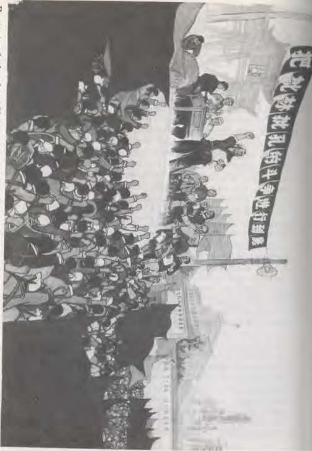
Peasant painting from Hubsien County in Shensi Province, "Condemning Confucius at His Temple Gate."

It is on this point in particular that Mao's contribution in the sphere of culture is centered, representing a further advance beyond the previous theory and practice of Marxism and the proletariat in this sphere. And it was exactly under the leadership of Mao's revolutionary line that the Chinese people created works of