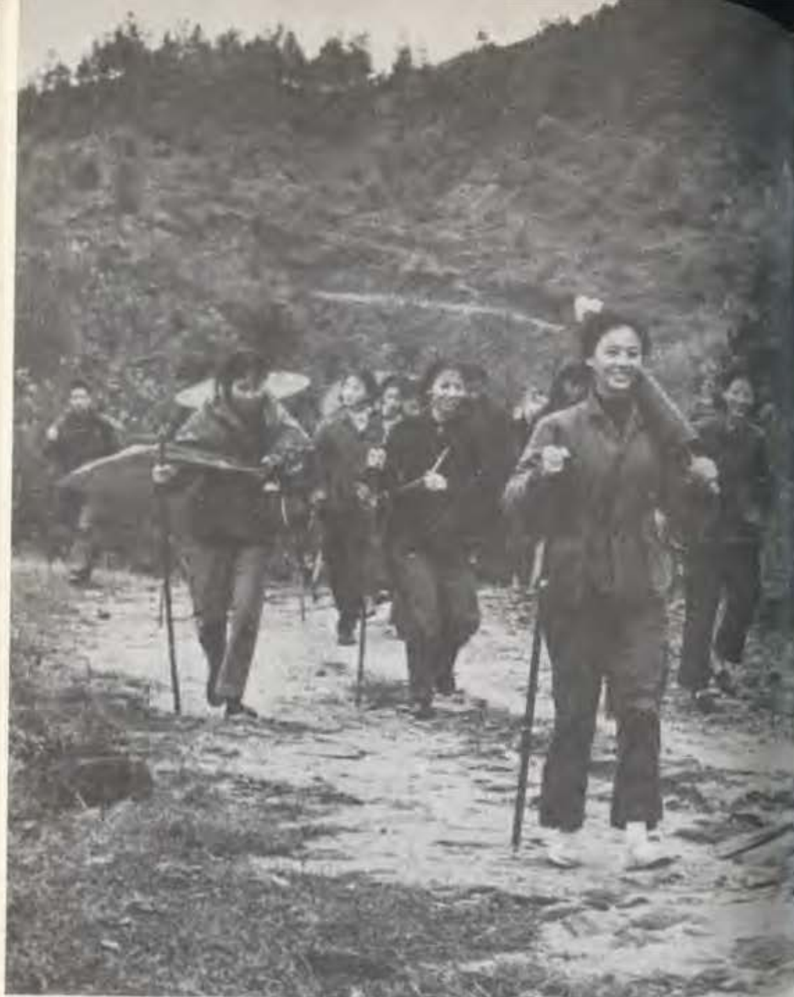
Members of the White-Haired Girl dance troupe travel along rugged mountain paths to Wengniu Village in Kwangsi, where they will live, work and study with the masses as well as perform for them. Tours like this across China, including to remote areas far removed from the cities, historically the centers of culture, enabled cultural workers to get to know the lives and the feelings of the masses, so as to be able to produce revolutionary culture in the service of proletarian revolution.

of Mao's closest comrades, the leaders of the forces of the Chinese proletariat who are now vilified as the "gang of four." Revisionism triumphed, for the moment, in China.