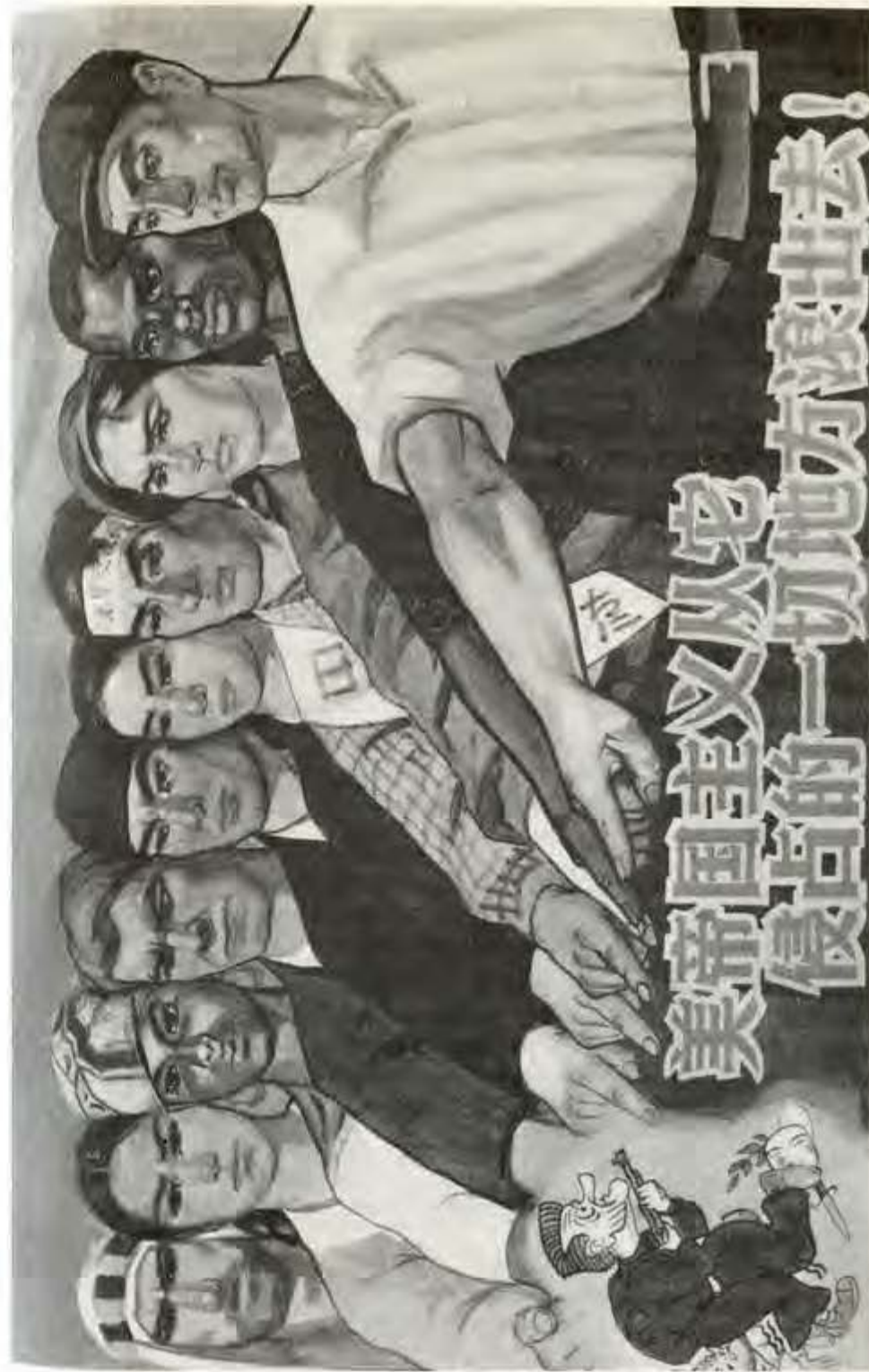
"U.S. imperialism must get out of all the places it has occupied!" (Chinese poster)

This did not mean, of course, that China did not support countries in Asia, Africa and Latin America, even those under the leadership of types like Nehru and others, in resisting imperialist domination. China assisted them in this resistance in many ways and encouraged them to strengthen such resistance. But the point being stressed was that such resistance could not substitute for nor certainly be raised above the revolutionary struggle of the masses and the need for the proletariat and its Communist Party to lead the national liberation movement to complete victory and