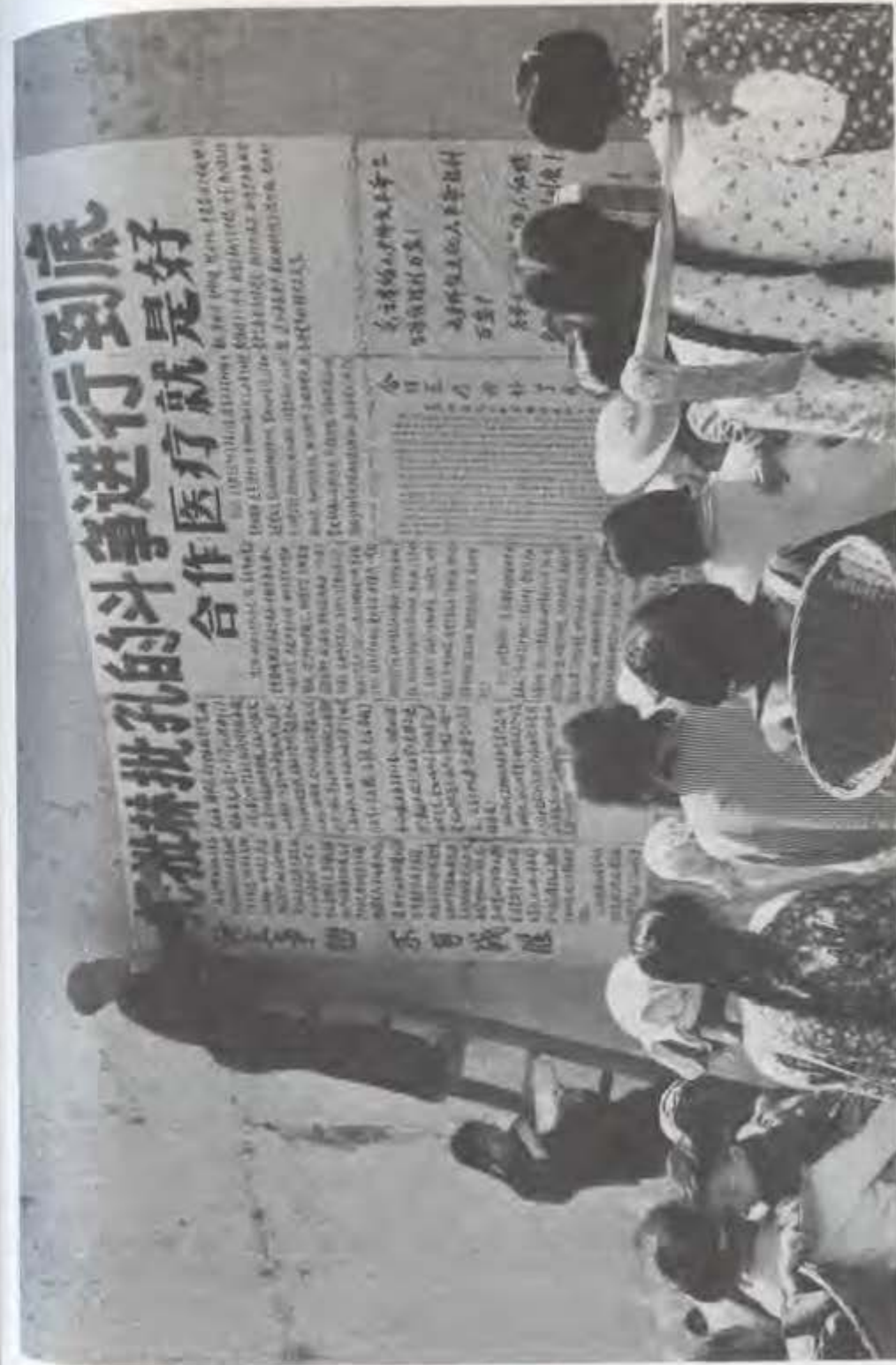
In the movement to criticize Lin Piao and Confucius, the poor and lower-middle peasants and barefoot doctors of Yunnan Province wrote big character posters to praise the cooperative medical service and denounce Lin

Apparently, we couldn't do without the Great Proletarian Cultural Revolution, for our base was not solid. From my observations, I am afraid that in a fairly large majority of factories—I don't mean all or the overwhelming majority—leadership was not in the hands of real Marxists and the masses of workers. Not that there were no good people in the leadership of the factories. There were. There were good people among the