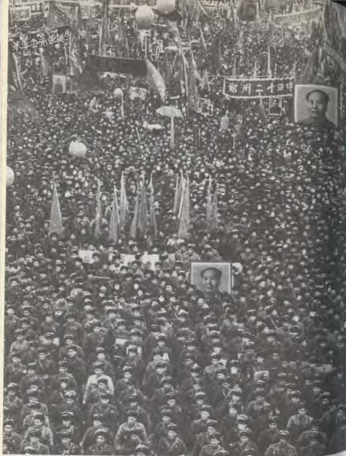
The celebration of the founding of the Honan Province Revolutionary Committee in Chengchow. Mao hailed and gave great importance to these new organs of power of the Great Proletarian Cultural Revolution for defending and continuing the revolution under the dictatorship of the proletariat.

supervision the leading cadres in general, then through the force of habit and the conscious action of revisionist high officials the Party would become an instrument of the bourgeoisie and society would be taken "peacefully" down the capitalist road under its leadership.