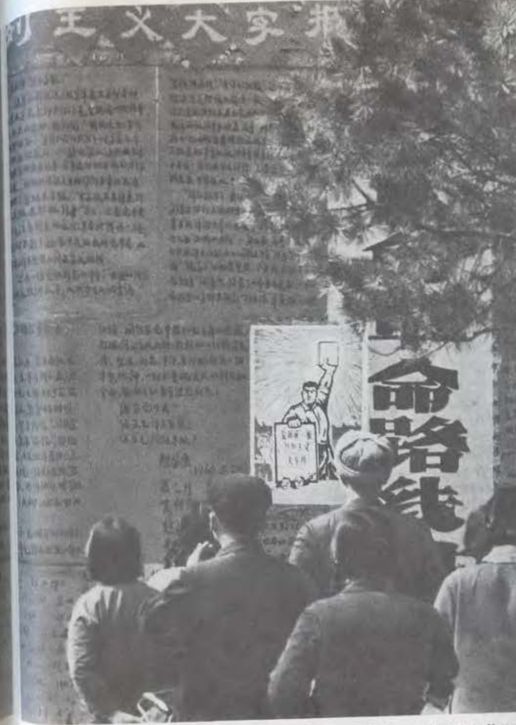
down all the various controls and plots of the revisionists," and "wipe out all ghosts and monsters and all Khrushchev-type counter-revolutionary revisionists, and carry the socialist revolution through to the end."