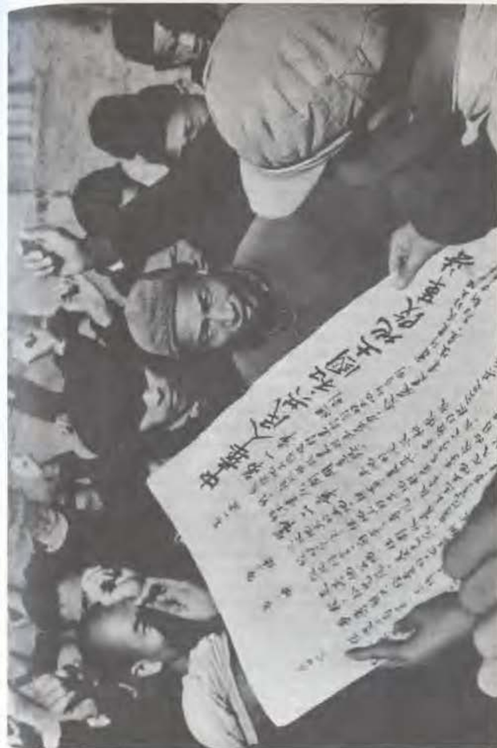
The proclamation of the "Land Reform Law of the People's Republic of China," shortly after liberation, which

Of course, as pointed out, during the period of transition to socialist ownership in China private capital was allowed to play a