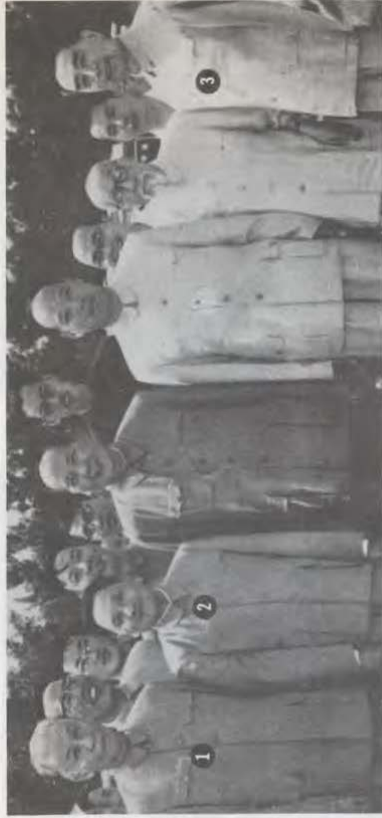
Mao's line was opposed at every turn by leading Party members who stepped forward to defend the bourgeoisie and fight the revolution, and especially by those who joined the revolution during its democratic stage but opposed continuing it under socialism. However, because Mao relied on the masses and their revolutionary aspirations, and guided them again and again in resolute struggle for their own liberation and the liberation of all mankind, he was able to lead the masses of people in successful battles against these reactionaries. In this way the proletariat's transformation of society advanced to greater heights. In this 1963 photo Mao (in middle) is surrounded by some long-time Party leaders, including three internationally prominent capitalist-roaders: 1) President Liu Shao-chi, 2) Party Secretary Teng Hsiao-ping, and 3) Premier Chou En-lai.

It is this which infuses all of Mao's work and his truly immortal contributions. And it is this, most of all, which all those who are determined to make revolution and aspire to the lofty goal of communism can and must learn from Mao Tsetung.