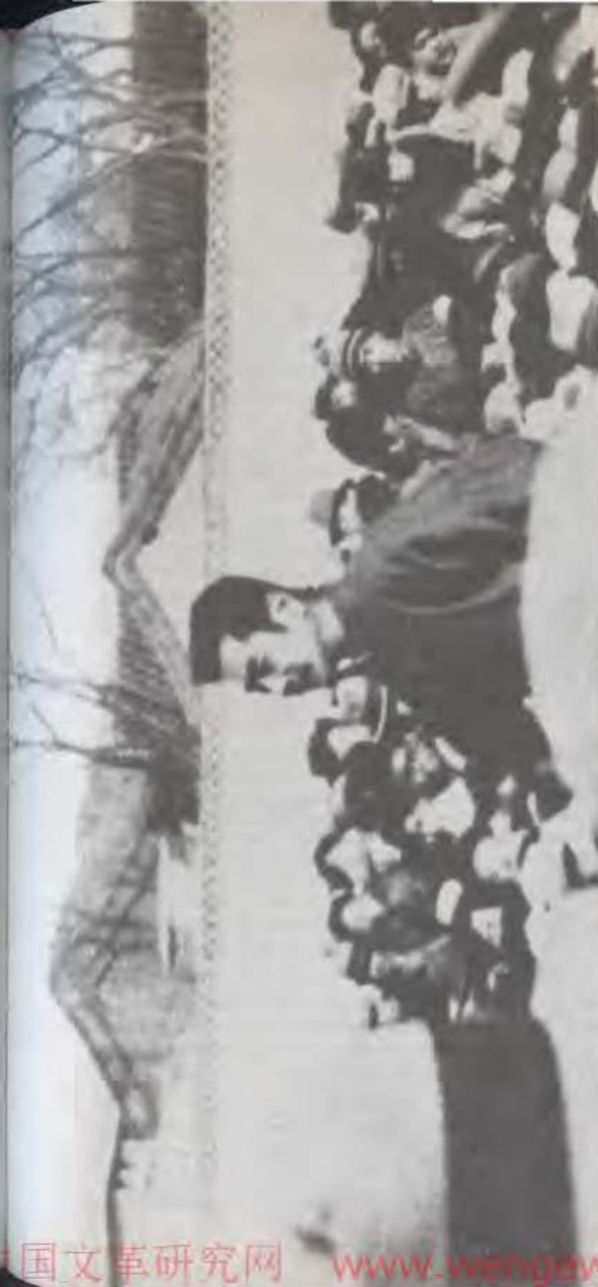
Lu Hsun, a revolutionary writer who came forward during the anti-imperialist upsurge in China, took up the communist outlook and stood squarely with the proletariat and the masses. He fought for the line that all literature and art must serve the masses' revolutionary cause. Here he gives a lecture at Peking Teachers' University in 1932, struggling against an opportunist line in the Party at that time. "All Communists, all revolutionaries, all revolutionary literary and art workers, should learn from the example of Lu Hsun," declared Mao Tsetung at the 1942 Yenan forum.

Despite the claims that such a stand is "objective," in fact it is not. Making proletarian revolution must be a very conscious struggle, and it means a complete exposure and rejection of all the traditional ideas, of all the forces of habit, of all the usual, accepted, natural ways of doing things. And to be "even-handed" in this situation means objectively to serve the capitalist class, which has