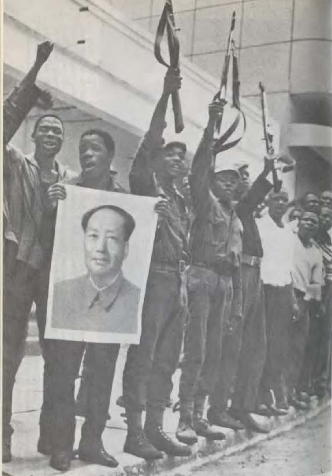
Congolese youth upholding Mao Tsetung.