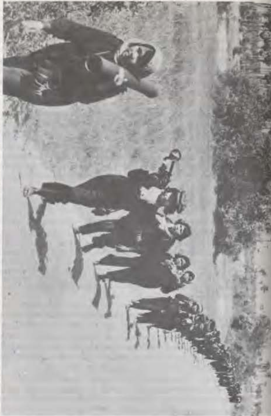
A women's detachment of the Cambodian liberation forces marching to the front during the war against U.S. imperialism.

Down to the very end Mao Tsetung not only continued to champion and support revolution in China but also the revolutionary struggles of the peoples of the world. And it can be clearly seen