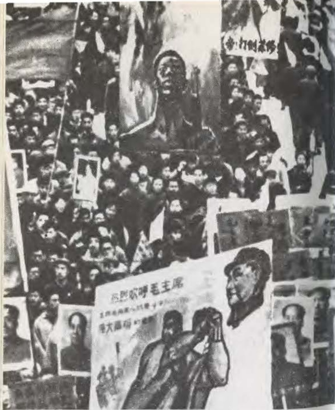
1968 Chinese demonstration of a million people in support of the Black people's struggle in the U.S. Mao stressed that the advance of the dictatorship of the proletariat in China was inseparably linked to the development of the world proletarian revolution. In his famous statement "In Support of the Afro-American Struggle Against Violent Repression," Mao called it "a new clarion call to all the exploited and oppressed people of the United States to fight against the barbarous rule of the monopoly capitalist class."

over these spheres, how much different are they than executives of big corporations and banks in the capitalist countries?