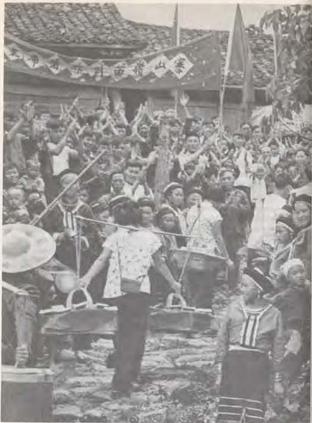
During the Cultural Revolution Mao's works, as well as Marxist-Leninist classics, were first printed and distributed on a large scale in the main language in China and many minority languages. Here, distributors carrying these books across mountains are greeted by the Miao people in Kweichow County, Kweichow Province.

on a guiding line, method, plan or policy." 110 Here Mao stressed the tremendous importance of line, policy, etc., which belong to the category of consciousness, and which can be transformed into matter, into revolutionary practice. And in general the dialectical relationship between consciousness and matter, the identity between them and therefore the possibility of the one being transformed into the other—this is an extremely important principle of Marxism-Leninism and was a focus of fierce struggle in the Chinese Communist Party, especially from the time of the Great Leap Forward.