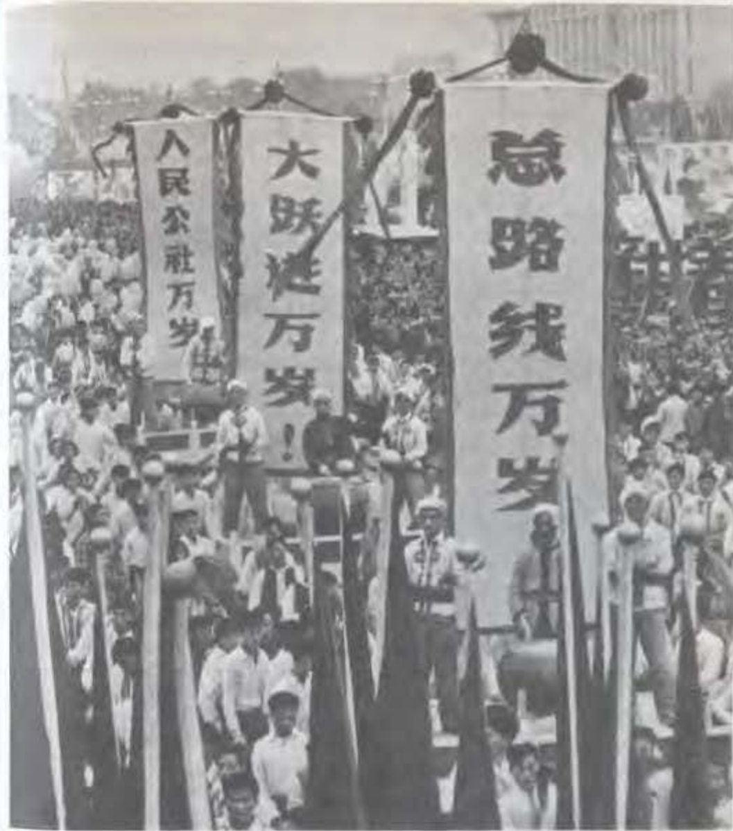
Demonstrators hold high the three red banners: The general line, the Great Leap Forward and the People's Communes. These three were the cutting edge of Mao's revolutionary line on socialist construction in the late 1950s, which took shape in struggle with the revisionist line of Peng Teh-huai and others.

“The chaos caused was on a grand scale and I take responsibility,” he said, throwing down the gauntlet to the rightists. He reminded them of what Marx's outlook had been on the Paris Commune. Marx did not take the standpoint that narrow and immediate results determine everything but reckoned from the view-