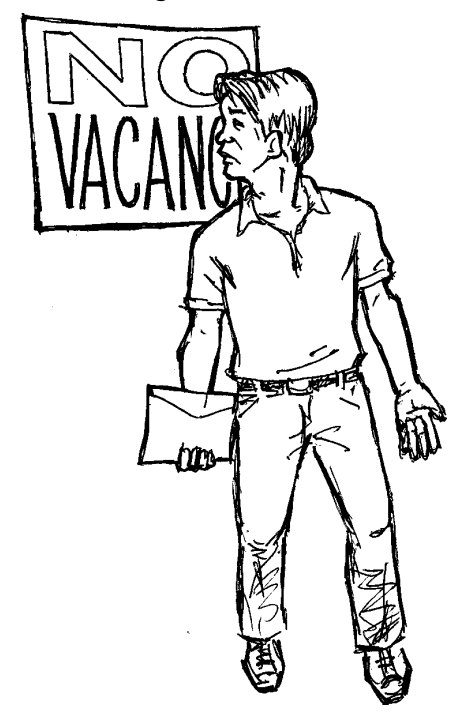
ANG BAYAN October 21, 2010

underdeveloped countries where wages are low. Most of those employed in this sector are either college graduates or dropouts who get hired for their proficiency in English regardless of the courses they took in college.