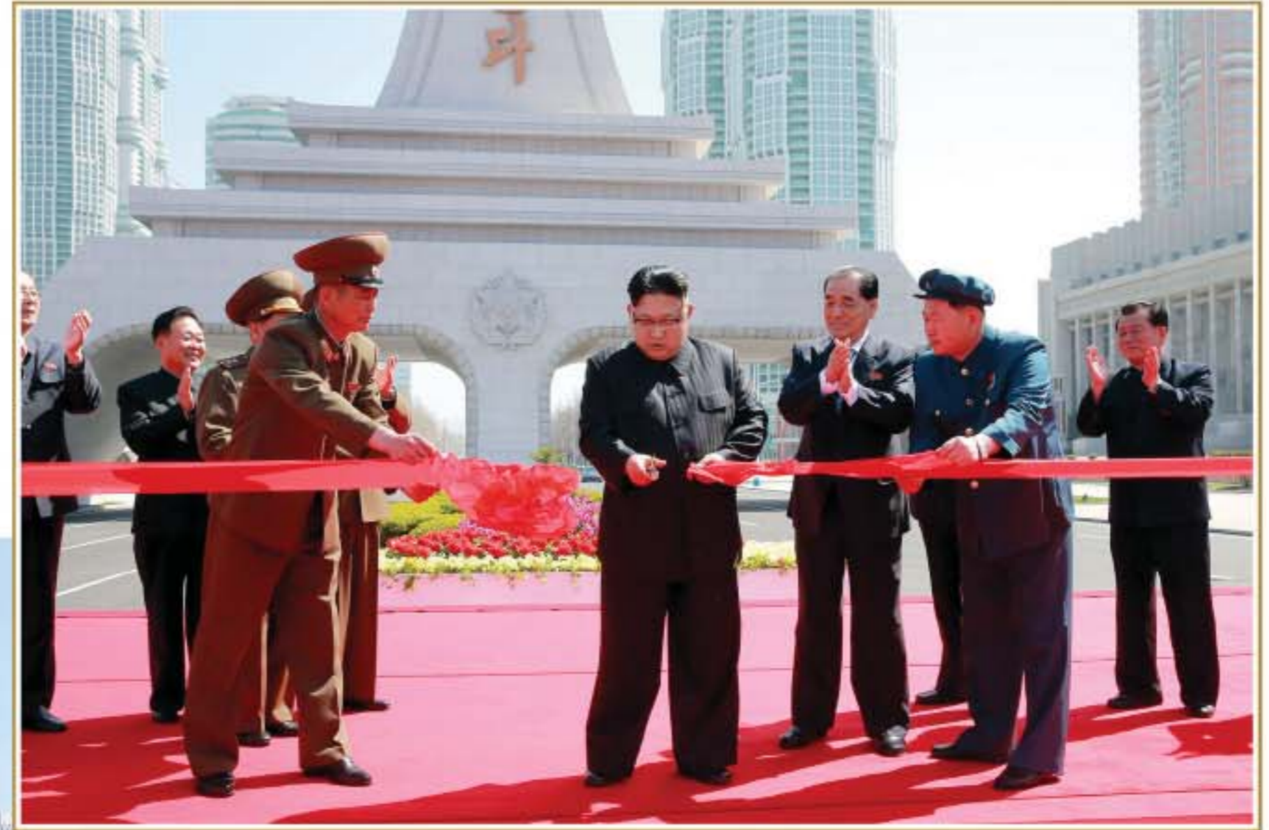
The respected Supreme Leader Kim Jong Un cuts the tape to inaugurate Ryomyong Street [April Juche 106 (2017)]

When Supreme Leader Kim Jong Un cut the tape to inaugurate the new street amid the playing of welcome music, the participants raised cheers, rending heaven and earth, and thousands of colourful balloons soared into the