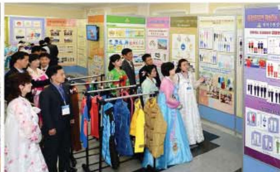
A national industrial design exhibition held to mark the Day of the Sun.