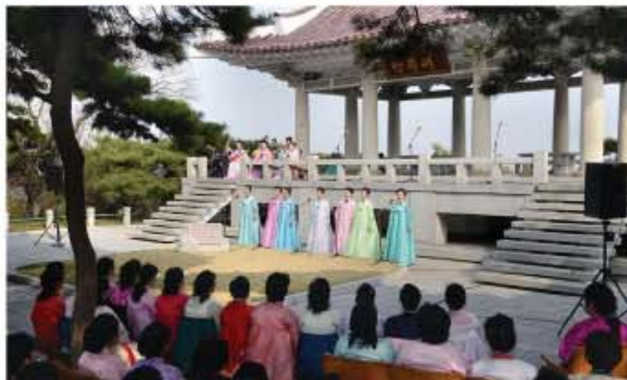
Poem recital and singing event Song of Mangyongdae given by officials and members of the women's union.