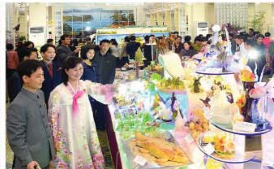
The second sweets sculpture exhibition.