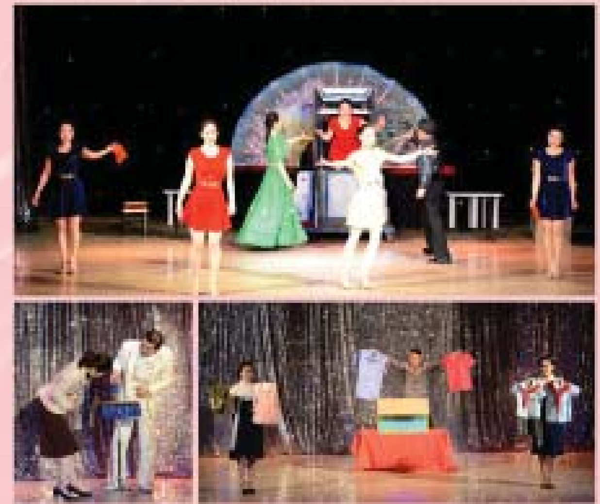
Performance of the art troupes, art squads and amateur magicians.