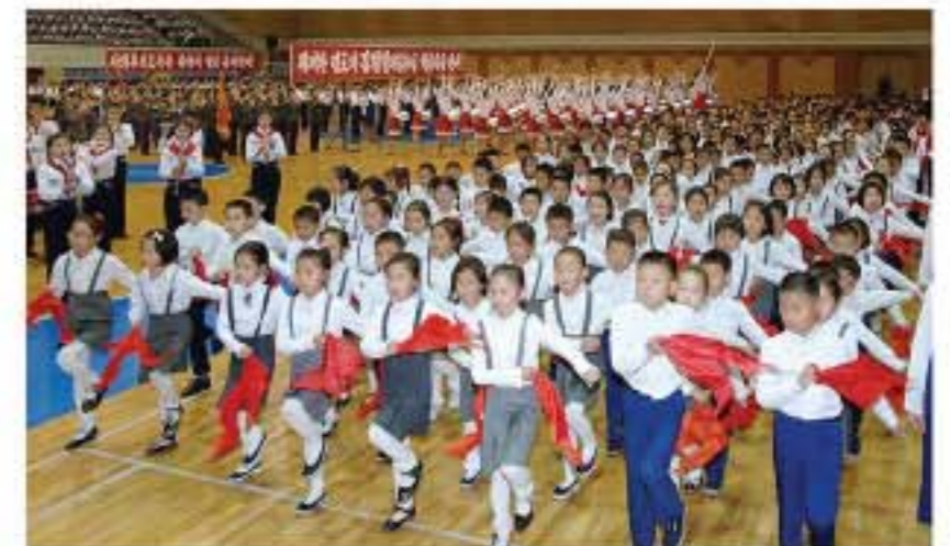
A joint national meeting of the Korean Children's Union organizations.