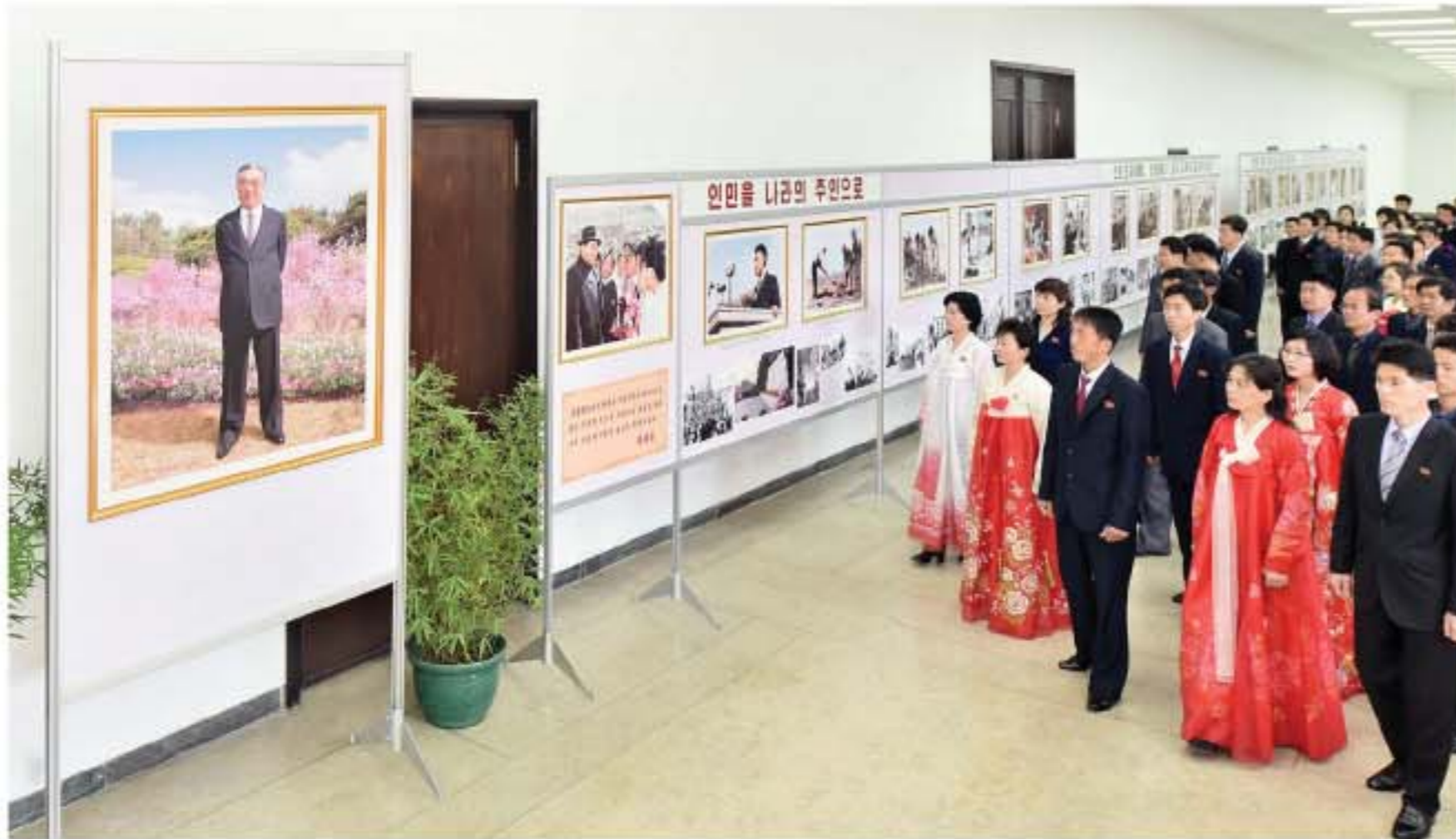
A national photo exhibition in celebration of the 105th birth anniversary of President Kim Il Sung.