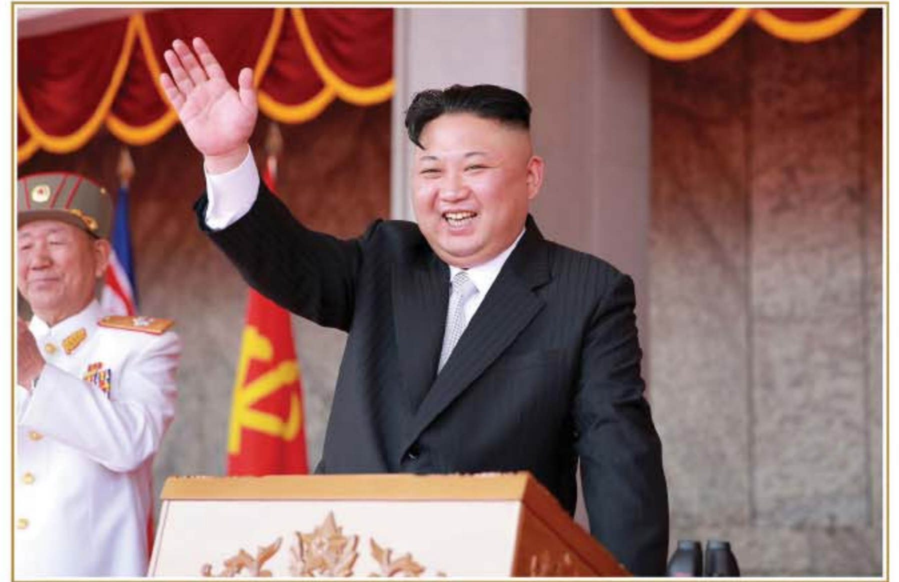
Supreme Leader Kim Jong Un warmly acknowledges the cheering crowds [April Juche 106 (2017)]

demonstrating its might as a nuclear power in the East, a rocket power in Asia, possessed of nukes and nuclear strike means that are miniaturized, precise and varied.