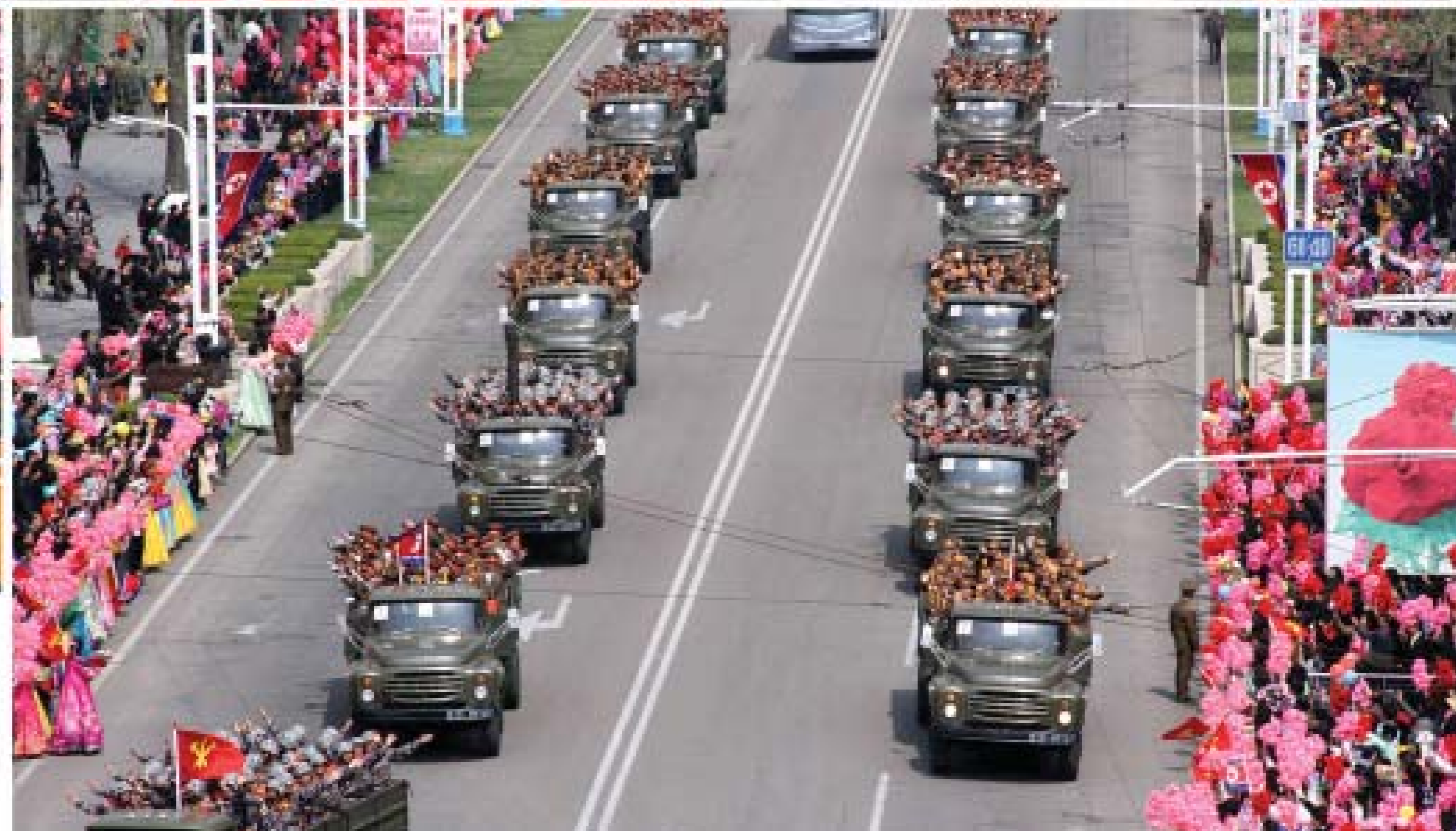
Pyongyang citizens give enthusiastic welcome to the participants in the military parade passing through the streets.