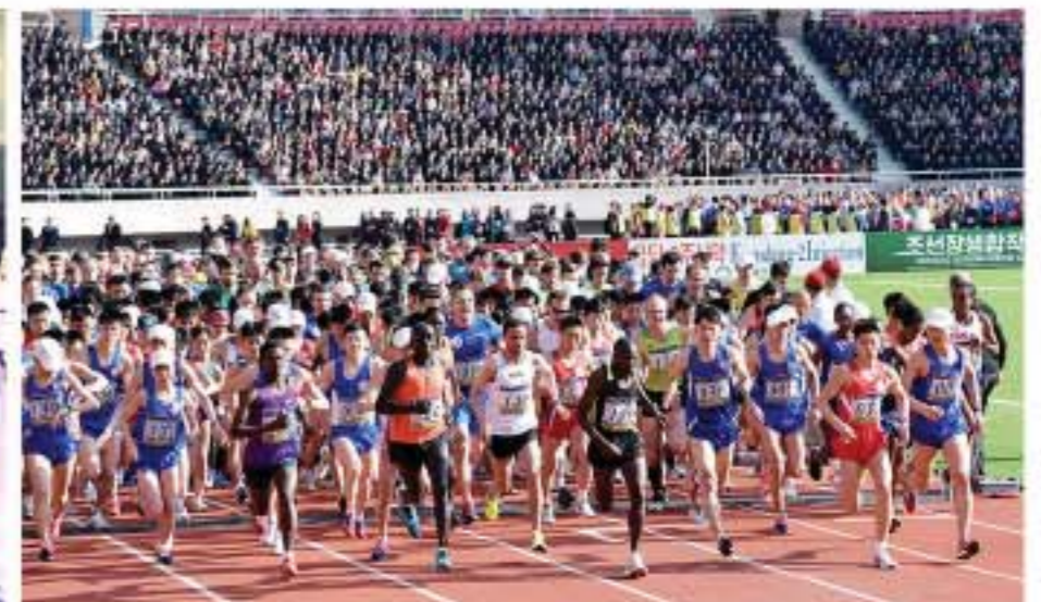
The 28th Mangyongdae Prize International Marathon.