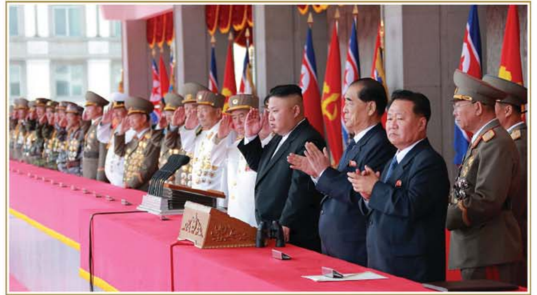
Supreme Leader Kim Jong Un salutes the military columns [April Juche 106 (2017)]

Amid the playing of welcome music, Supreme Leader Kim Jong Un appeared on the