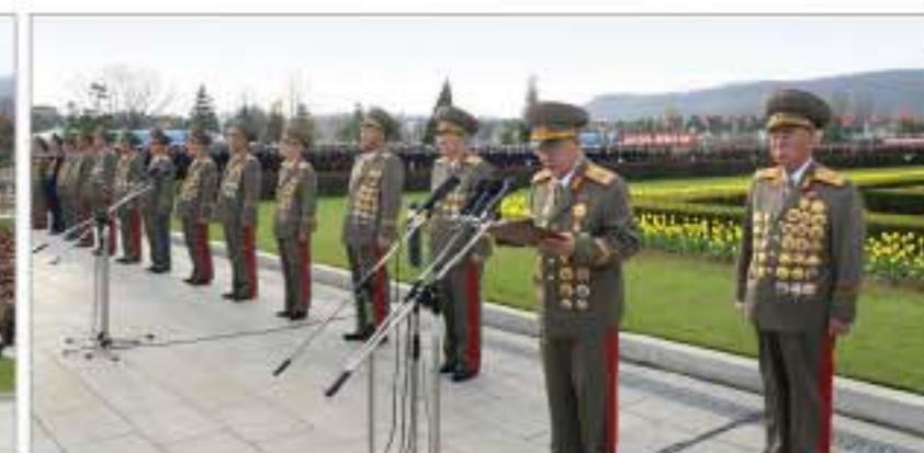
The KPA service personnel pay their highest tribute to Generalissimos Kim Il Sung and Kim Jong Il and firmly pledge to perform their mission and duty as the main force and standard-bearers of the Songun revolution in hastening the final victory of the cause of the Juche revolution following Supreme Commander Kim Jong Un.