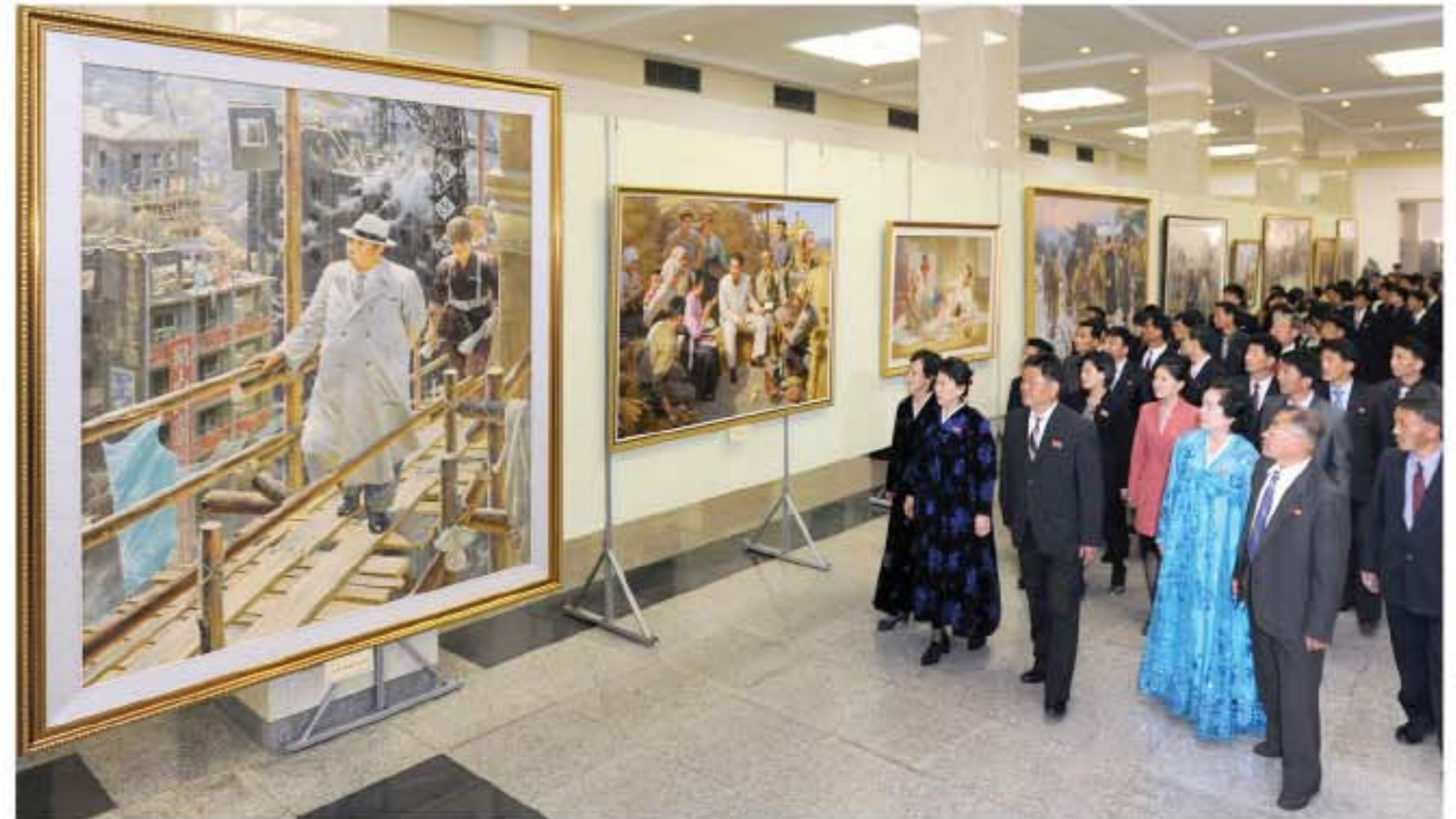
A national fine art show in celebration of the 105th birth anniversary of President Kim Il Sung.