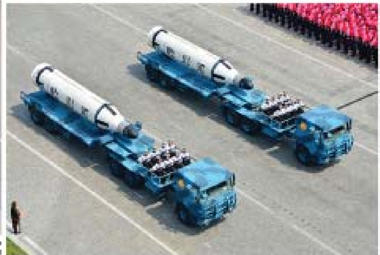
Nuclear weapons and strike means which are small, precise and varied fully demonstrate the unyielding spirit of the Korean People's Army to annihilate at a stroke on the ground, in the air, at sea and even under the sea, and reduce to ashes the enemy's strongholds of aggression and provocations if they dare violate national sovereignty and the right to existence of the DPRK.

He referred to the large-scale military parade and public procession as a proud report of loyalty the descendants of Kim Il Sung and the soldiers and disciples of Kim Jong Il present to the great leaders while carrying on their sacred revolutionary cause without an inch of deflection. He also stressed that no force in the world can check the grand advance of Juche Korea invariably rushing straight forward along the road of independence, Songun and socialism and that a country of socialism, an ideal society for the people, would be built on this land.