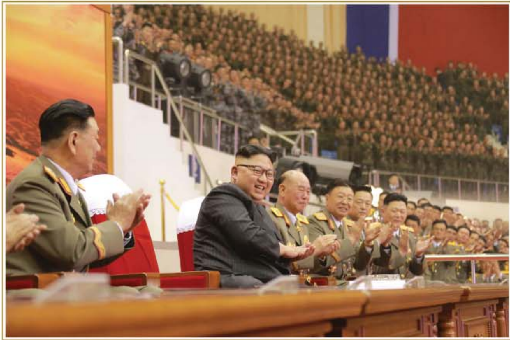
Supreme Leader Kim Jong Un enjoys the performance of the State Merited Chorus given in honour of the participants in the military parade held to celebrate the 105th birth anniversary of President Kim Il Sung [April Juche 106(2017)]

The State Merited Chorus, winner of Kim Il Sung Prize, gave a congratulatory performance on April 16 in honour of the participants in the military parade held to mark the 105th anniversary of the birth of President Kim Il Sung.