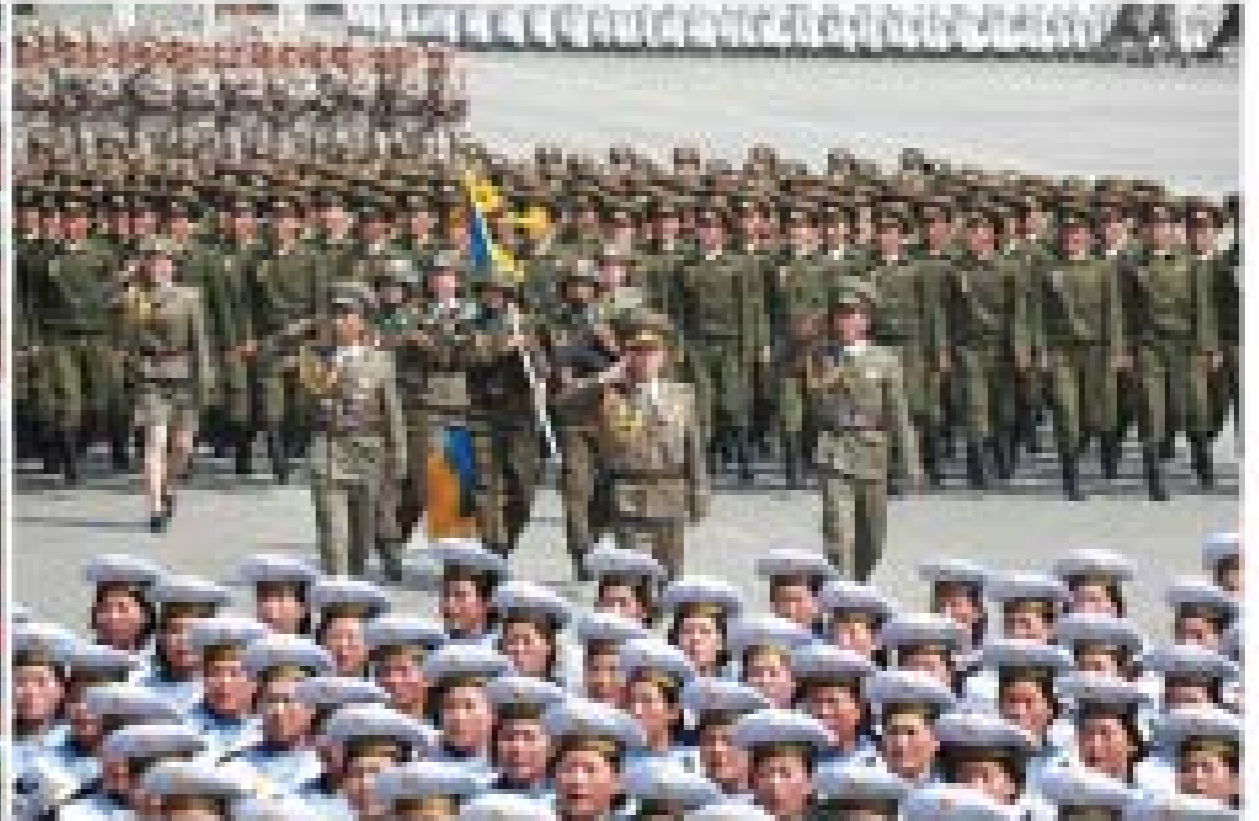
Columns of the KPA ground, naval, air and anti-aircraft, strategic forces and special operations corps, large combined units and infantry divisions at the first echelon of frontline army corps, and military schools at all levels, march in fine array, flying high the colours permeated with proud feats performed in national defence and anti-imperialist, anti-US showdowns.