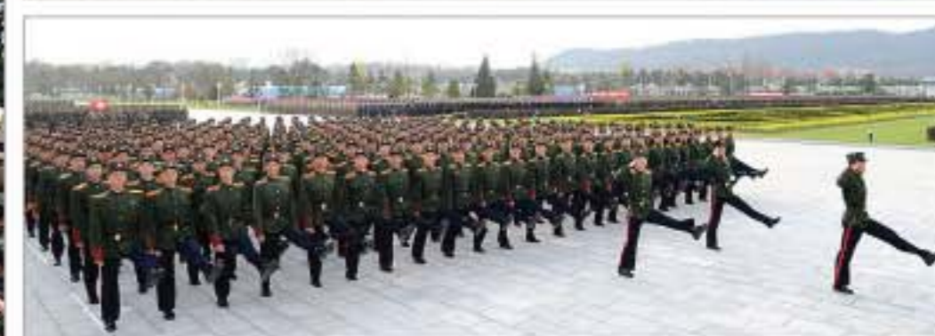
A march-past of service members of the ground, naval and air and anti-aircraft forces of the KPA, cadets from military academies at all levels and students from revolutionary schools.