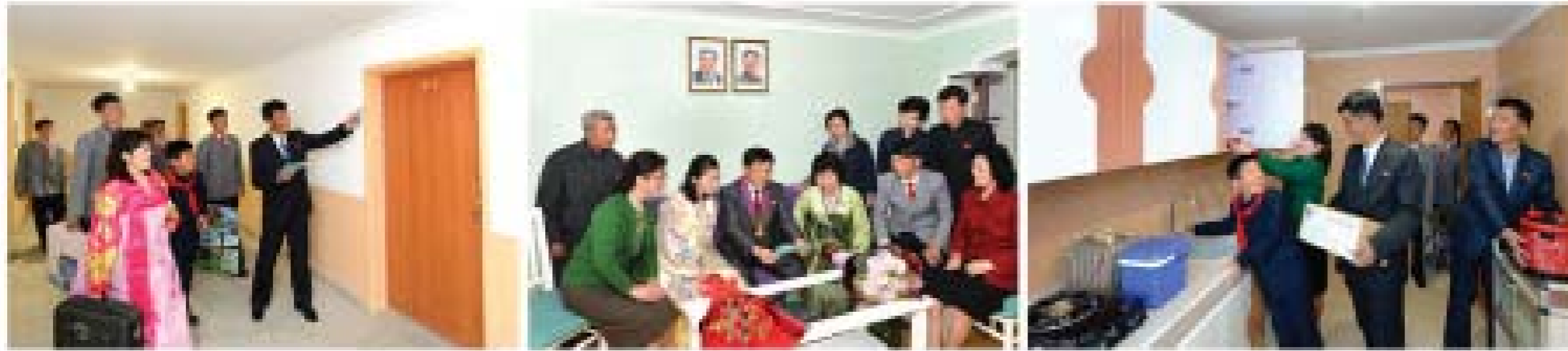
Lecturers and researchers at Kim Il Sung University and former residents are the first to move into the new flats.