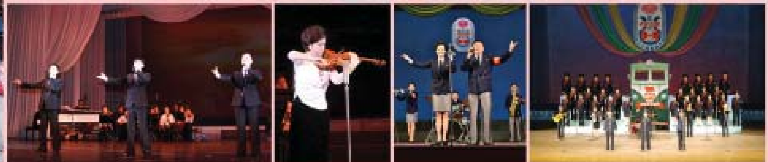
The people's art festival highly praises the undying exploits of the peerlessly great persons of Mt Paektu and fully demonstrates the Juche-oriented art which develops in a comprehensive way.