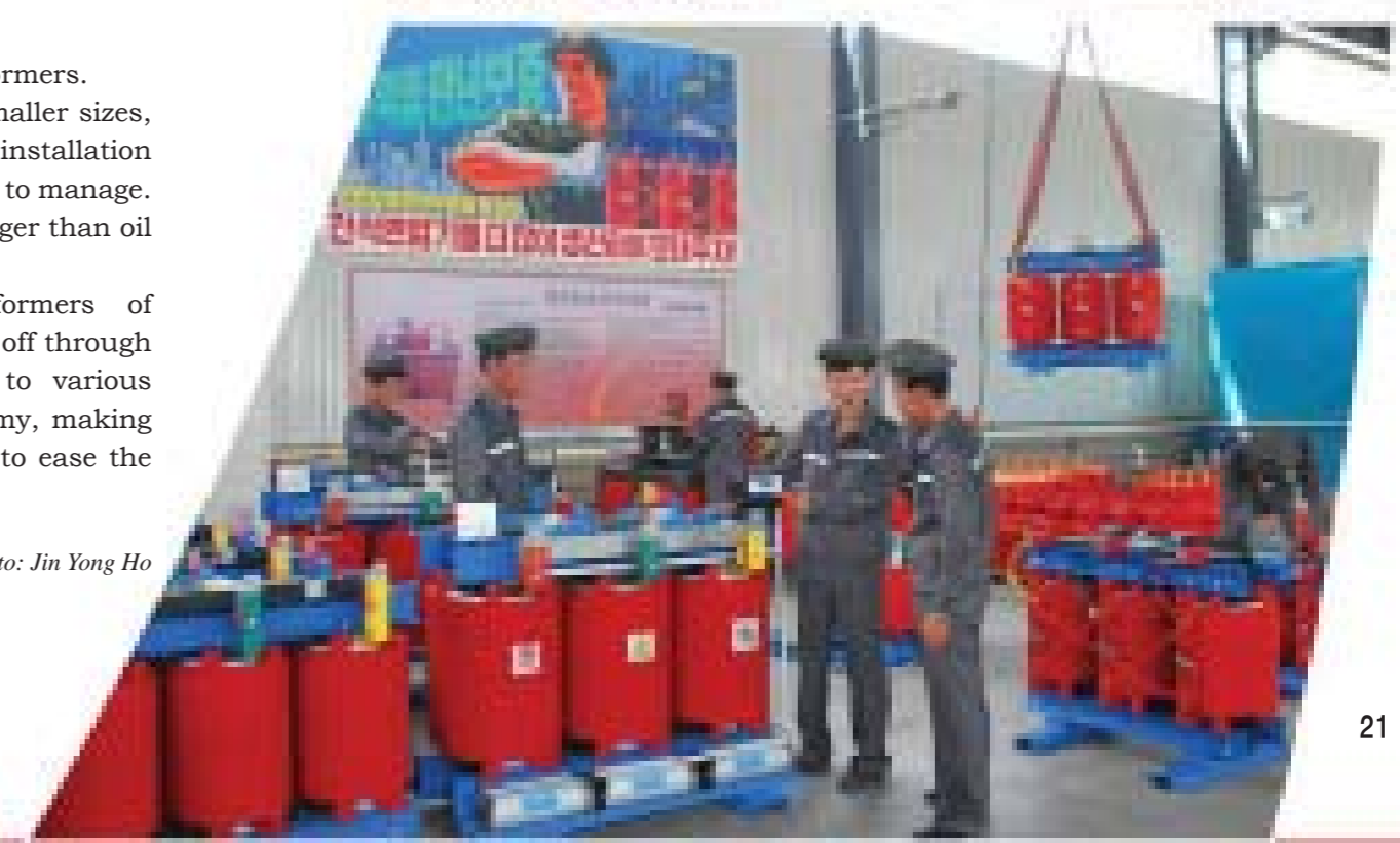
Article & photo: Jin Yong Ho

also called eco-friendly transformers. They are featured by far smaller sizes, making it possible to reduce installation area to the minimum and easy to manage. Their life span is ten years longer than oil transformers. Energy-saving air transformers of different capacities are rolling off through serial production and sent to various sectors of the national economy, making a great progress in the effort to ease the strain on electricity.