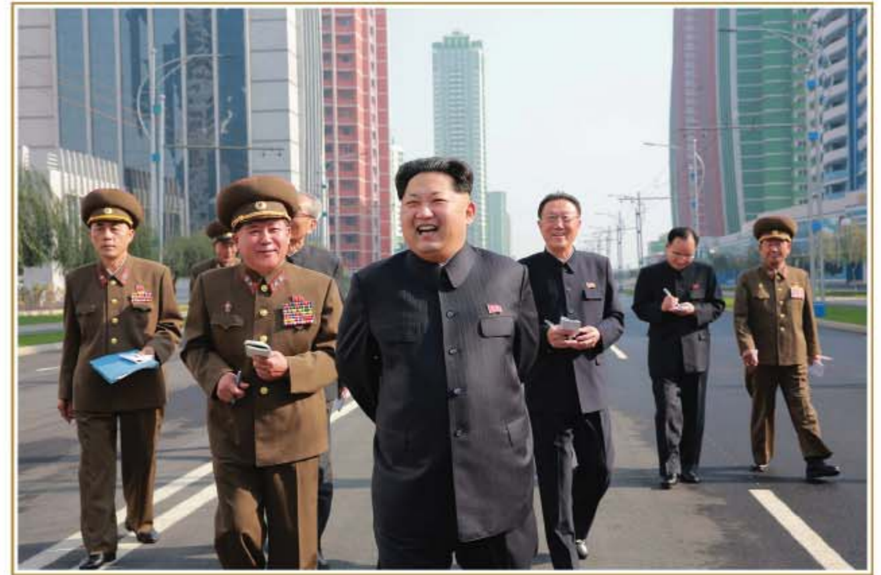
The respected Kim Jong Un looks round the completed Mirae Scientists Street [October Juche 104 (2015)]