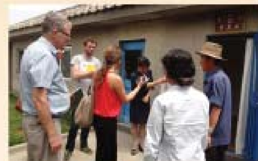
Members from the Korean federation and the EUPS conduct field surveys