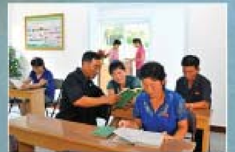
Farmers spend merry days at the holiday camp