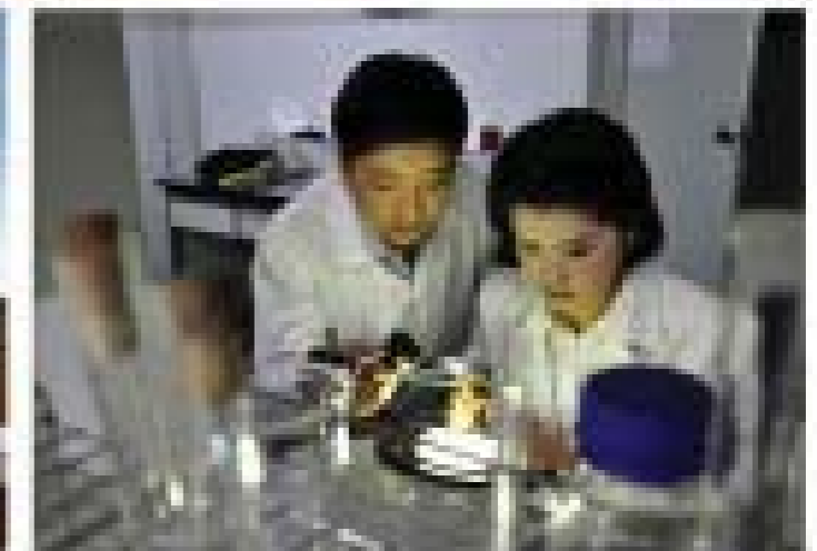
The university is furnished with research bases of several fields of science and technology