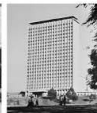
University building No. 2 built in Juche 60 (1971)