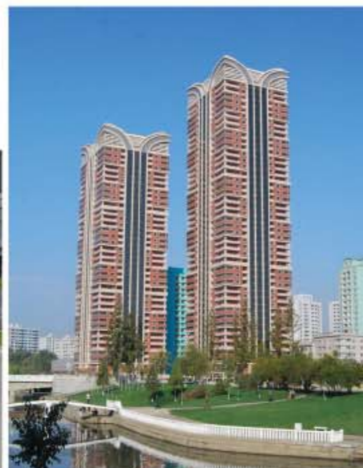
Apartment buildings for the educationists of Kim Il Sung University