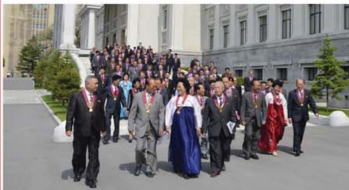
Lecturers and researchers are proud of their life devoted to the education of the rising generation and scientific study

The history and tradition of Kim Il Sung University are firmly carried forward by the respected Kim Jong Un.