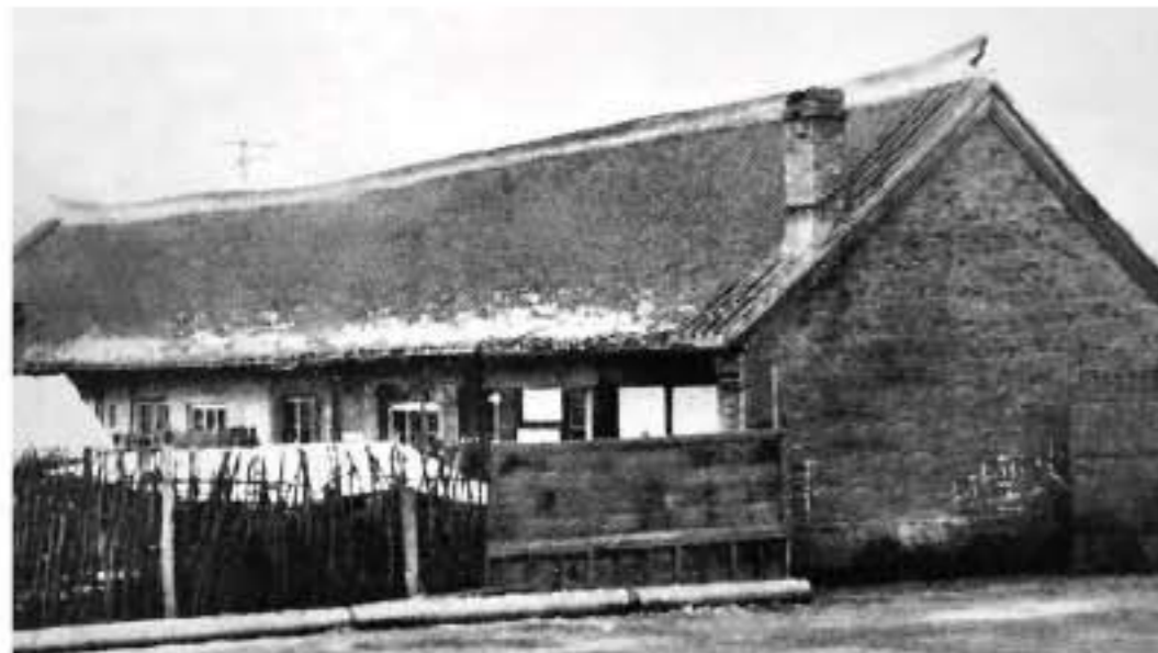
The house where the members of the DIU frequently held secret reading sessions