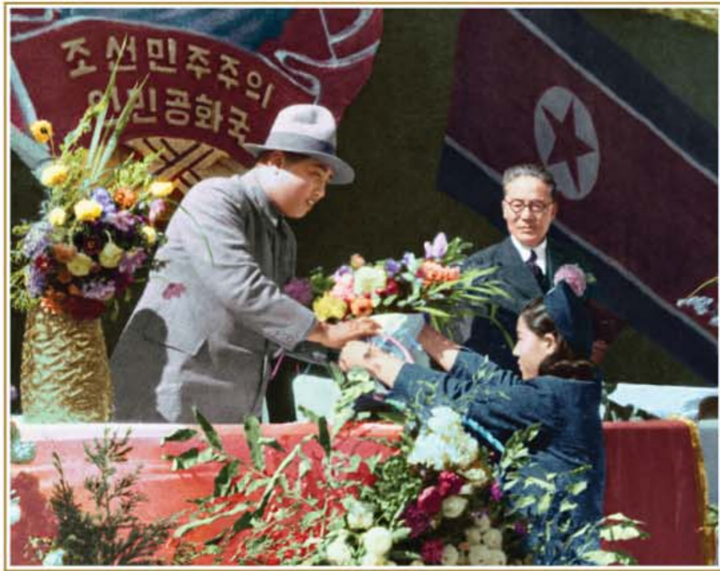
Kim Il Sung attends the inaugural ceremony of the new building of Kim Il Sung University [October Juche 37 (1948)]