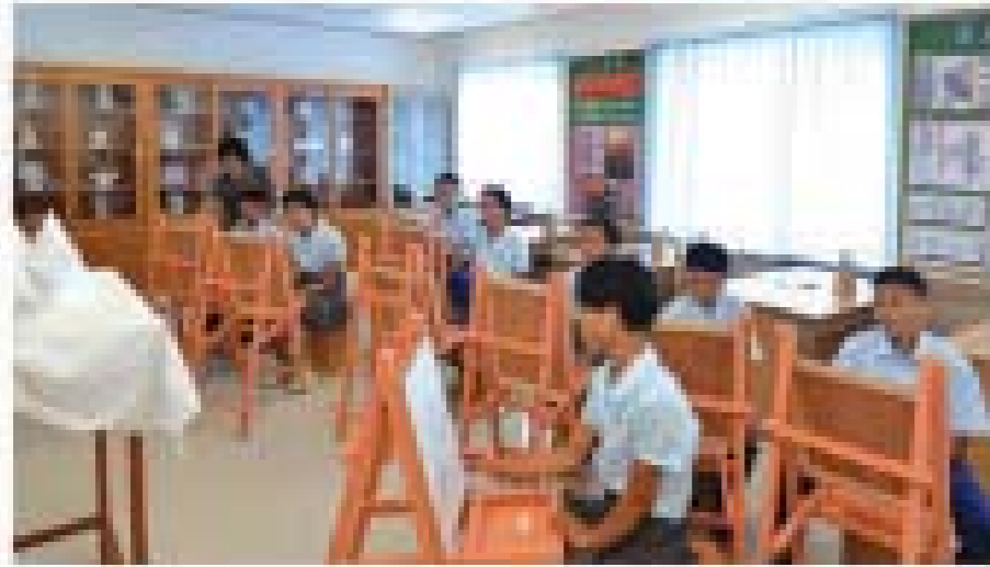
Students cultivate their talents