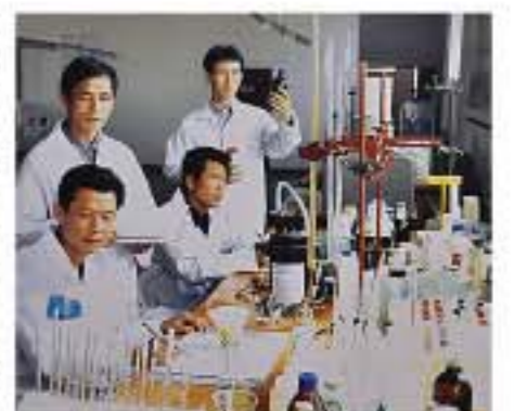
Researchers conduct scientific studies