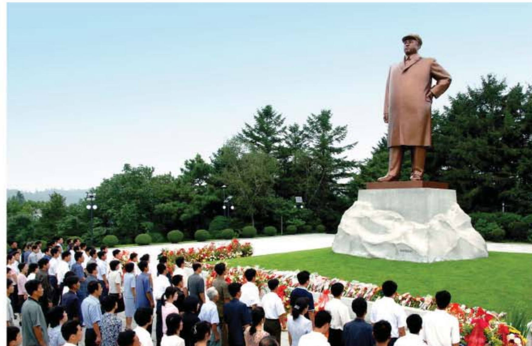
Statue of President Kim Il Sung on Ryongnam Hill