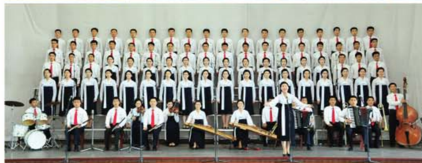
Students are engaged in artistic activities