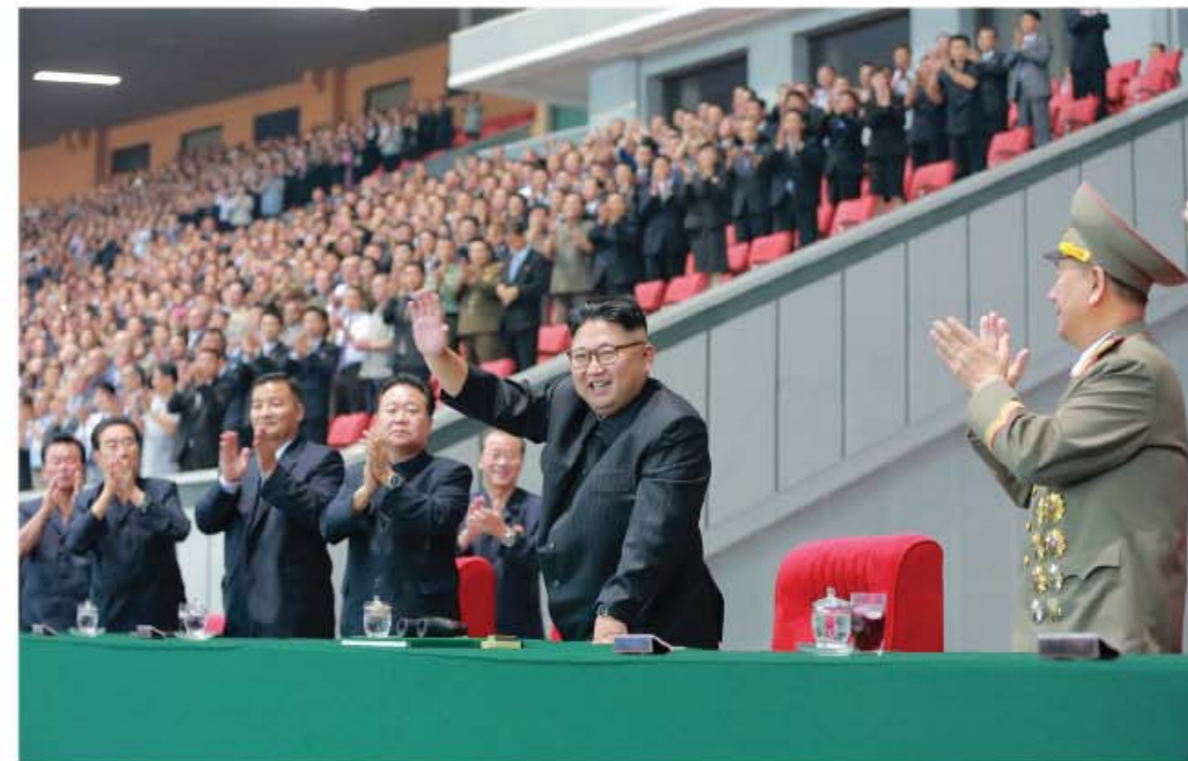
Kim Jong Un waves back to the young people [August Juche 105 (2016)]