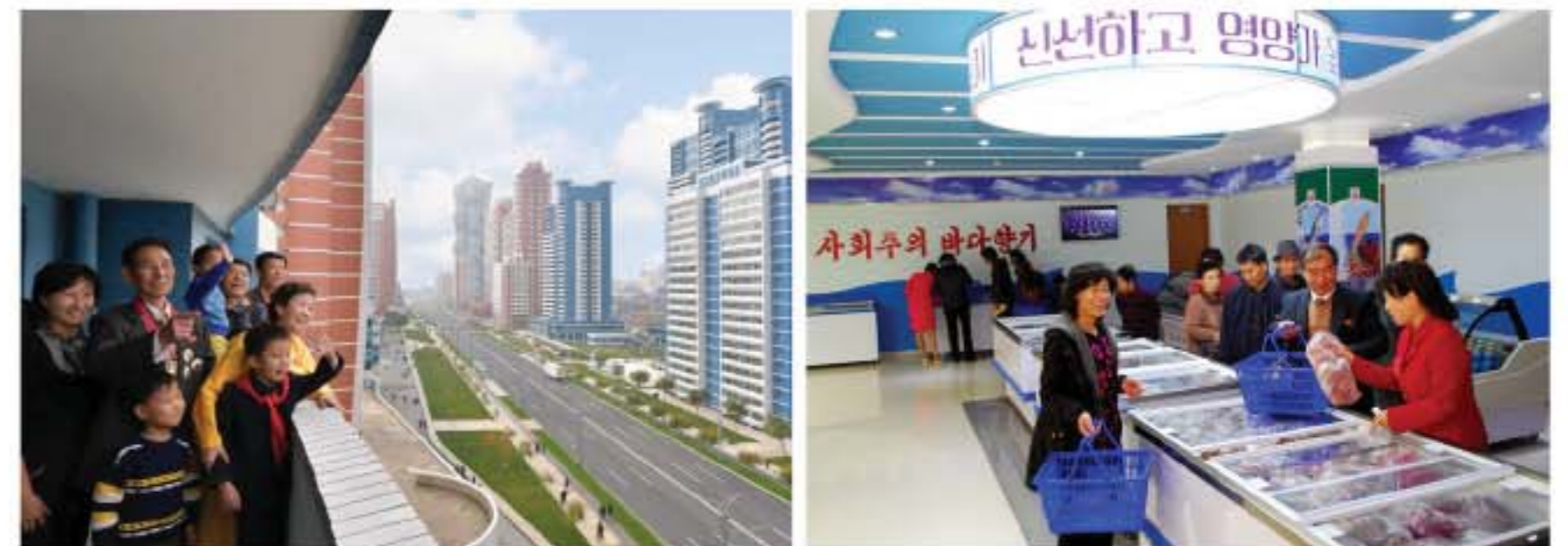
People are provided with new flats free of charge on Mirae Scientists Street built under the warm care of the WPK and enjoy happy life