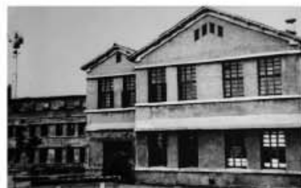
University building when it was established in October Juche 35 (1946)

He led energetically the work of the university so that it could consolidate its material and technical foundations and brought about a radical change in educational work as required by the new century. He also took measures to spruce up the university by building a modern e-library and swimming pool.