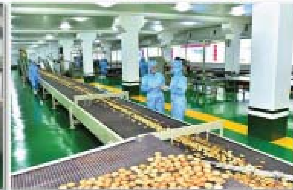
A variety of foodstuffs are produced