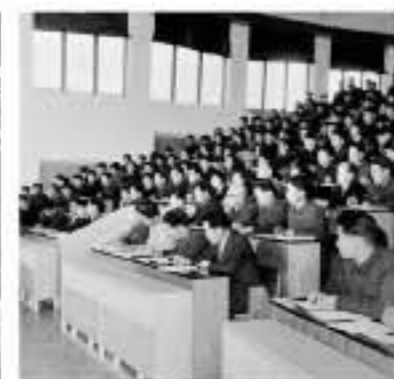
Lecturers in academic discussion