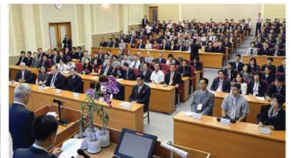
The university is engaged in exchange and cooperation of various forms, like academic seminars, exchanges of visiting lecturers from foreign universities and specialists