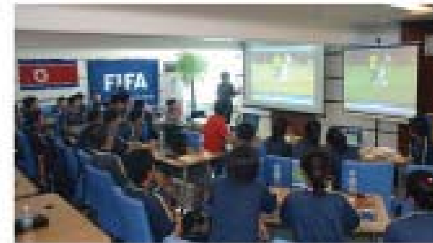
FIFA sponsored a refereeing course in Pyongyang