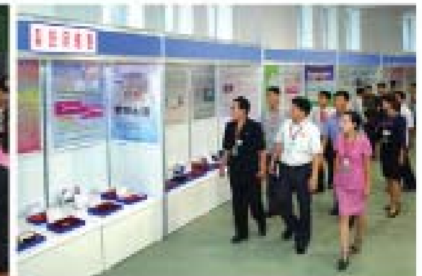
The 7th national medical appliances exhibition was held