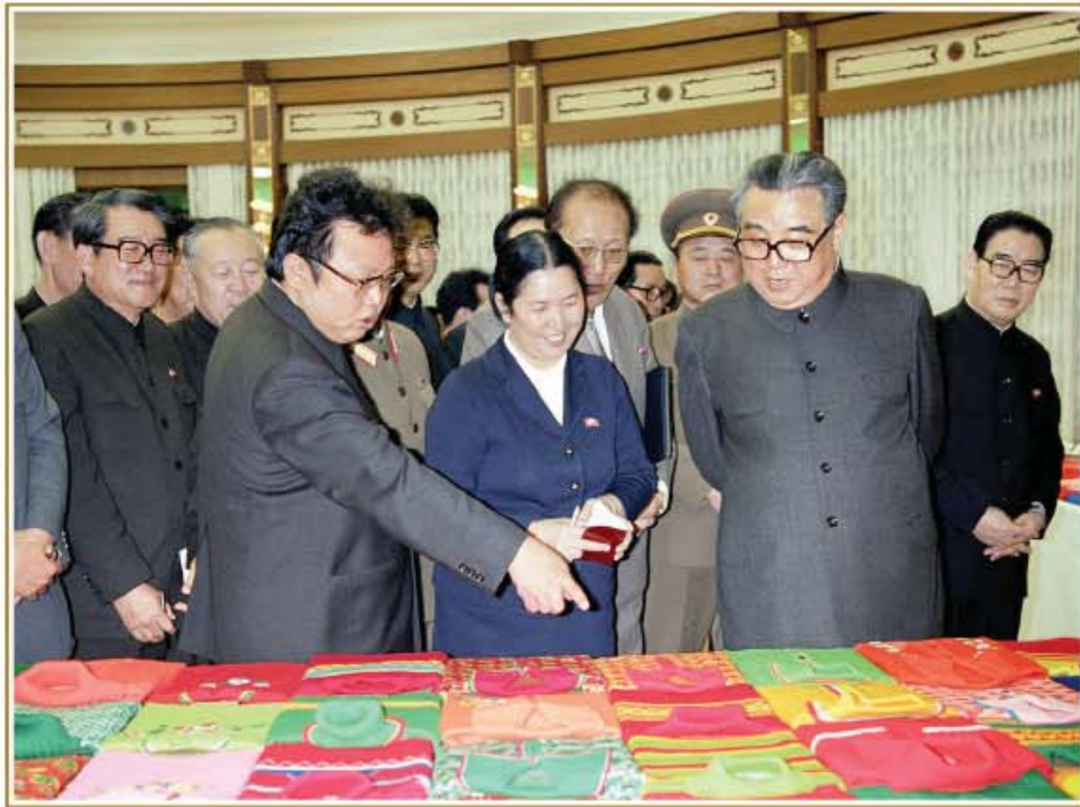
Great leaders Kim Il Sung and Kim Jong Il see sample garments for the children [April Juche 73 (1984)]