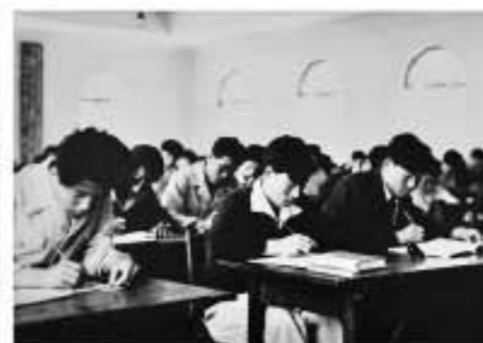
Students studying at the new building