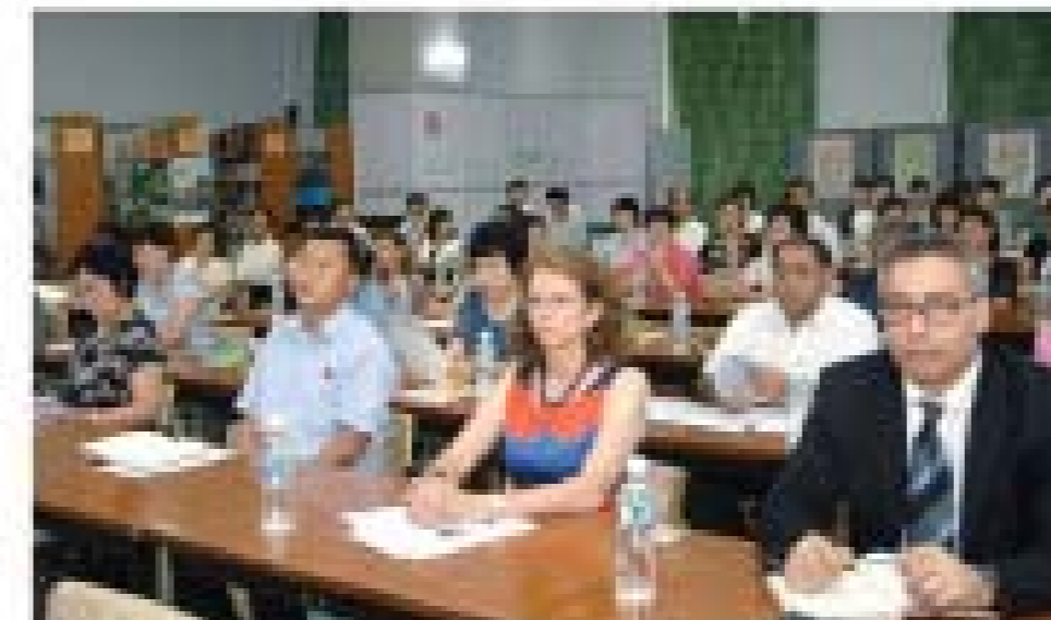
A symposium was held to mark the World Breastfeeding Week in 2016