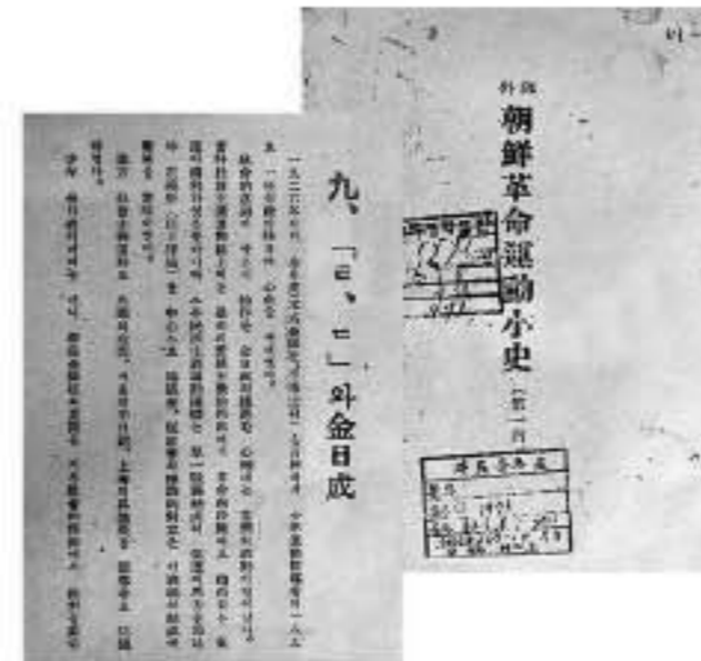
A publication introducing the formation of the DIU and its activities