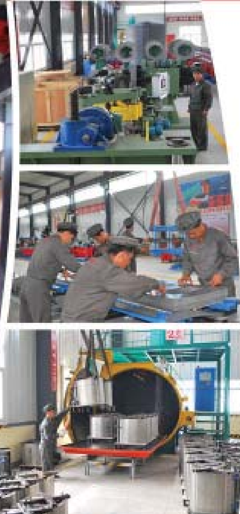
Energy-saving air transformers of different capacities are produced and sent to various sectors of national economy

To Implement the Decisions of the Seventh Congress of the Workers' Party of Korea