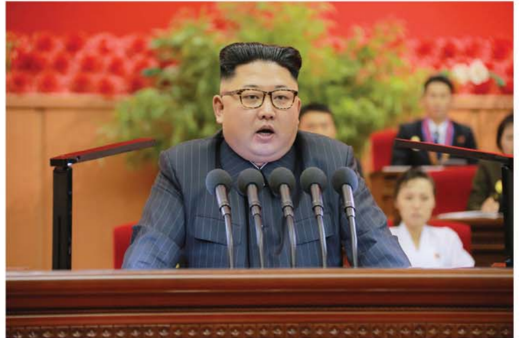
Kim Jong Un delivers a speech at the Ninth Congress of Kim Il Sung Socialist Youth League [August Juche 105 (2016)]