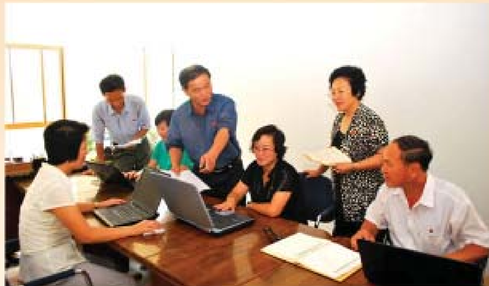
Officials of the federation discuss the plans of supporting the rest homes across the country