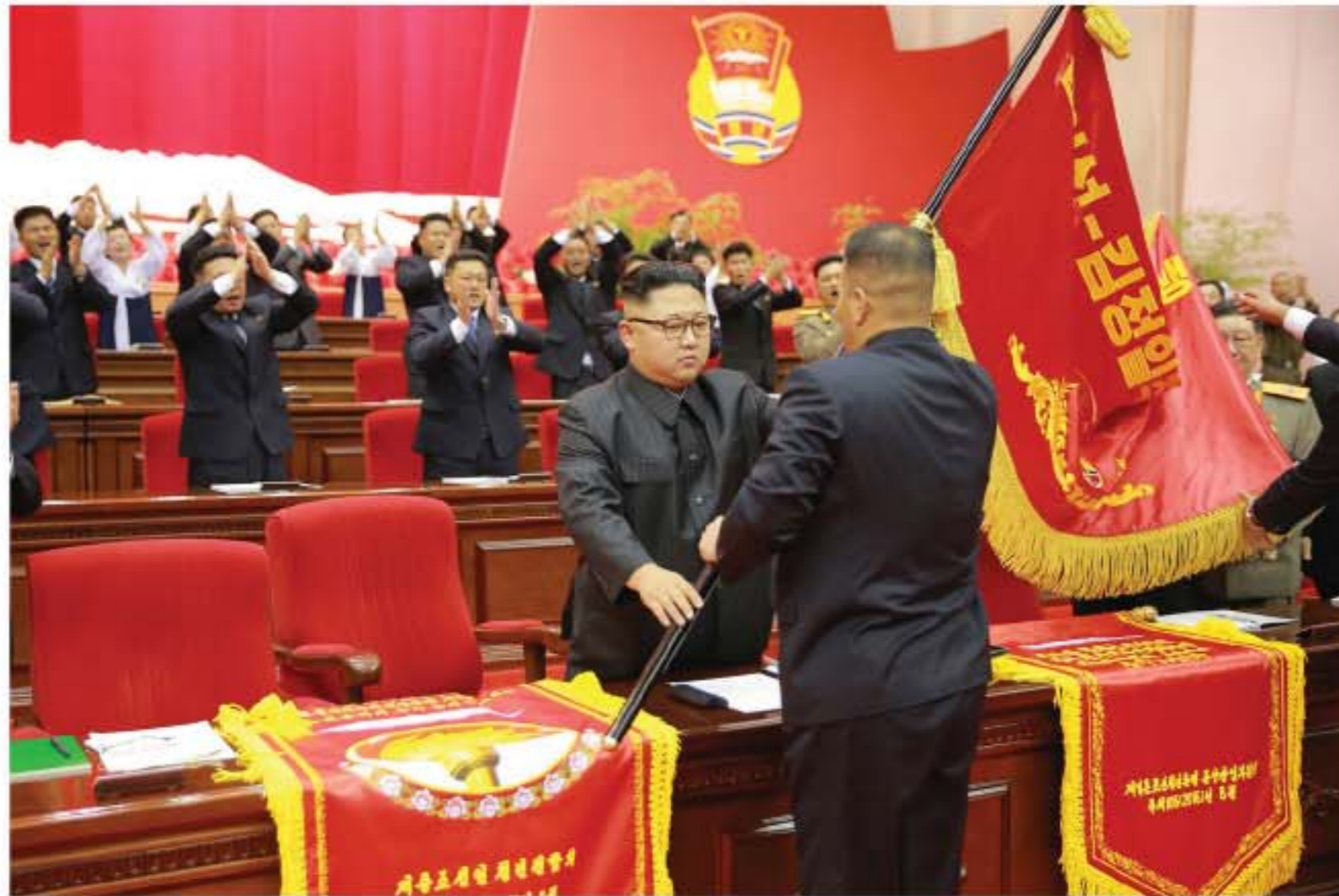
Kim Jong Un hands over the flag of Kimilsungist-Kimjongilist Youth League [August Juche 105 (2016)]

By solemnly declaring that Kim Il Sung Socialist Youth League was renamed Kimilsungist-Kimjongilist Youth League, the Ninth Congress of Kim Il Sung Socialist Youth League affirmed the invincible faith and will of the Korean young people to add eternal lustre to the undying exploits the great leaders had performed in developing the Juche-oriented youth movement and hasten the final victory of the revolutionary cause of Juche, the cause of Songun-based revolution, following the respected Kim Jong Un.