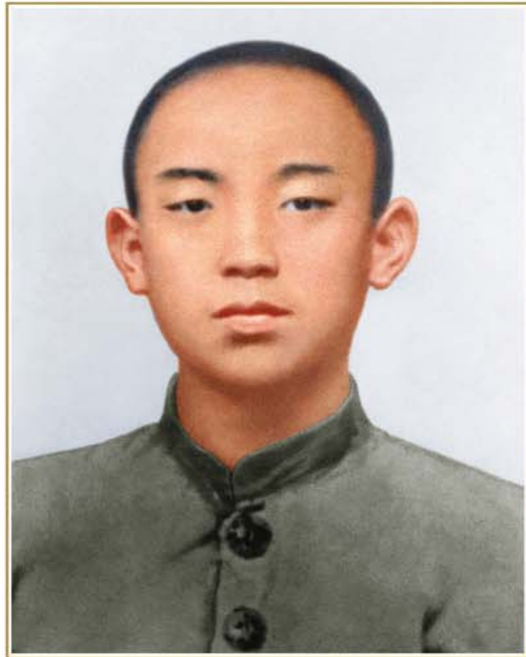
Kim Il Sung in the days when he formed the DIU [Juche 15 (1926)]

October 17 this year marks the 90th anniversary of the formation of the Down-with-Imperialism Union by Kim Il Sung, the founder and builder of the Workers' Party of Korea.