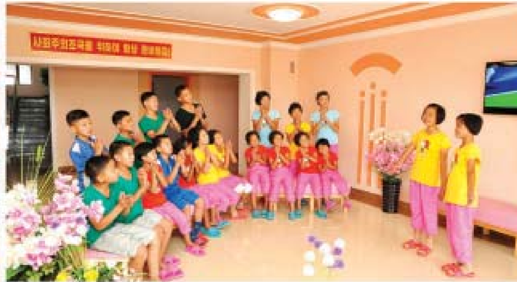
The dormitory in the evening hours is for recreations of the students