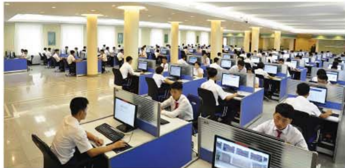
E-library (above) and natural history museum (below)