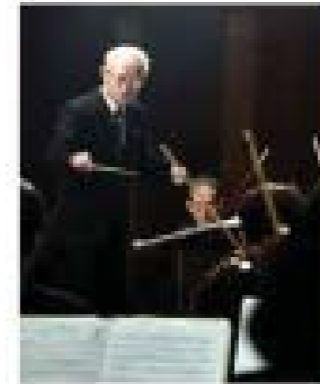
A commemorative concert was given in Pyongyang to mark the 70th anniversary of the National Symphony Orchestra