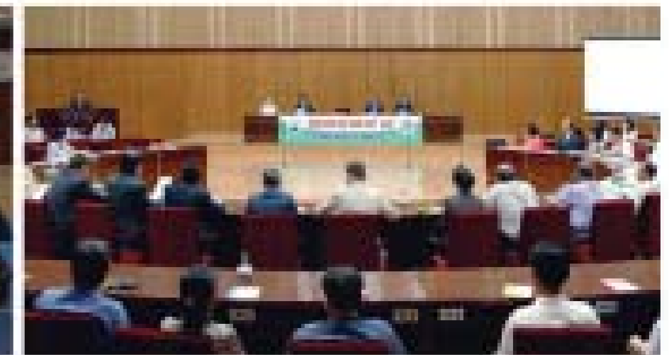
Malaria Day 2016 was observed