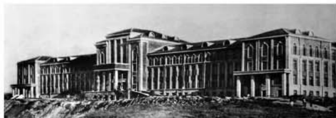
New building inaugurated in October Juche 37 (1948)