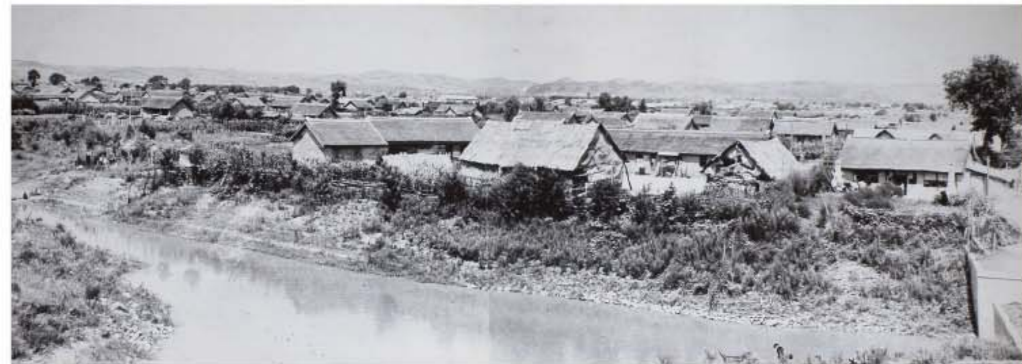
General view of Huadian in those days