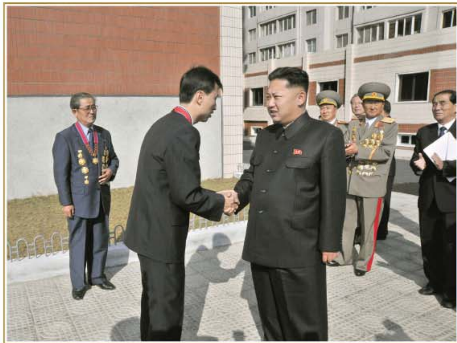
Kim Jong Un attends an inaugural ceremony of the apartment buildings for the educationists of Kim Il Sung University [October Juche 102 (2013)]

Thanks to his sagacious leadership Kim Il Sung University is widely recognized as a world-class university comprised of social sciences, physical sciences, engineering, medical science, agricultural science and so on.