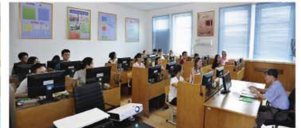
Foreign students studying at the university