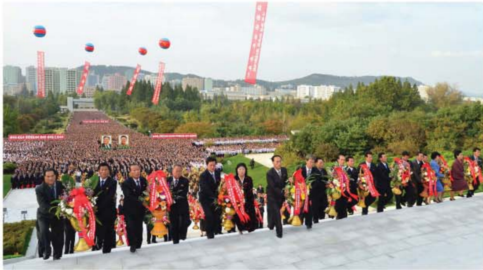
Statue of General Kim Jong Il was unveiled on October 1, Juche 102 (2013)