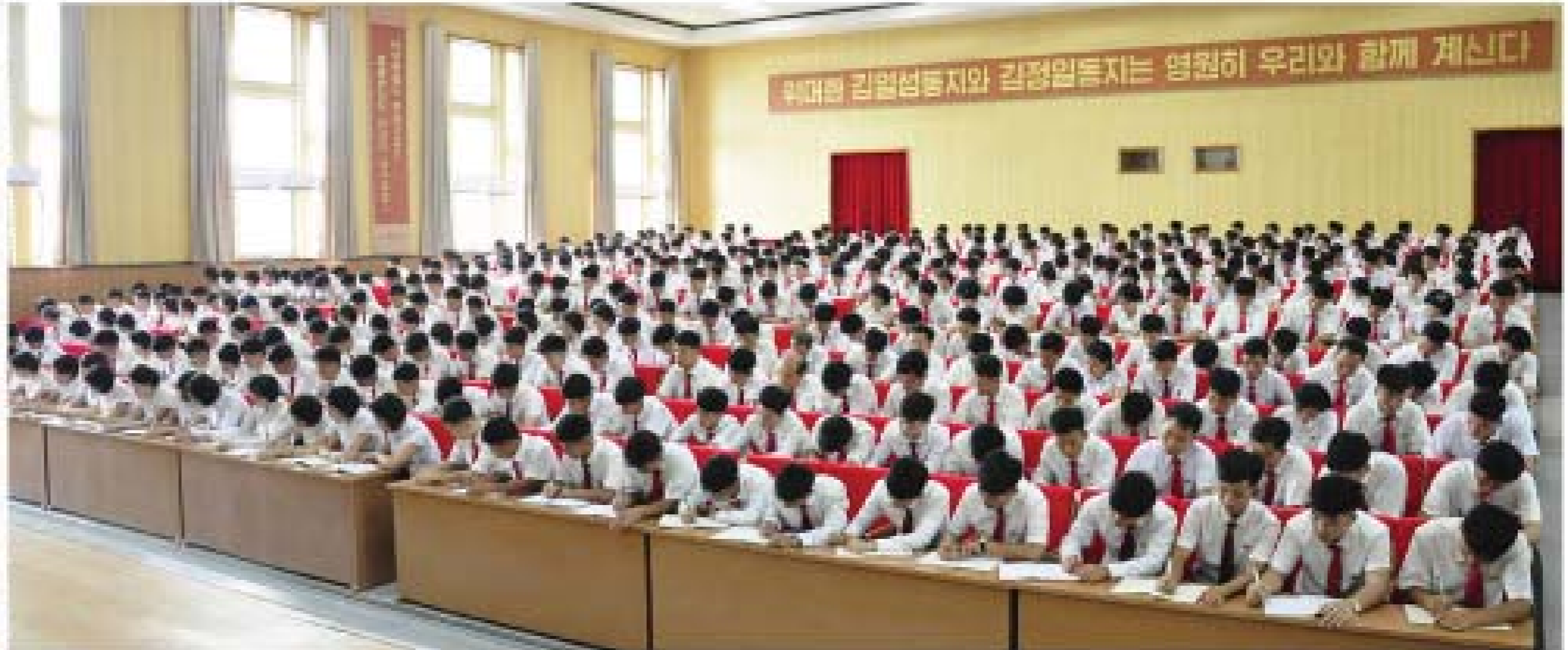
There are seven colleges of cultural, social, physical, agricultural and medical sciences and engineering, as well as scores of faculties