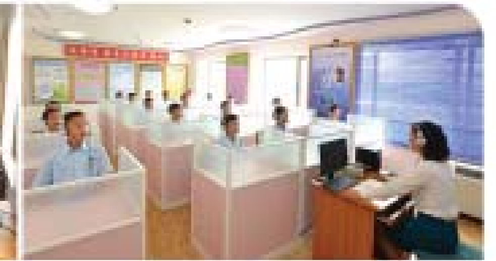
Students acquire an all-round knowledge