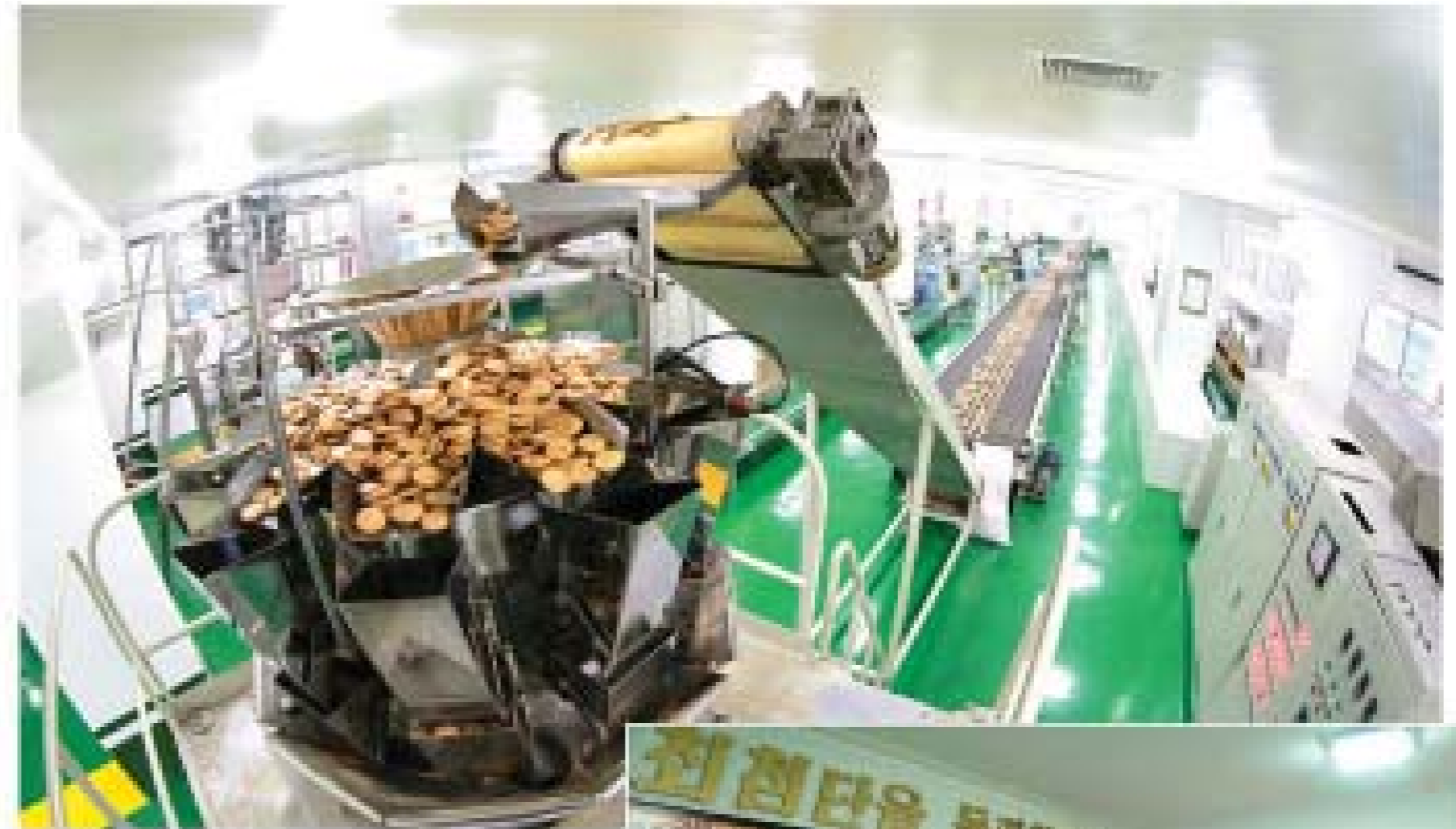
All the production processes have been automated, streamlined, sterilized and dust-free

It has fully established the quality control system based on advanced analysis and experimental equipment at the general analysis room, so as to make its food products satisfy