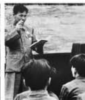
Lectures continued during the war