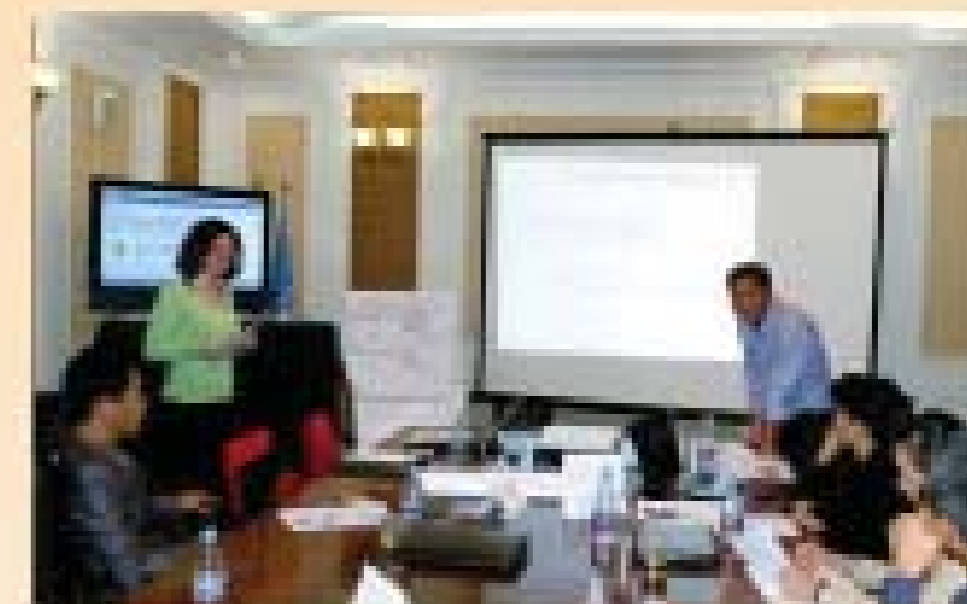
Workshops in various fields are held