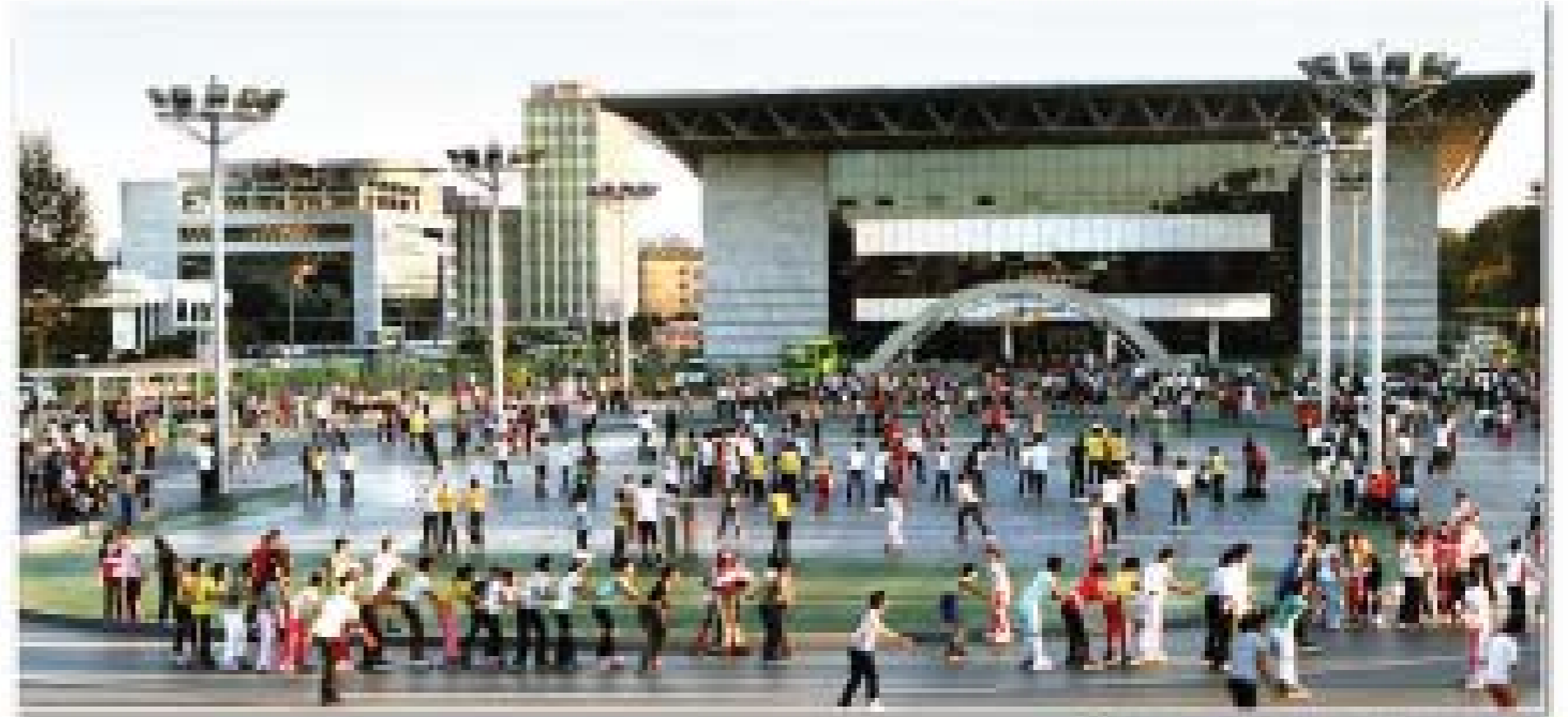
Baby homes and orphanages, as well as the Munsu Water Park, Masikryong Ski Resort and other bases for the people's cultural and leisure activities have been built across the country