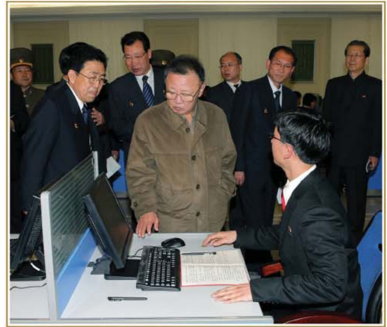
Kim Jong Il looks round the e-library of Kim Il Sung University [April Juche 99 (2010)]