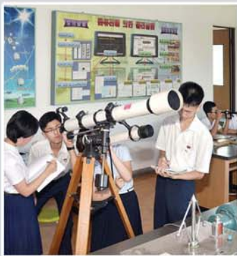
Front Cover: With a dream of becoming a space scientist