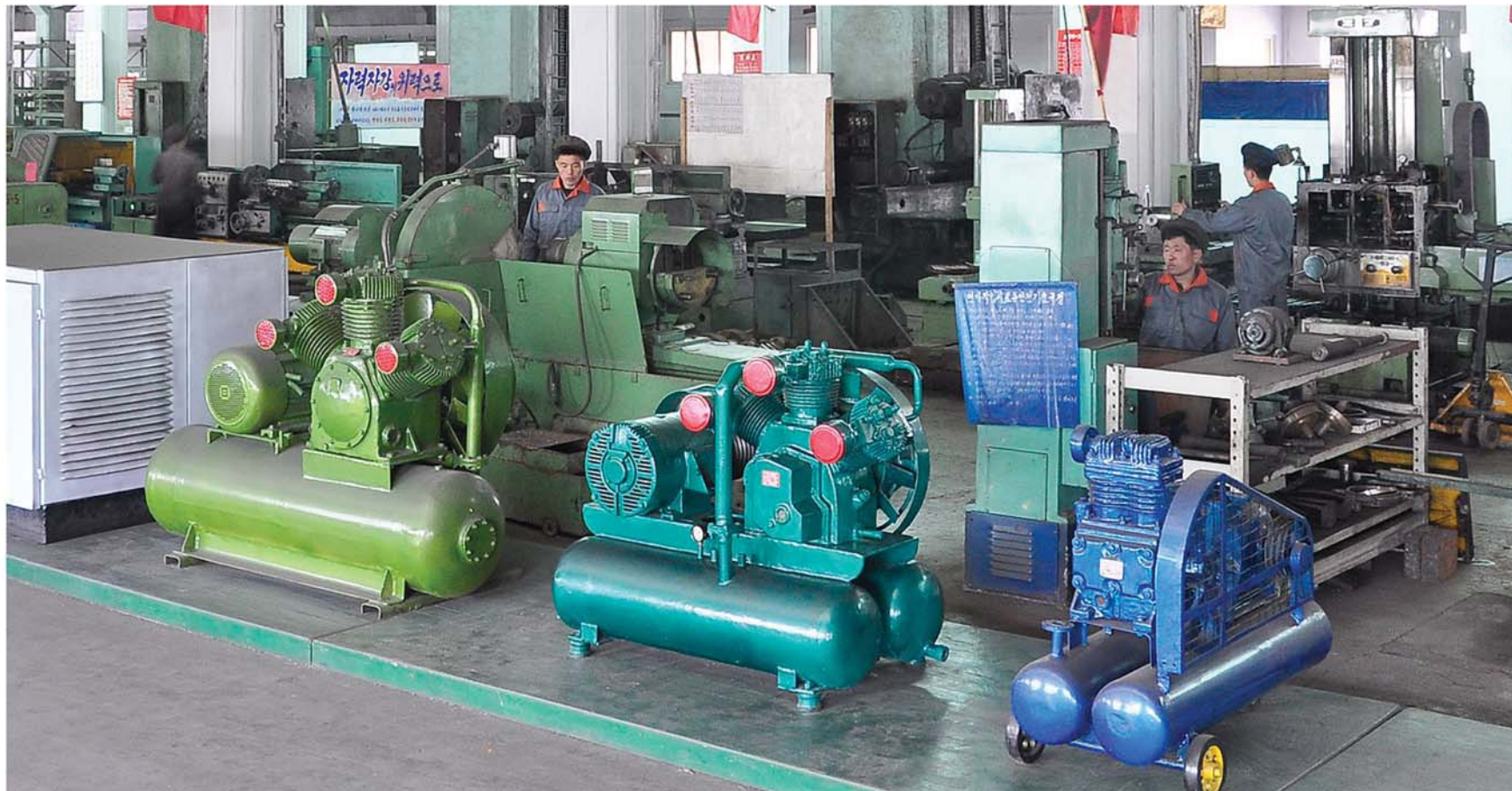
New types of compressors are under production.