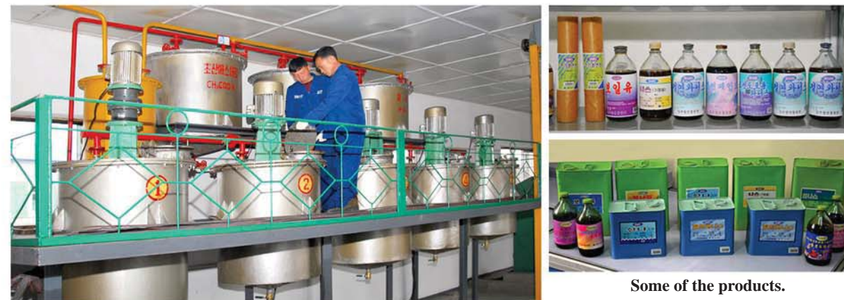
Some of the products.