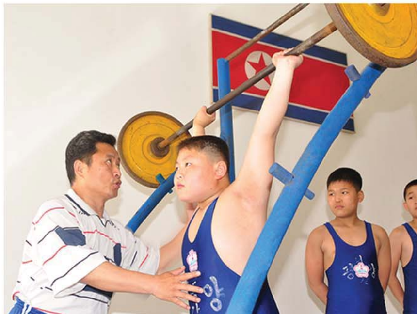
With a dream of becoming weightlifting stars.