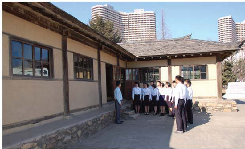
The old building of Changdok School and a classroom where Kim Il Sung studied.

Then he guided me to a place where there is preserved a historic building fronted by a statue of young Kim Il Sung in school uniform—Kim Il Sung had studied in the building. We made a bow respectfully in front of the statue and looked round the old building before going to the building of the school.