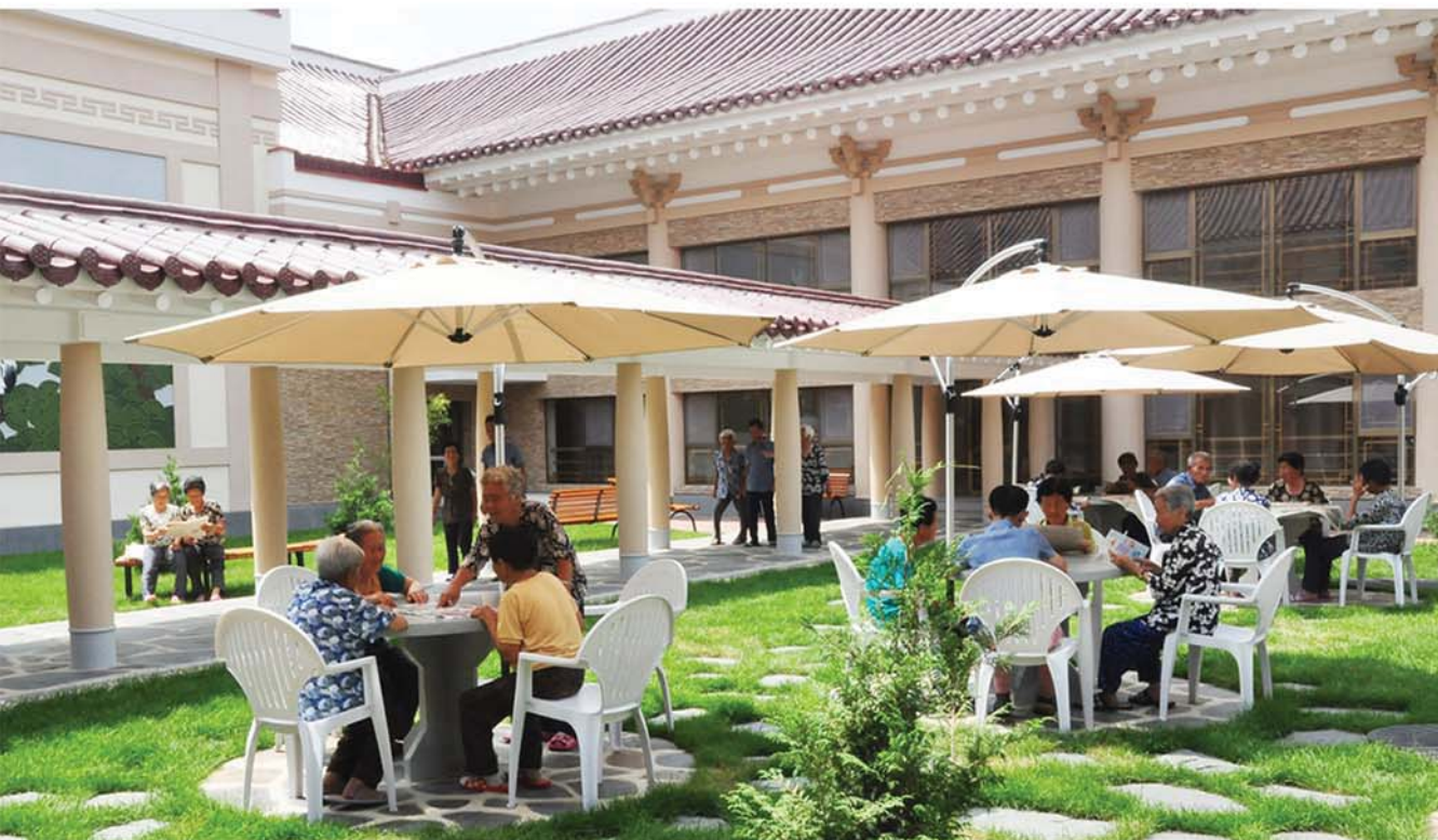
Elderly people have a good time at the Pyongyang Old People's Home.

► mass media and various meetings and events.