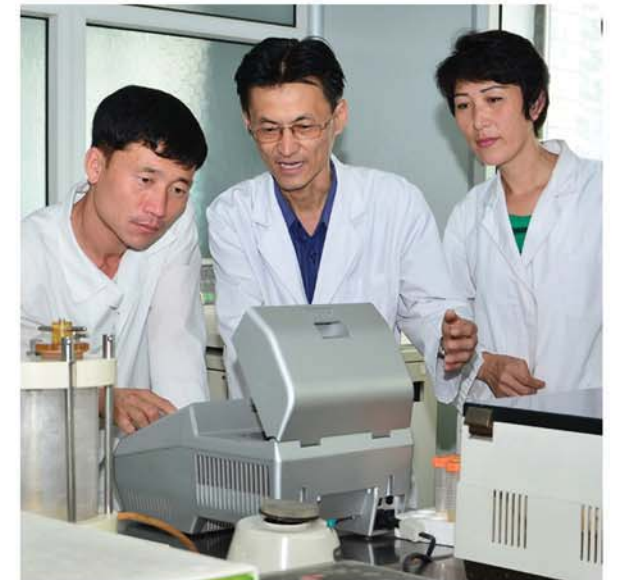
Research is under way for remedies of malignant diseases.

leucopenia caused by anticancer medicines, the injection is also used for treatment of leukemia of different symptoms, including congenital, periodic and cryptogenic leucopenia, and the one in the case of aplastic anaemia and myeloproliferative syndrome.