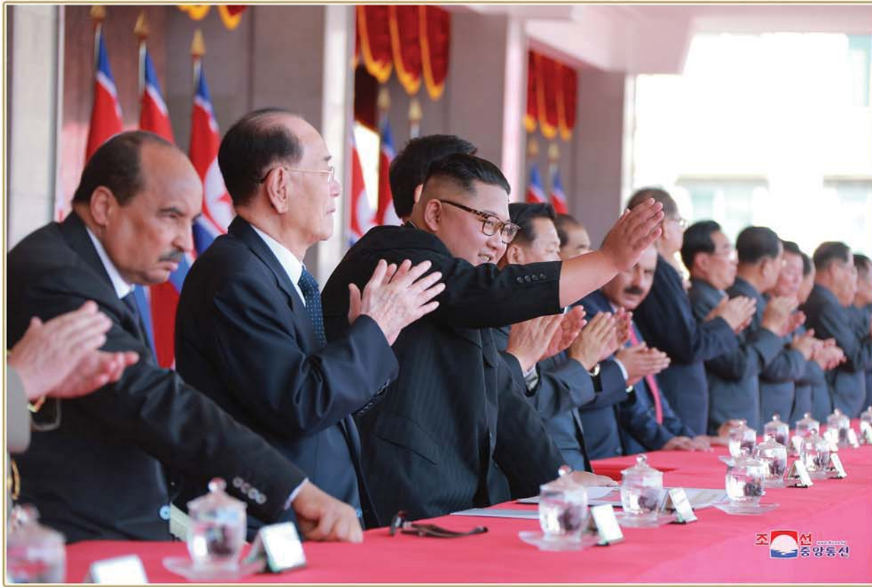
Kim Jong Un waves back to the cheering crowds in September 2018.

► launched into the international arena as a proud independent and sovereign state.