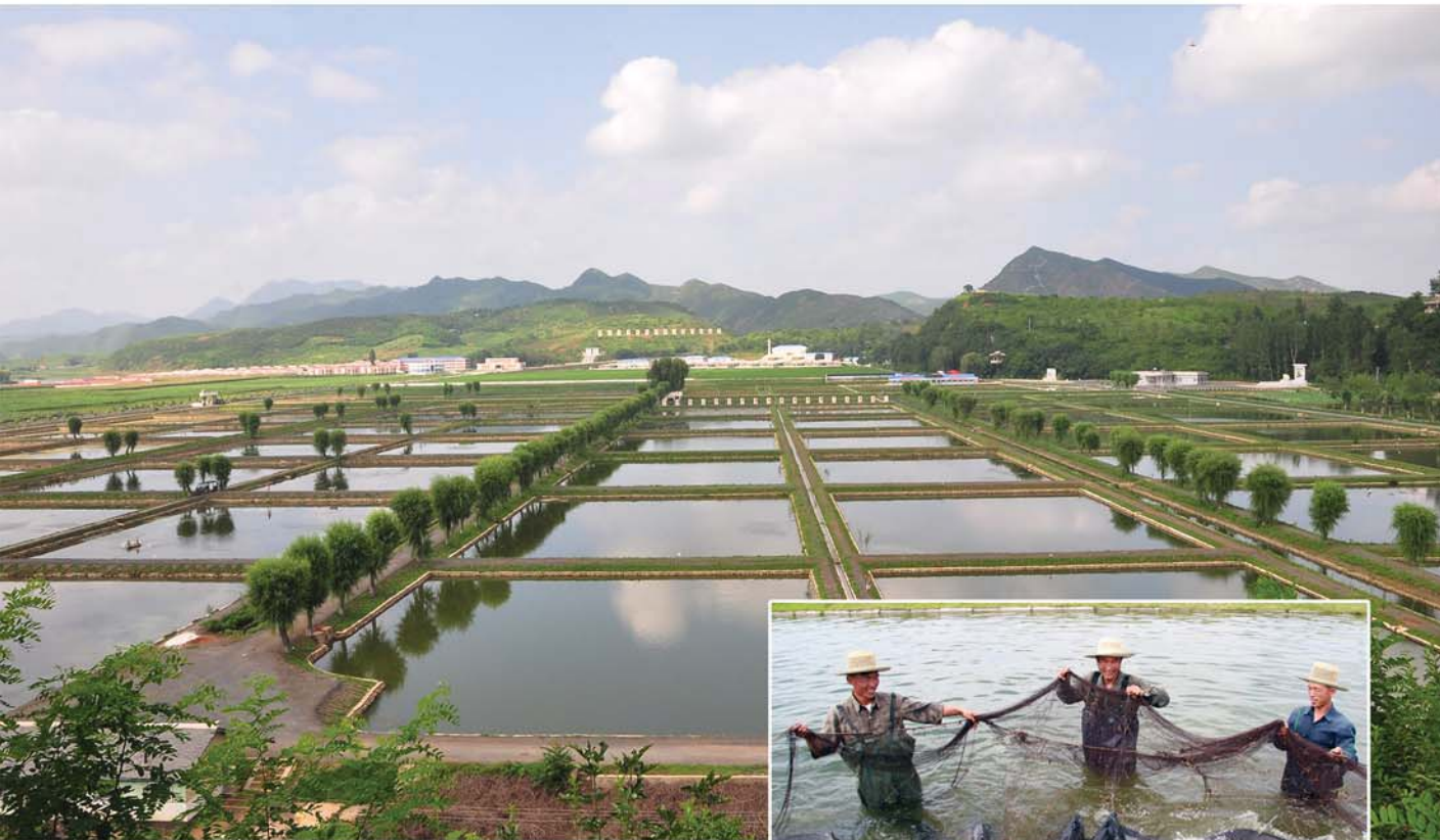
The Poman Fish Farm.