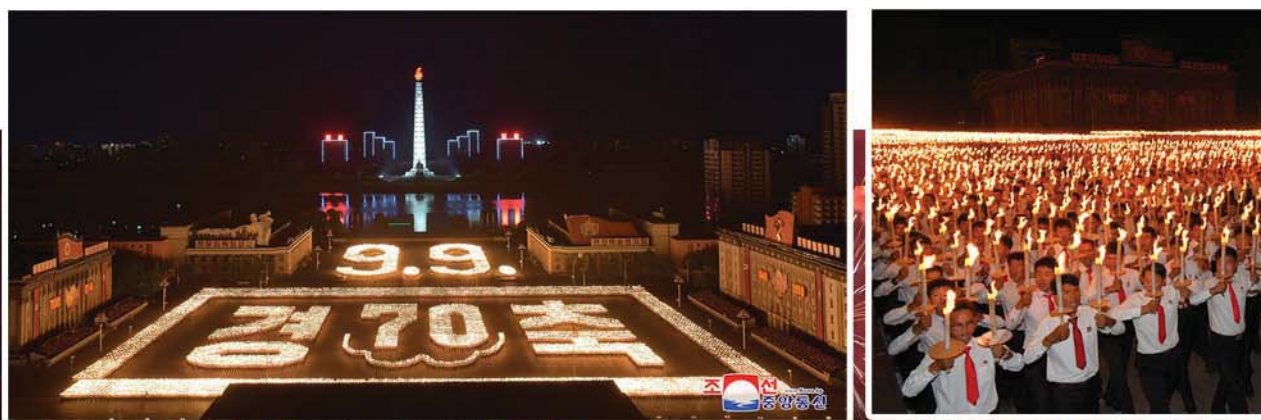
Scenes from young vanguard’s torchlight procession “Youth, forward, demonstrating valiant mettle of heroic Korea!” held in September 2018 in celebration of the 70 th anniversary of the DPRK.