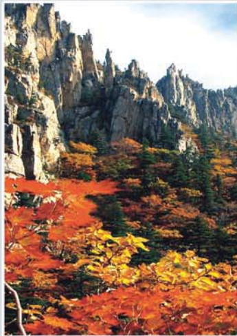
Back Cover: Manmulsang in Mt Kumgang in autumn