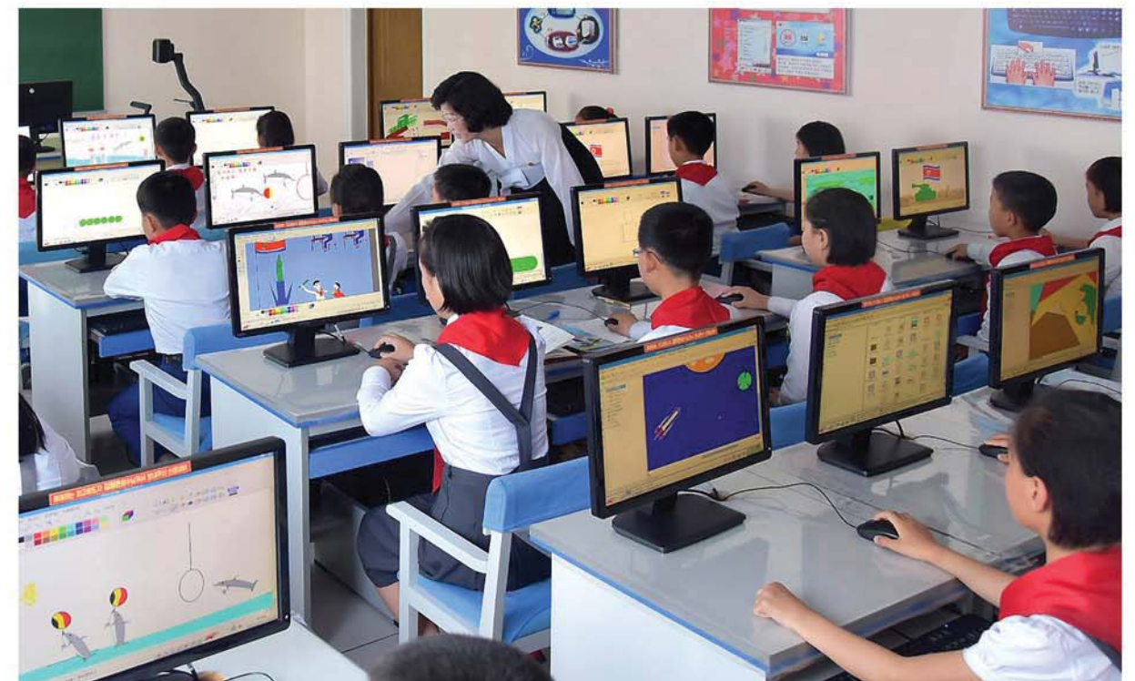
At a computer lesson.

The victory of the socialist revolution and the establishment of the advanced socialist system in the country in 1958 enabled all members of the society to become socialist workers. In keeping with the reality the Cabinet decision "On the universal abolishment of the students' school fees" was adopted in 1959 in order to thoroughly implement the principle by which the state takes full responsibility for education of all the working people, and it was proclaimed that the universal free education system would be enforced from April 1 that year. As a result, all the working people and their children came to be free from all