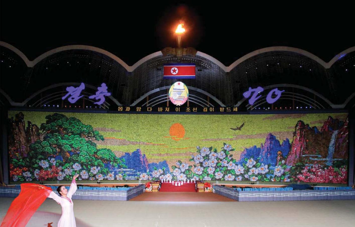
Scenes from the grand mass gymnastics and artistic performance “The Glorious Country” given in September 2018 in celebration of the 70 th anniversary of the DPRK.