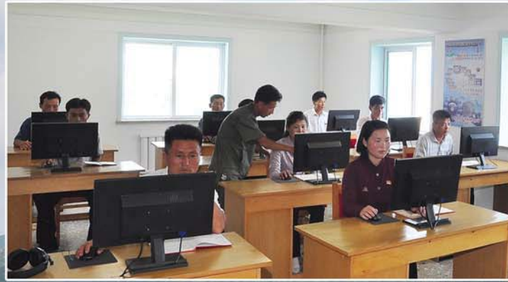
Cultivation of crops is put on a scientific basis.