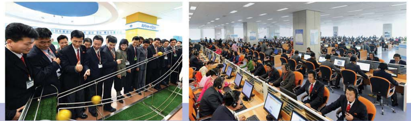
The Sci-Tech Complex.