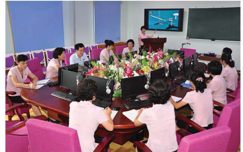
A discussion is under way about teaching methods.

ing for judgment of ability by department, she added and guided me to the instruction section where the teachers were gathered. At the meeting there were raised problems in improving their computer-related skills including that of making various multimedia. With education made IT-based on a higher level, the problems and their methods of solving them were unusual, so it was not easy to decide the result.