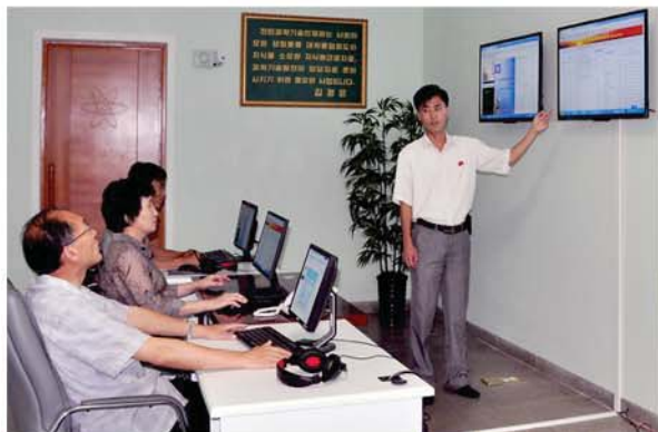
A teaching plan of online education is under consideration, and a class is at lecture.