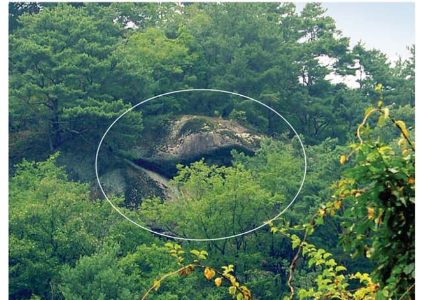
Hama (hippopotamus) Rock.

Pison Falls, a typical vertical falls among the numerous waterfalls in the mountain, is well known for its strange and beautiful appearance. The name originated from a legendary tale that fairies would ascend to Heaven by the rainbow made by the waterfall after having a good time in the ravine. It is 46 metres high. On both sides of the falls are forests. The sky is seen over the cliff of the waterfalls as if its watercourse is linked to the sky. The water falls down in two currents from the sheer cliff. The left current, resembling countless silk threads, flows down the rock and breaks down to the pool. And the right one slides down some way over the rock and then flies down violently to a rock shelf, raising sprays. Besides the falls is Pison Rock with a fine view