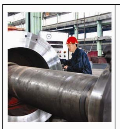
Front Cover: The Taean Heavy Machine Complex is pushing ahead with the production of generating equipment