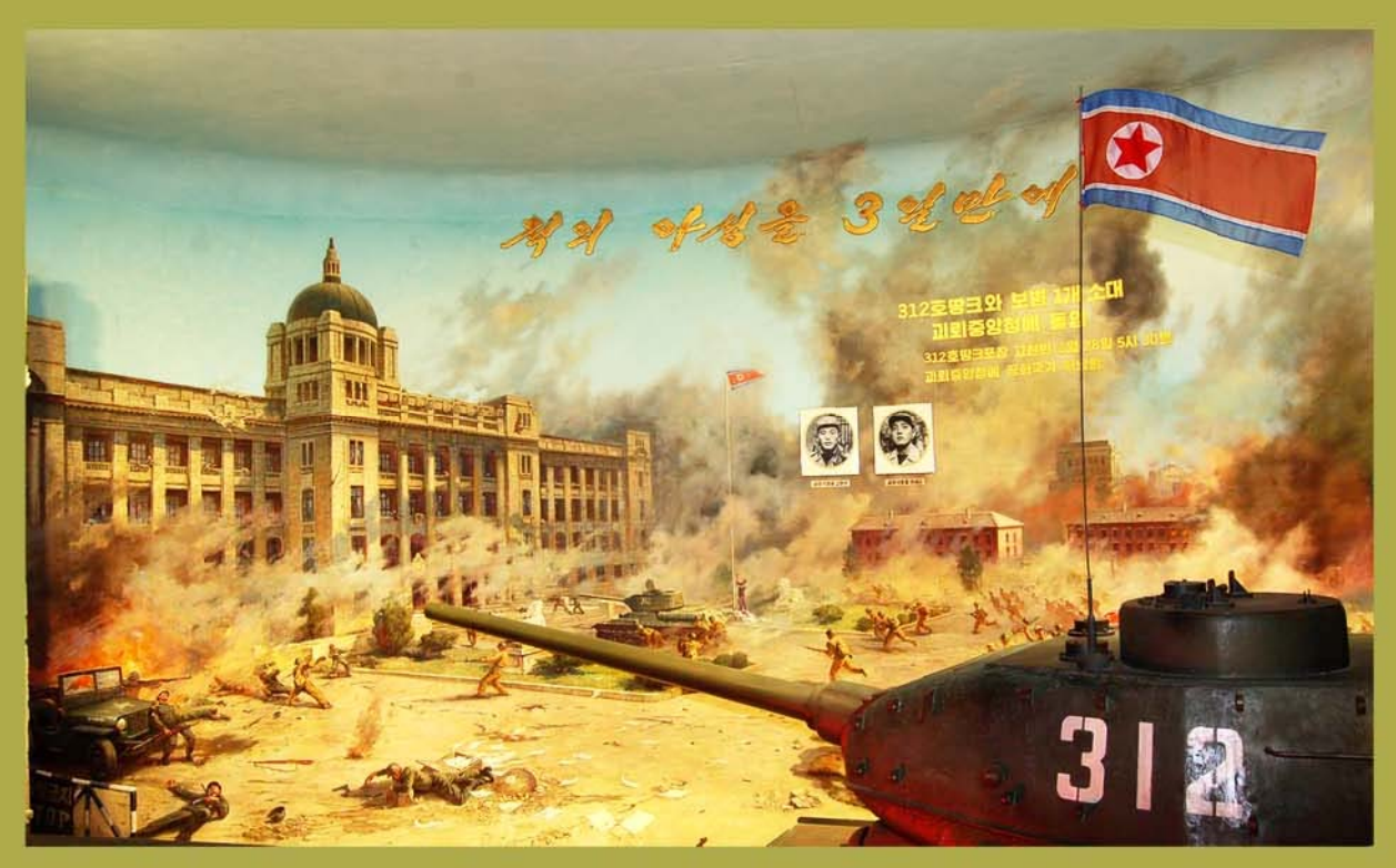
A large-sized picture of the operations for liberation of Seoul.

► cal, economic and military measures to carry out the policy and organized and led military operations in the frontline to the victory. Thanks to his command the KPA units administered lethal blows to the US aggression forces and the south Korean puppet army through many operations and battles including the battle in which they captured the enemy's capital city of Seoul in three days after the war broke out, the Taejon liberation battle that is a model of modern encirclement battle, the Jumunjin torpedo boat battle recorded in the world naval battle history, and the battle in which KPA units crossed Raktong River over night defying showers of bombs and shells.