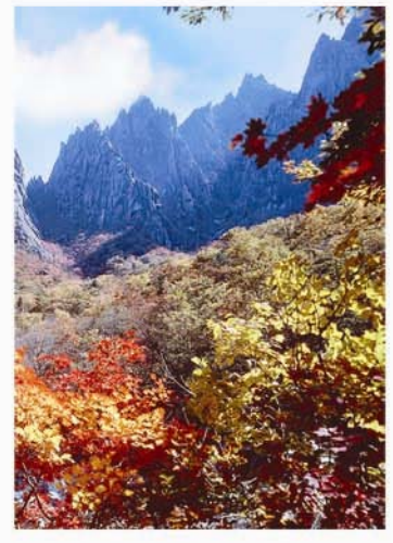
Back Cover: Jipson Peak in Mt. Kumgang in autumn