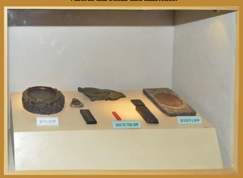
Various ink sticks and inkstones.

I saw an old book on display describing kyongdang . It says that in Koguryo each village had a big house called kyongdang to make young people read books and train archery during the days or at night. Also on display are data on jujagam of the Palhae Dynasty (late 7th century-early 10th century), which was similar to thaehak of Koguryo. In the period of Koryo (918–1392) large and small schools and private schools were built across the coun-