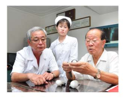
Researchers who developed the artificial femoral joint.

Seeing the old man leaving the hospital with his wife and grandchildren, some people were chatting together, "A worker of my factory had to walk with the help of a cane after his leg got