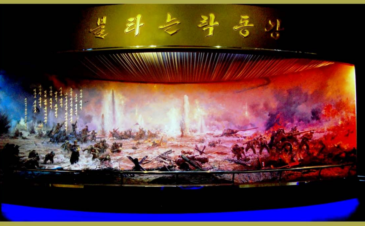
A picture of the fierce battles on the Raktong River.