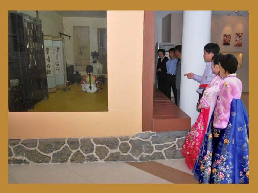
(Continued from the last issue)