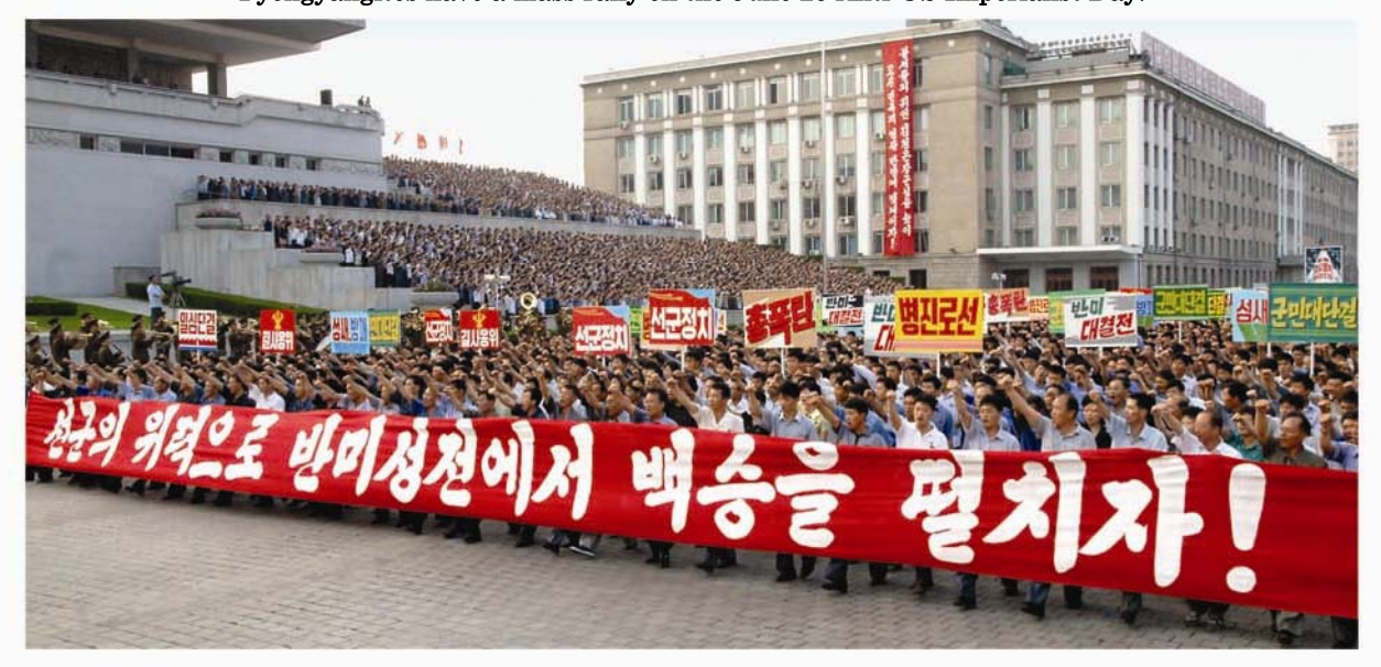
Pyongyangites have a mass rally on the June 25 Anti-US Imperialist Day.

However, the US and the south Korean regime answered the DPRK's sincere overtures and efforts with arms buildup and large-scale joint military exercises. The US deployed more than 60 per cent of its nuclear submarines around the Korean peninsula and in January this year assigned a nuclear-powered aircraft carrier-led flotilla additionally to the 7th Fleet which is basically active in the Northeast Asian region including the Korean peninsula. In February last it shipped into south Korea an army battalion equipped with dozens of tanks and armoured vehicles. In the following month US nuclear-powered submarine Columbus , the Blue Ridge which is the flagship of the 7th Fleet and an Aegis