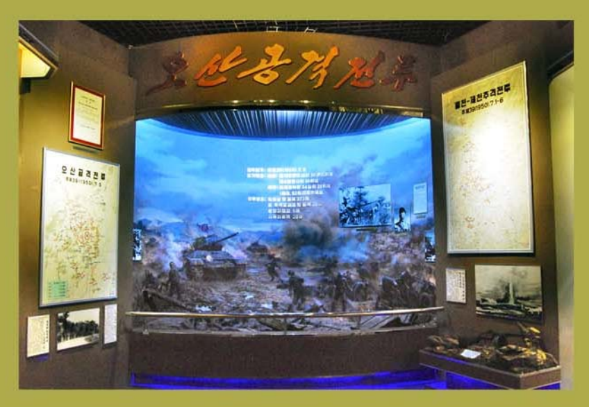
A picture of the offensive operations in Osan.

The story about the postponed time to attack Seoul was quite impressive. For fear that the Seoul citizens might be injured and the precious cultural heritage destroyed if the fight took place at night, Kim Il Sung saw to it that the battle was postponed to the next day. This fact