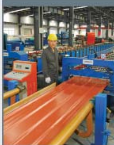
Chollima General Building-Materials Factory